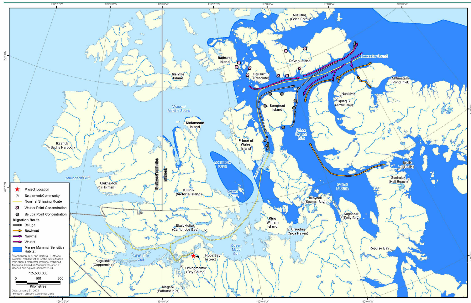
Figure 2-2: Key Habitat for Marine Mammals along the Nominal Shipping Route