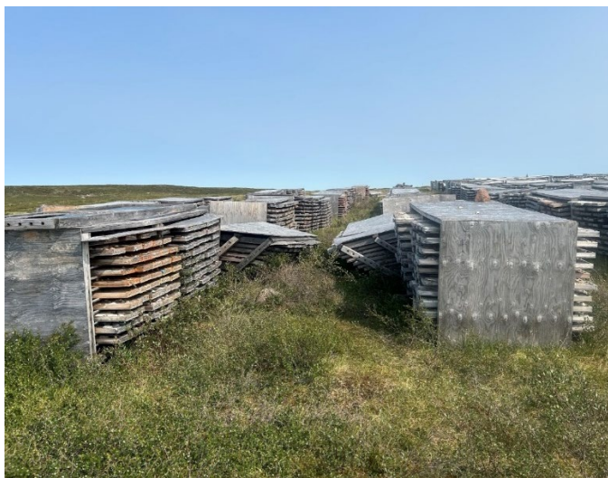
Photo 1-8 Scissored core racks