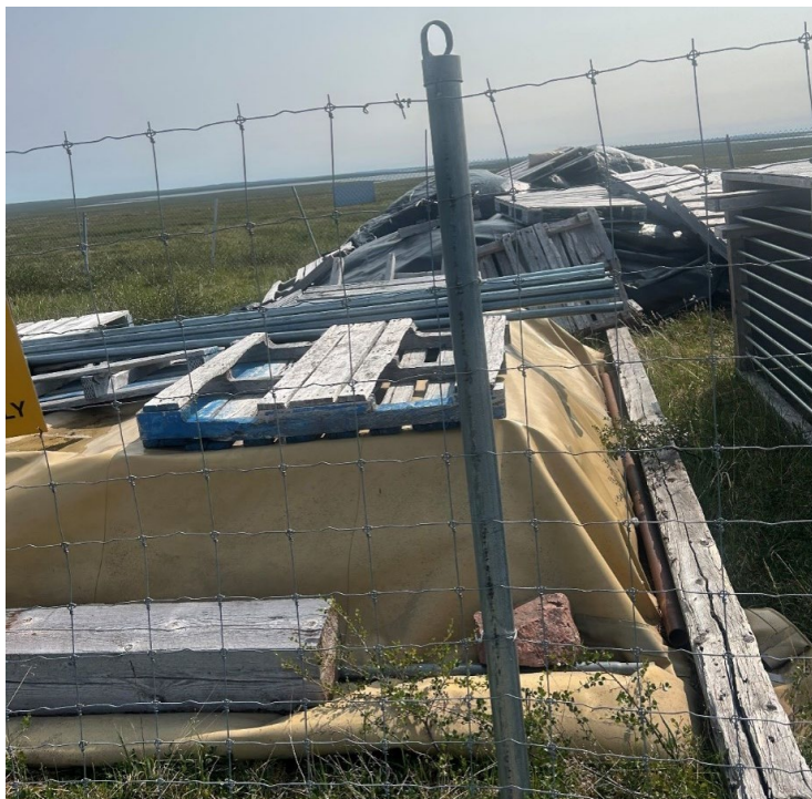
Photo 1-7 Berm in radioactive storage compound containing drums of mineralized cuttings