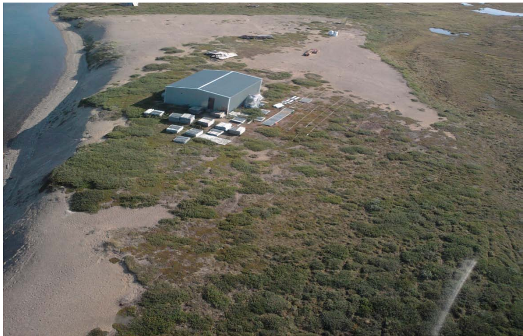
Hood - post cleanup shot from the air of drill core storage shed