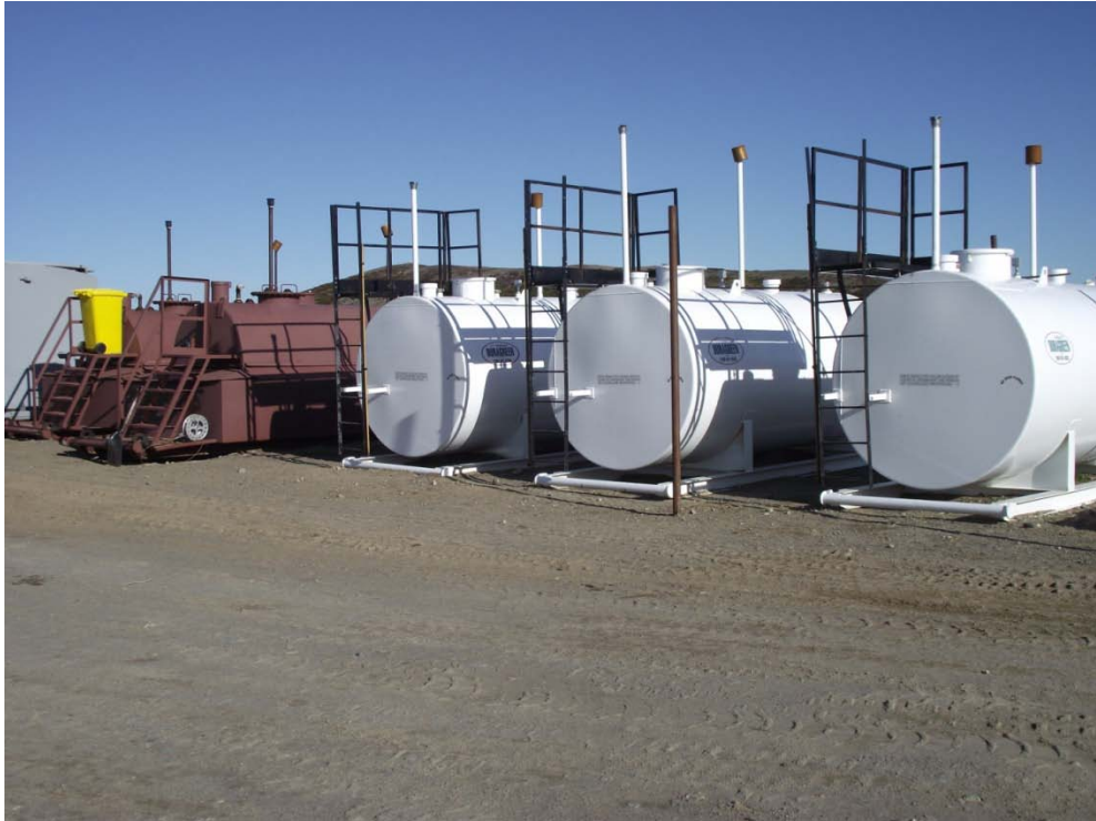
Fuel farm 11,000L double walled storage tanks with spill kit – August 2011