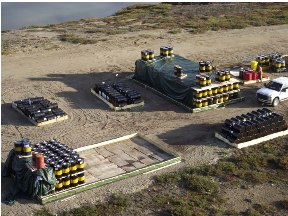
Drum storage onsite with secondary containment berms – July 2011