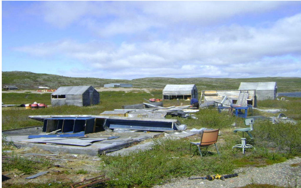
Hood - Prior to cleanup showing plywood clad structures and general site condition