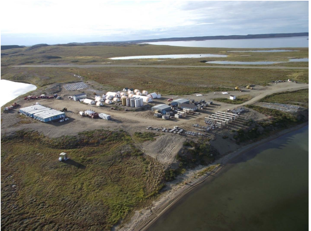
Izok Camp on Ham Lake showing airstrip in the background – August 2011