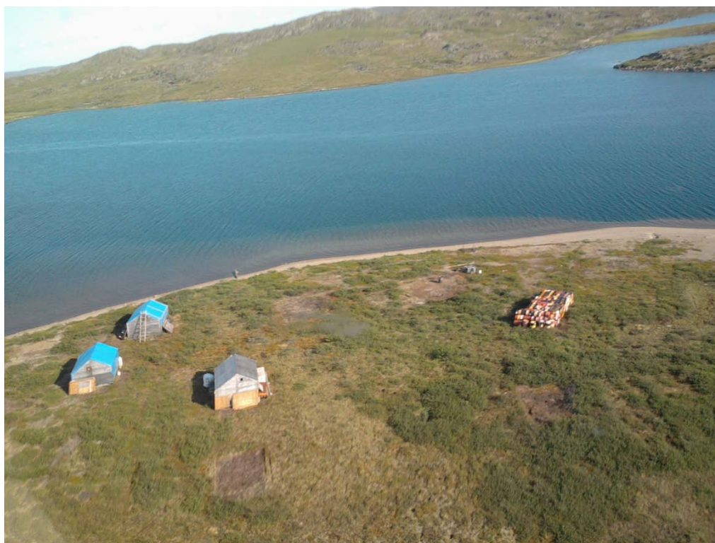
Hood site - post cleanup from the air showing 'lower camp' and empty drums ready for removal in March 2012