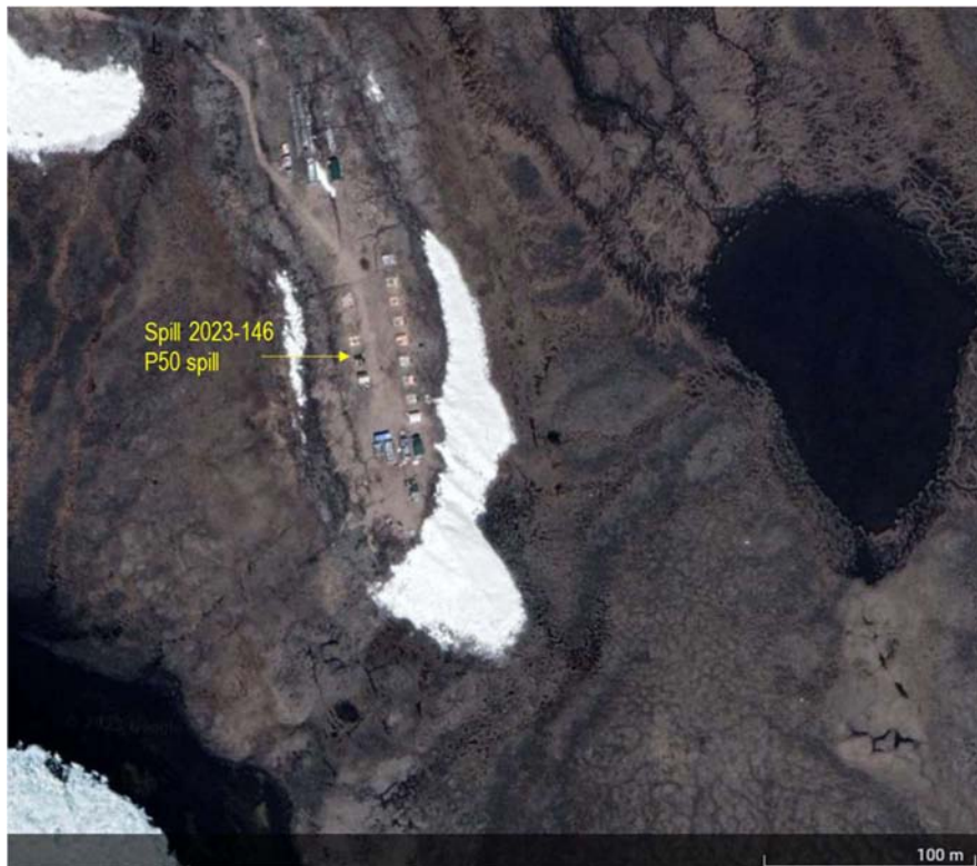
Figure 1: Location of the P50 spill and proximity to water bodies.