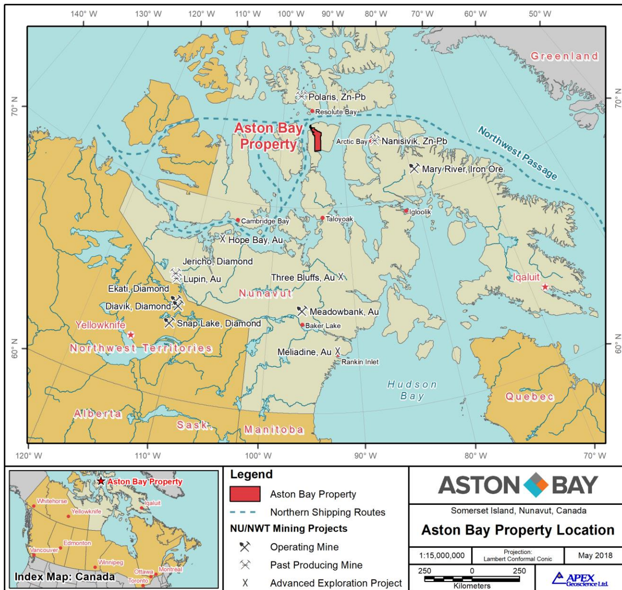
Figure 1 Aston Bay Property Location