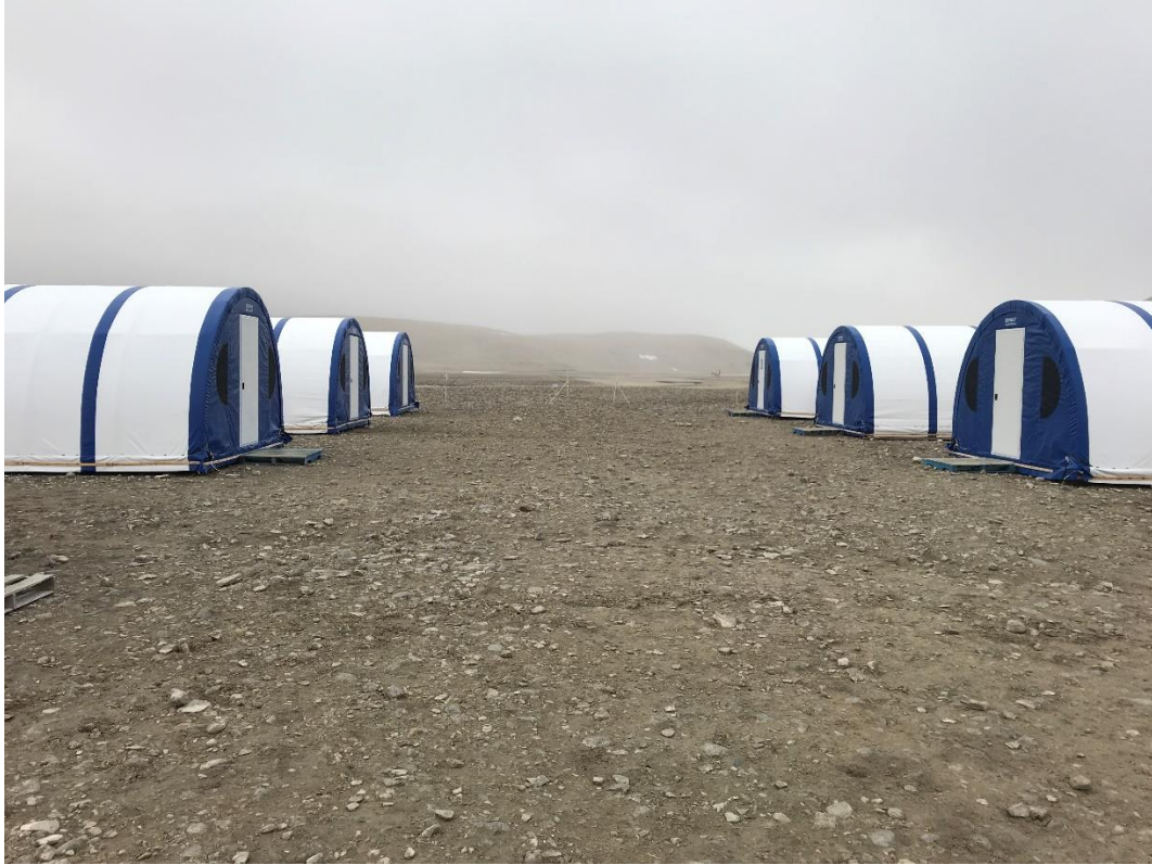
Photo 3: Storm Camp during demobilization – main street (looking west)