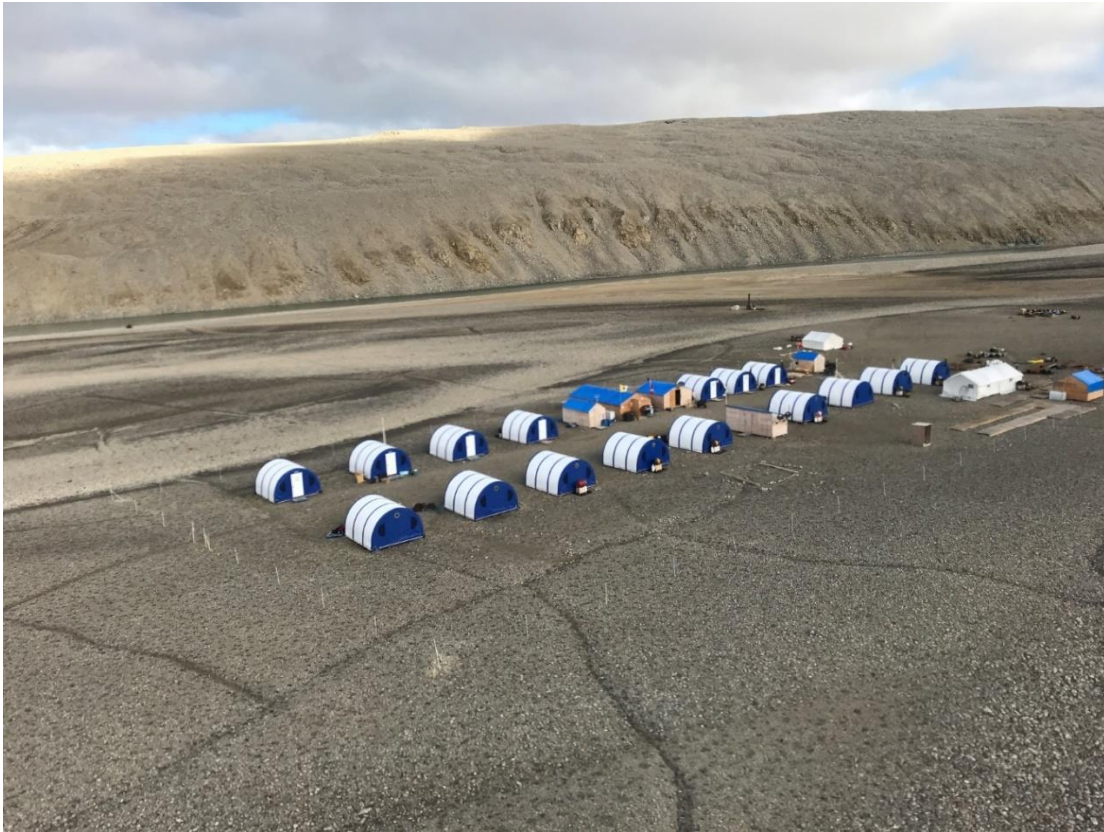
Photo 1: Storm Camp during operations - aerial (looking northeast)