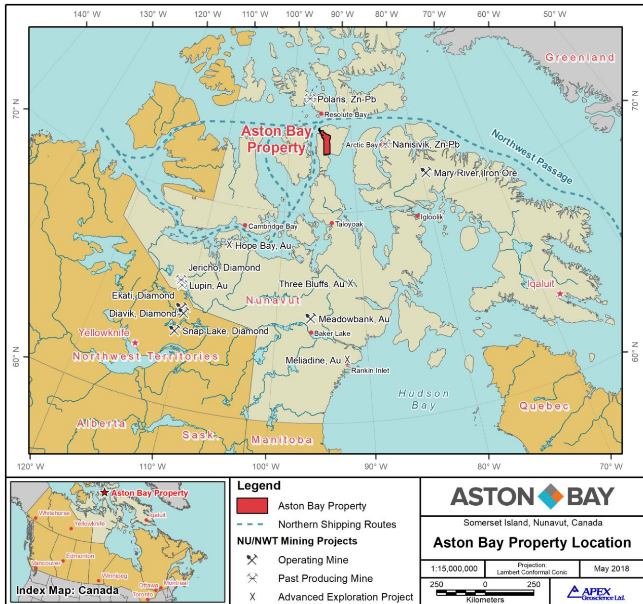
Figure 1 Aston Bay Property Location