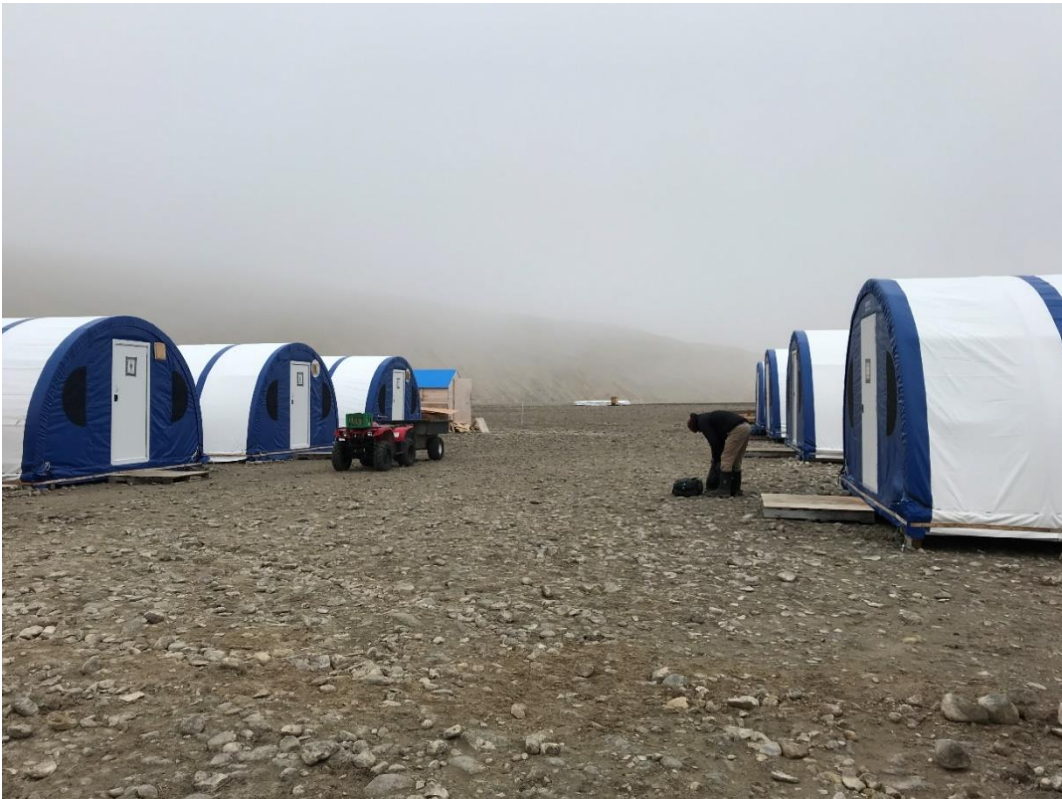
Photo 4: Storm Camp during demobilization – main street (looking east)