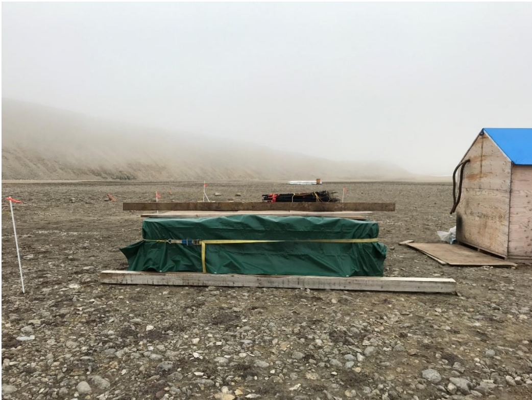
Photo 6: Storm Camp diesel/gas fuel cache after shutdown (looking east)