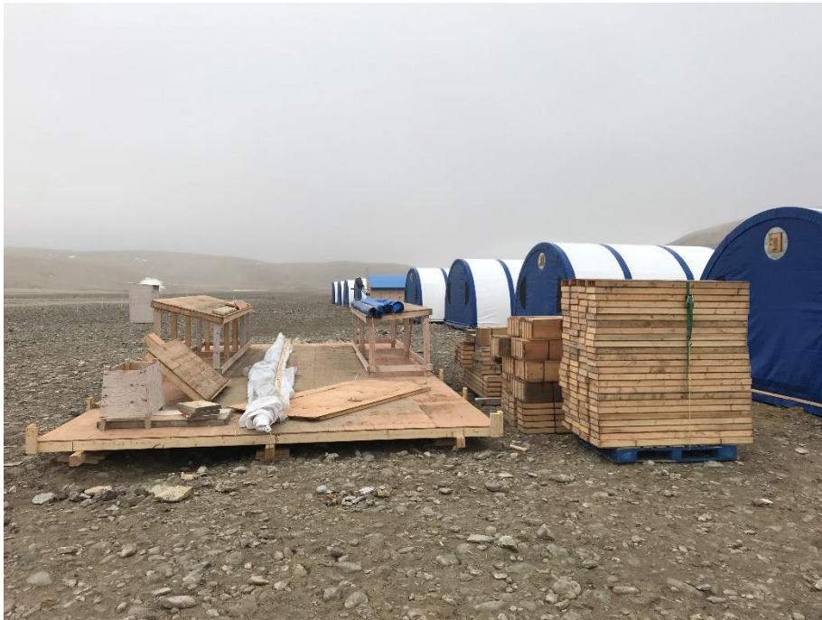
Photo 2: Storm Camp during demobilization – south side of camp (looking west)