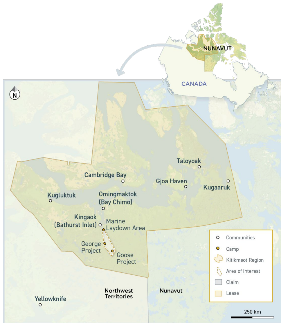
Figure 5-1: Project Area, Regional Perspective