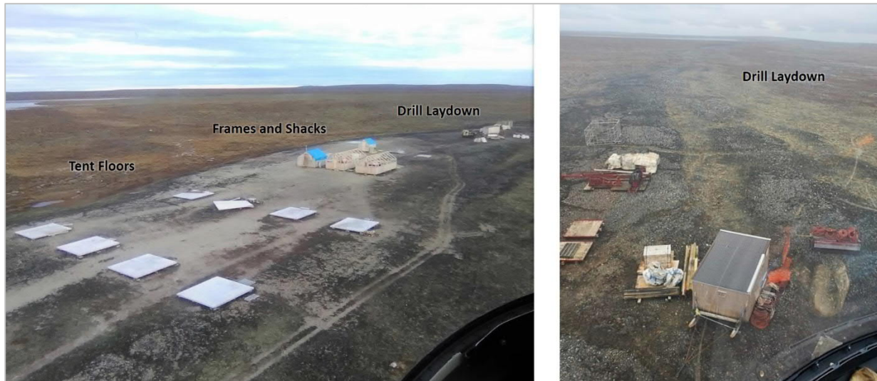
FIGURE 7: KAHUNA CAMP (CLOSED 2019) AND DRILL EQUIPMENT LAYDOWN