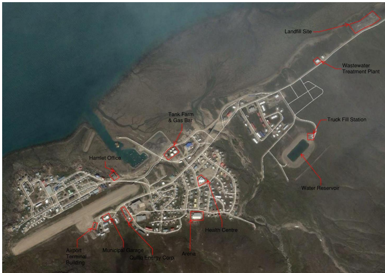
Figure 1: Location of Various Facilities, Pangnirtung, NU

The following paragraphs describe the facilities and/or activities which might result in a spill event or an emergency situation that might impair the environmental and/or human health.