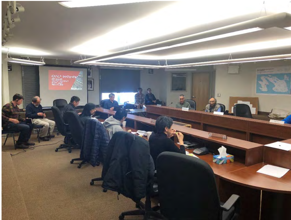
Photo B.5 - April 6 Hamlet of Igloodik community meeting