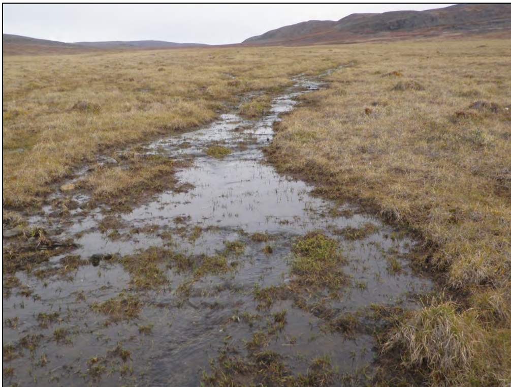
Figure 11. View upstream near the proposed access road crossing EBS-02.