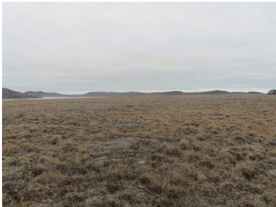
Photo B.4 - Approximate camp location, looking south