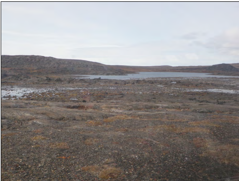
Figure 13. View of site EBS-05 near the confluence with Lake EB-2.