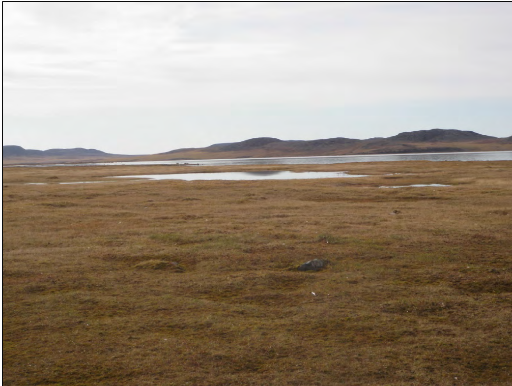
Figure 2. Shoreline of Lake EB-1 with adjacent shallow ponds.