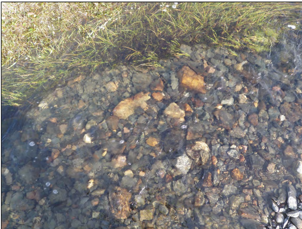
Figure 5. Substrate in stream near the proposed access road crossing EBS-01.