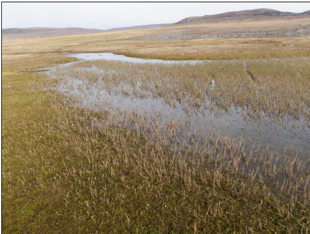
Figure 9. View downstream in stream EBS-01 near the confluence with Lake EB-1.