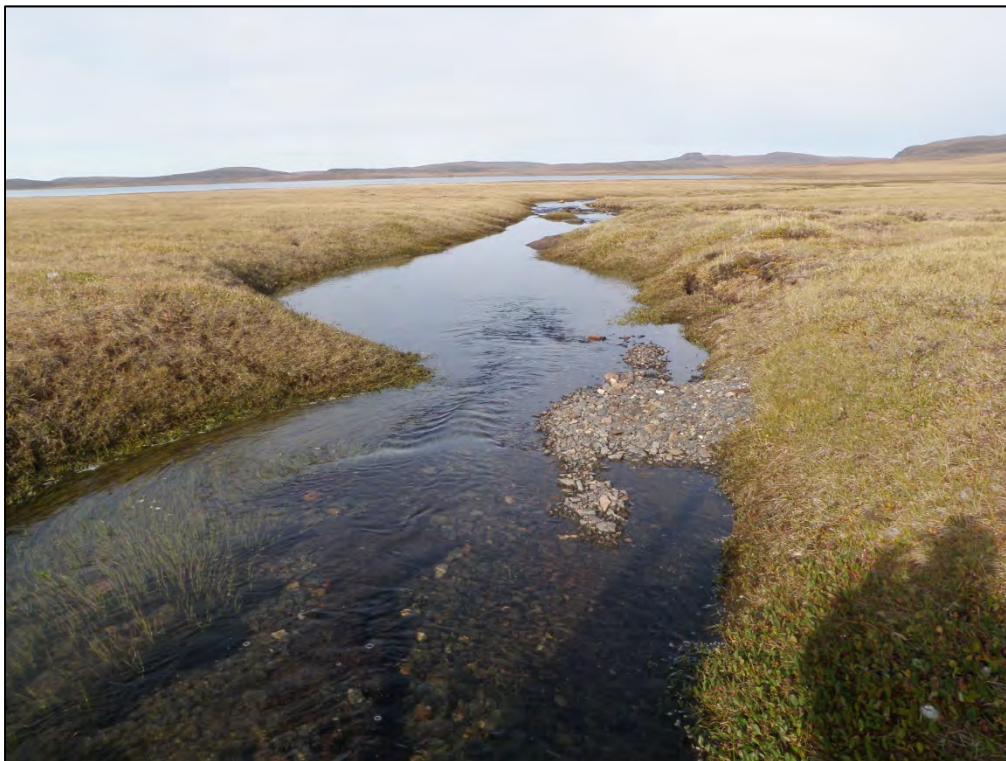
Figure 7. View downstream from the proposed EBS-01 access road crossing.