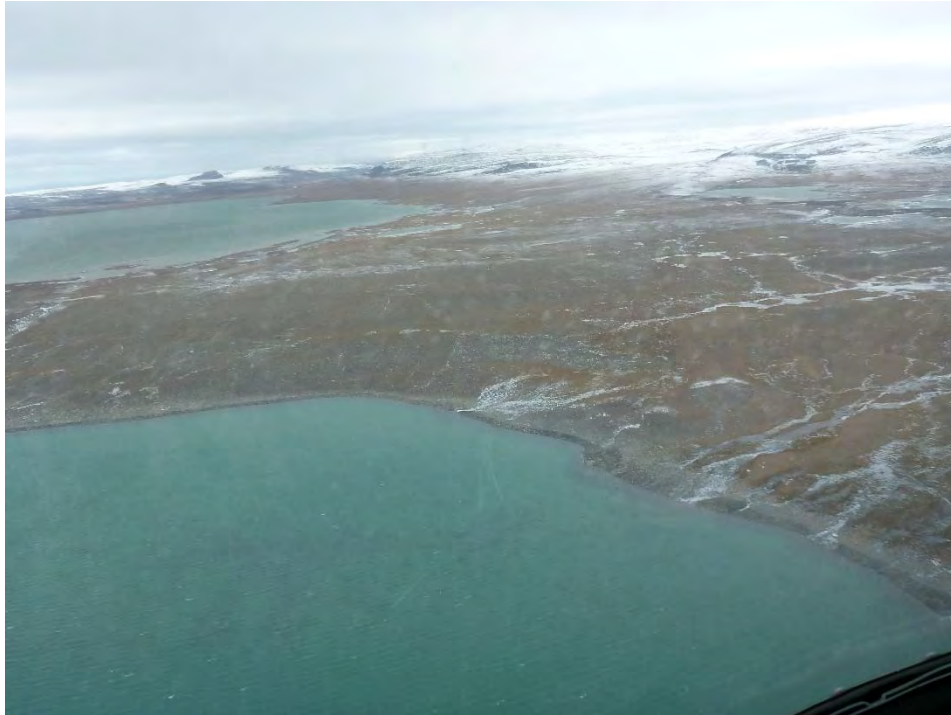
Photo B.1 - Aerial of Ege Bay Exploration Area, looking north