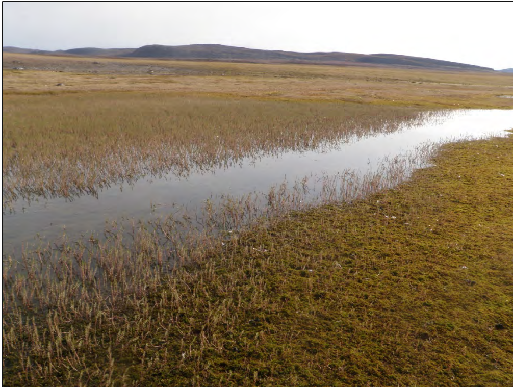
Figure 8. View upstream in stream EBS-01 near the confluence with Lake EB-1.