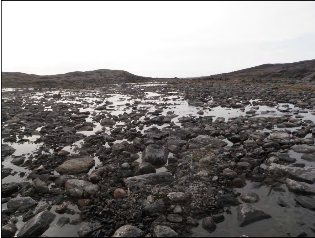
Figure 16. View of EBS-05 looking upstream.