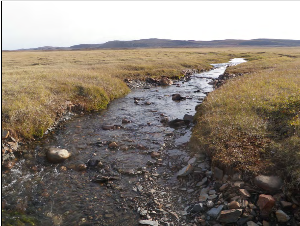
Figure 6. View upstream from the proposed access road crossing area at EBS-01.