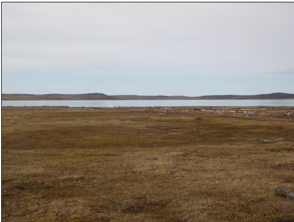
Figure 3. Shoreline of Lake EB-1.