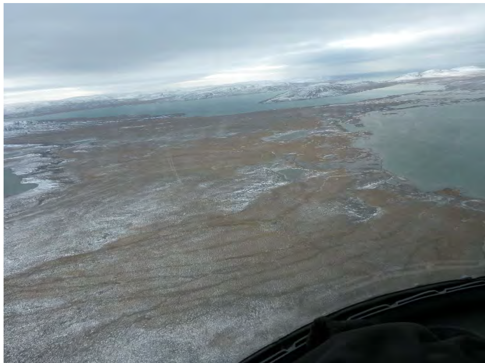
Photo B.2 - Aerial of Ege Bay Exploration Area, looking south