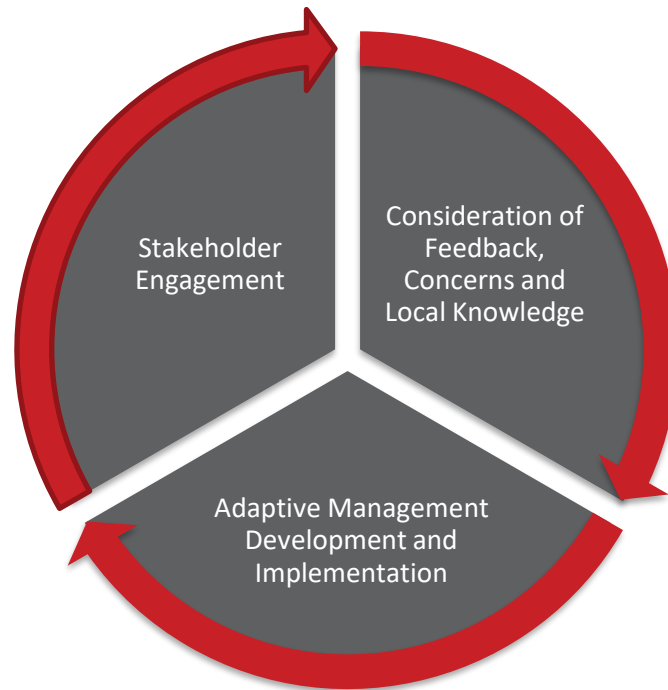
Figure 3 Baffinland’s Approach to Stakeholder Engagement

Meaningful stakeholder and Inuit community engagement is valued by Baffinland as a means of building and maintaining community relationships and continuously optimizing community benefits of the Program. Baffinland’s approach to stakeholder engagement emphasizes the importance of informing stakeholders, establishing effective communication strategies, and collecting feedback from stakeholders on potential issues and concerns (Figure 3).