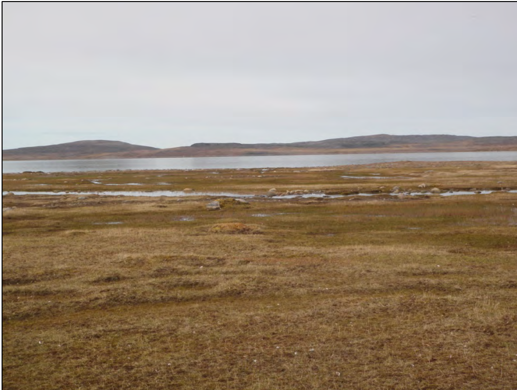
Figure 4. View of Lake EB-1 and stream crossed by EBS-01.