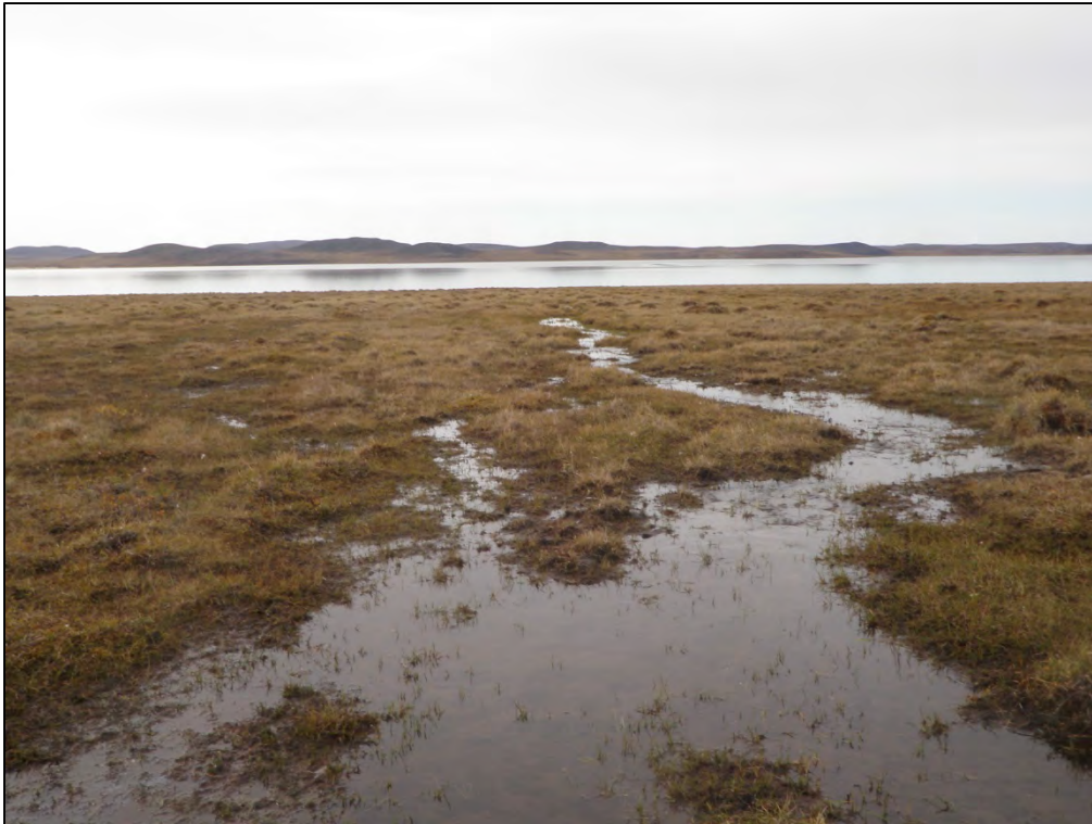
Figure 12. View downstream near the proposed access road crossing EBS-02.