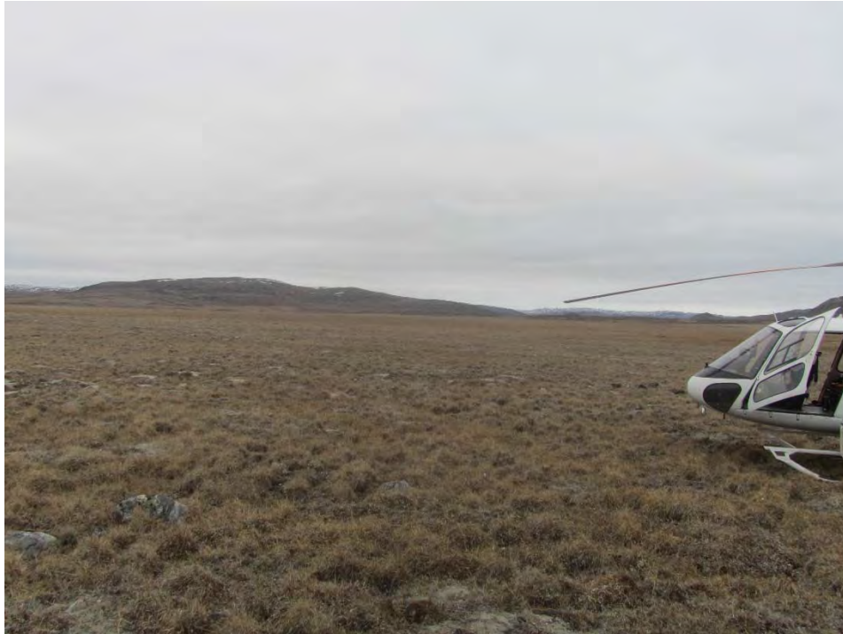
Photo B.3 - Approximate camp location, looking northeast