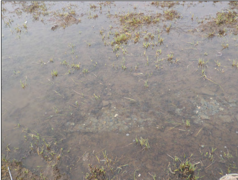
Figure 10. Substrate in stream EBS-02.