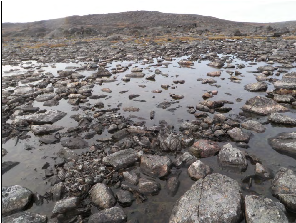
Figure 14. Substrate near the proposed access road crossing EBS-05.