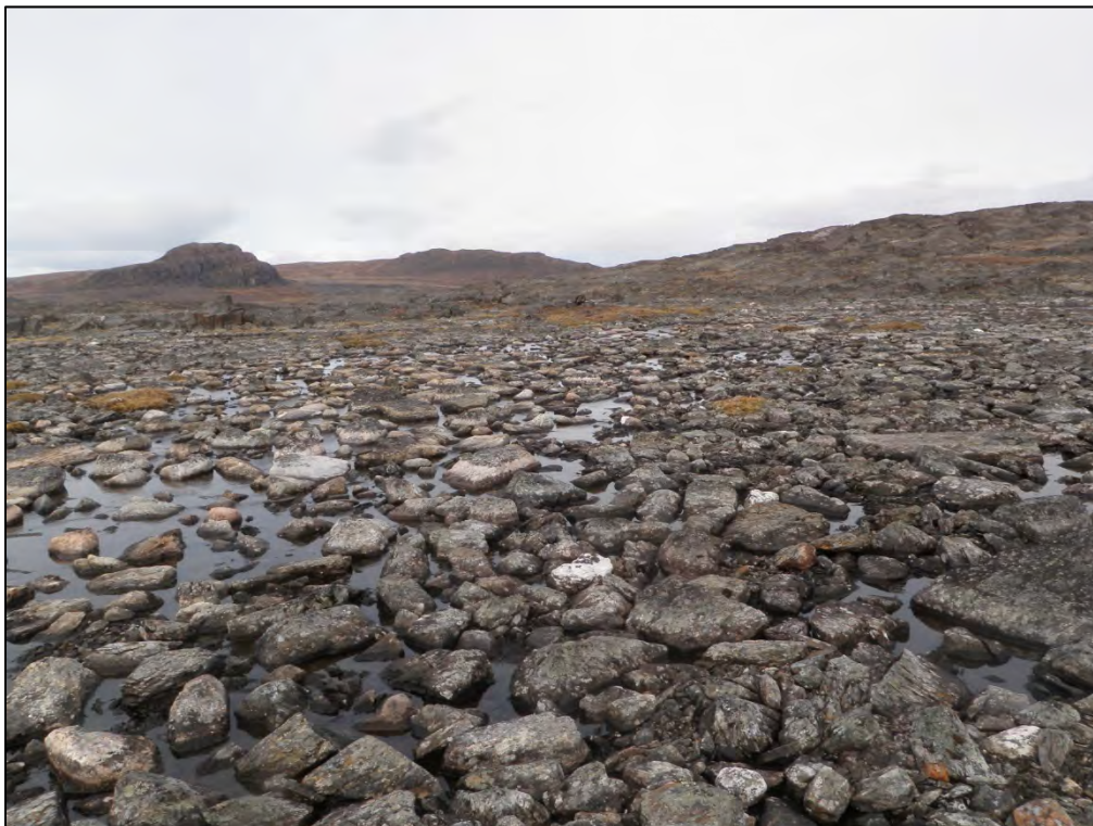
Figure 15. View of EBS-05 looking towards the nearby lake.