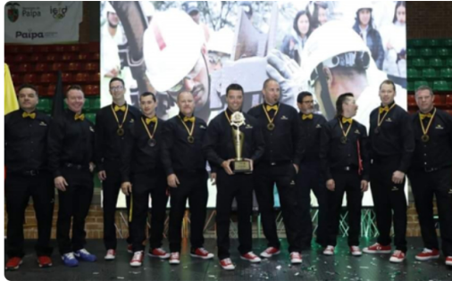
Agnico Eagle's Mine Rescue Team Shines in Colombia