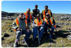
Pistol Bay Visit