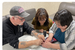
Stitching Together Traditions