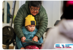
First Book Canada