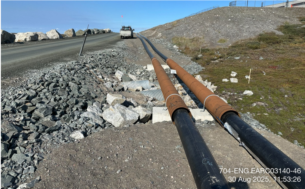
Itivia Bypass Road/ Culvert - Photo 7:

☉ 309°NW (T) ● 15 N 545438 6964084 ±24m ▲ 6m