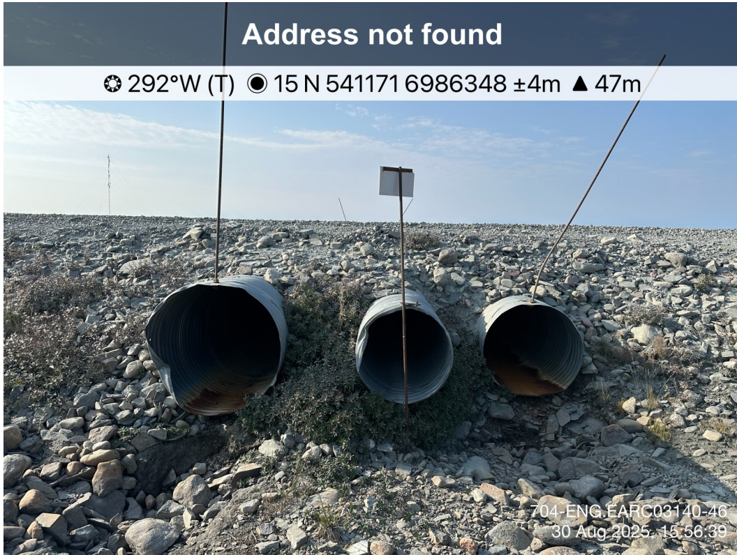
AWAR Road/ Culvert - Photo 73: Culvert KM 27.6 : Outlet.