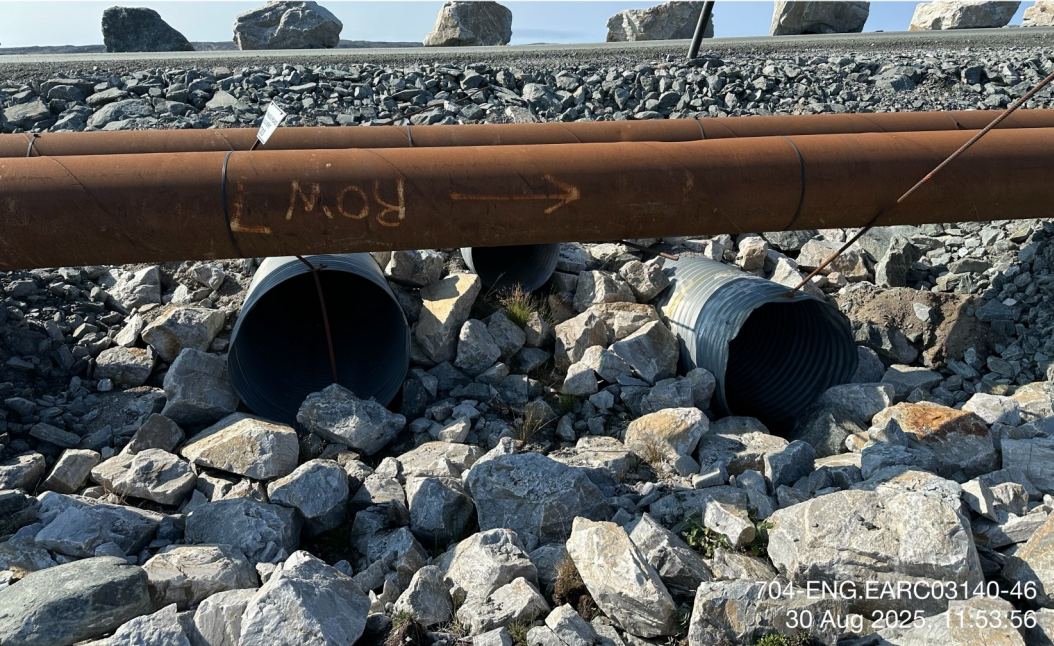
Itivia Bypass Road/ Culvert - Photo 8:

☉ 241°SW (T) ● 15 N 545437 6964098 ±4m ▲ 6m