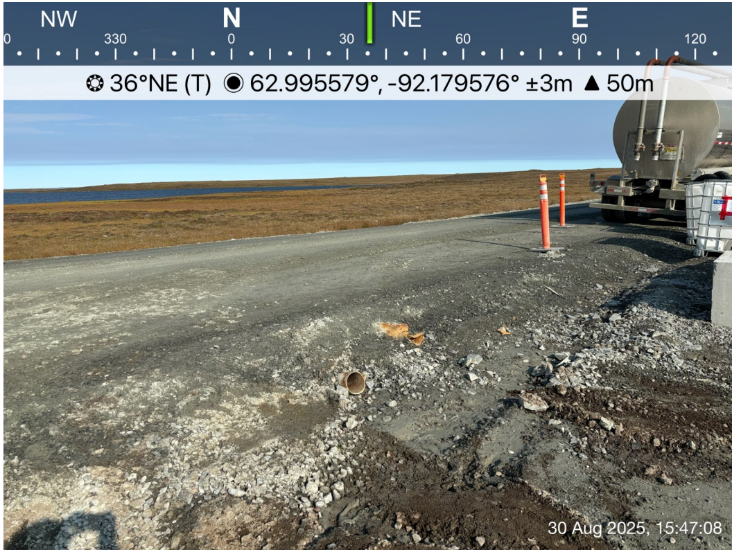
AWAR Road/ Culvert - Photo 67: Pipe Sleeve KM 26.2 : Outlet.