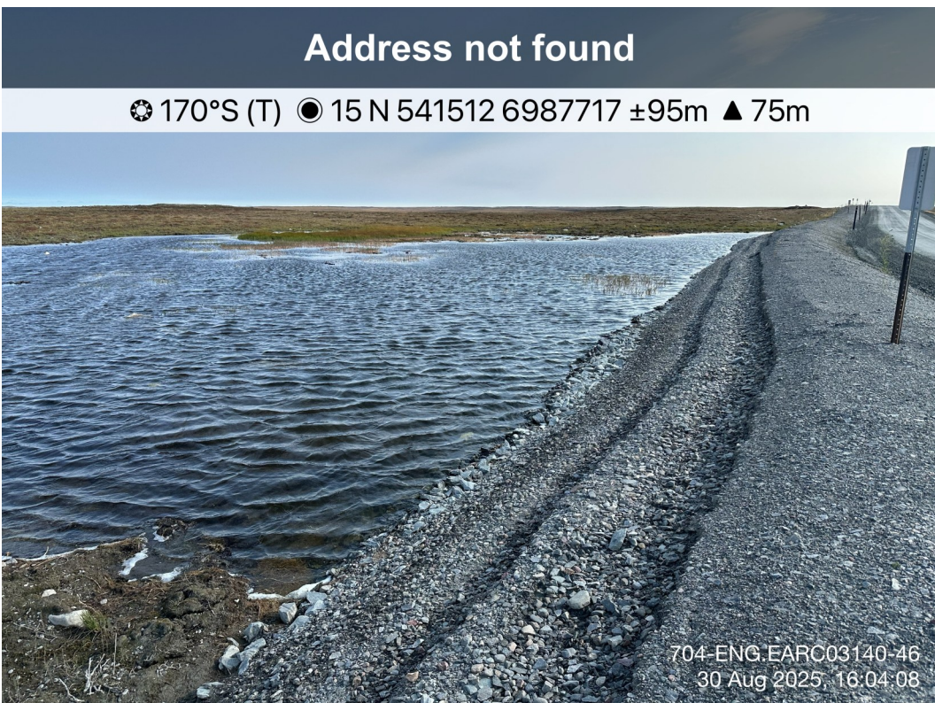
AWAR Road/ Culvert - Photo 74: KM 28.7: No culverts installed, high water marks, erosion, and ponding water on upstream side.