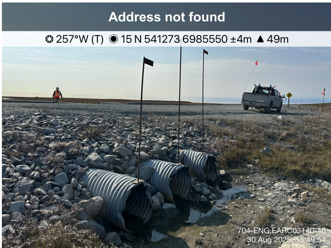
AWAR Road/ Culvert - Photo 68: Culvert KM 26.6 : Inlet.