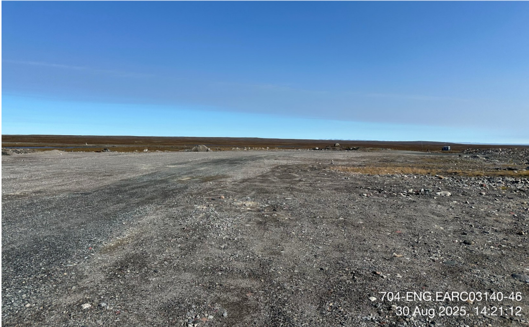
AWAR Borrow Source - Photo 77: KM 11.7: Borrow source south of AWAR.

☉ 81°E (T) ● 15 N 546550 6971309 ±5065m ▲ 14m