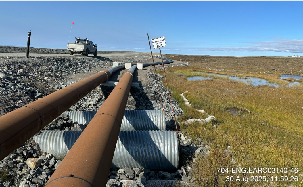
Itivia Bypass Road/ Culvert - Photo 12:

☉ 272°W (T) ● 15 N 545093 6964299 ±4m ▲ 7m