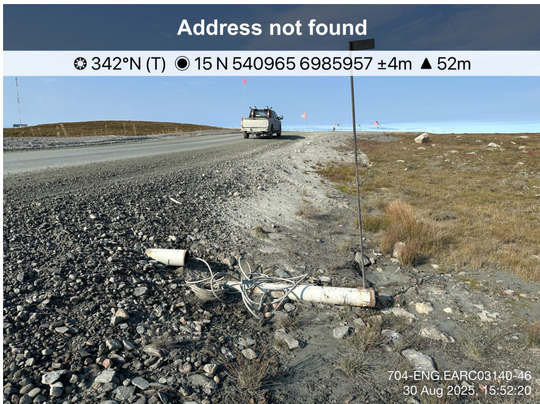
AWAR Road/ Culvert - Photo 70: Pipe Sleeve KM 26.8: Outlet.