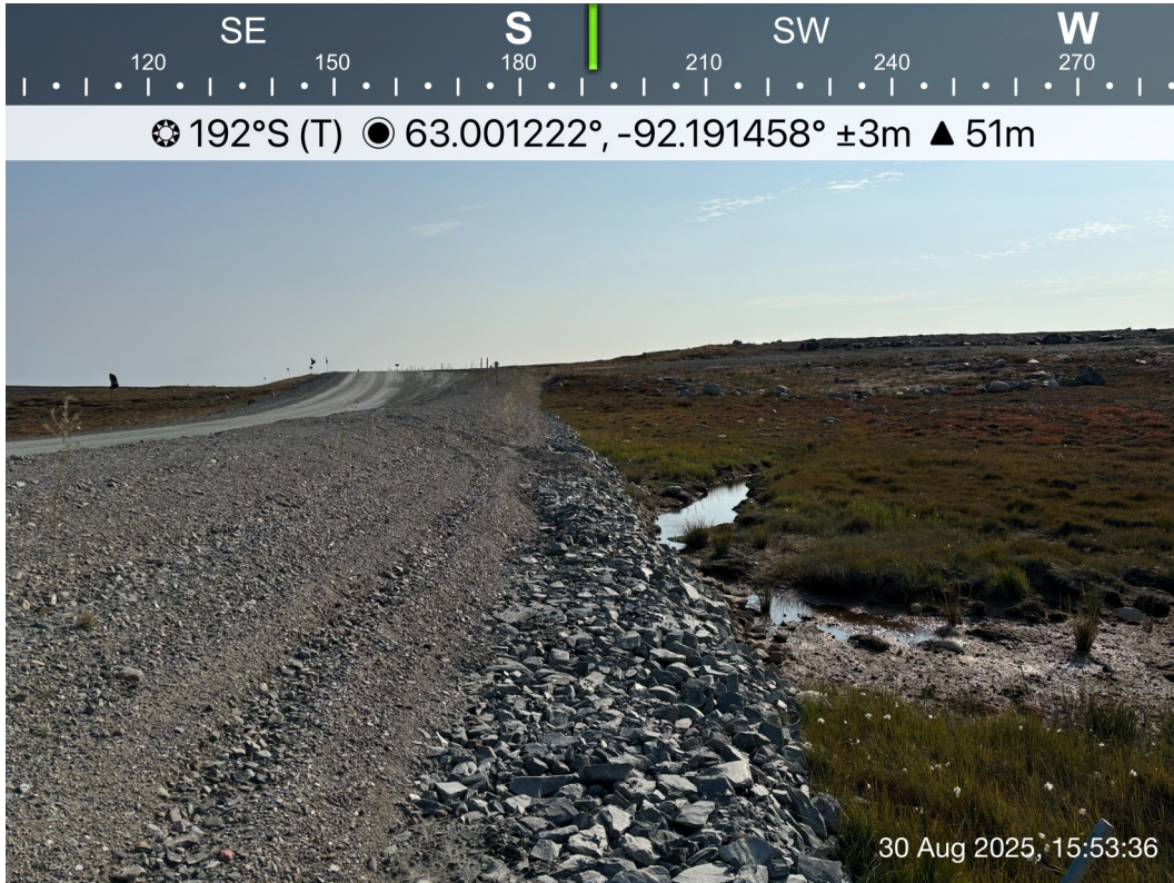
AWAR Road/ Culvert - Photo 71: Pipe Sleeve KM 26.8 : Inlet has been blocked by new AWAR waterline, high water marks from ponding water seen on waterline bedding slope.