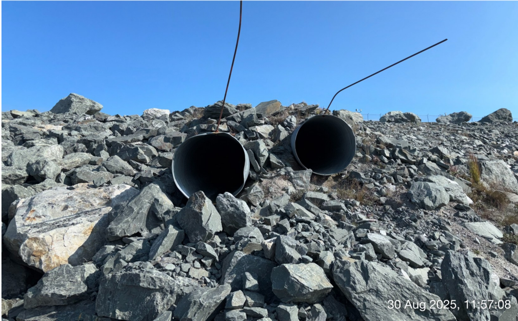
Itivia Bypass Road/ Culvert - Photo 11:

☉ 55°NE (T) ● 62.805559°, -92.113839° ±3m ▲ 4m