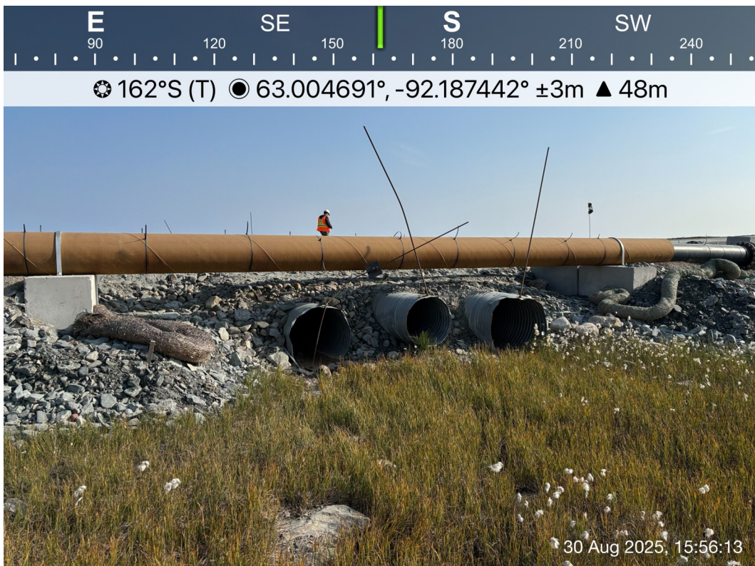
AWAR Road/ Culvert - Photo 72: Culvert KM 27.6 : Inlet.