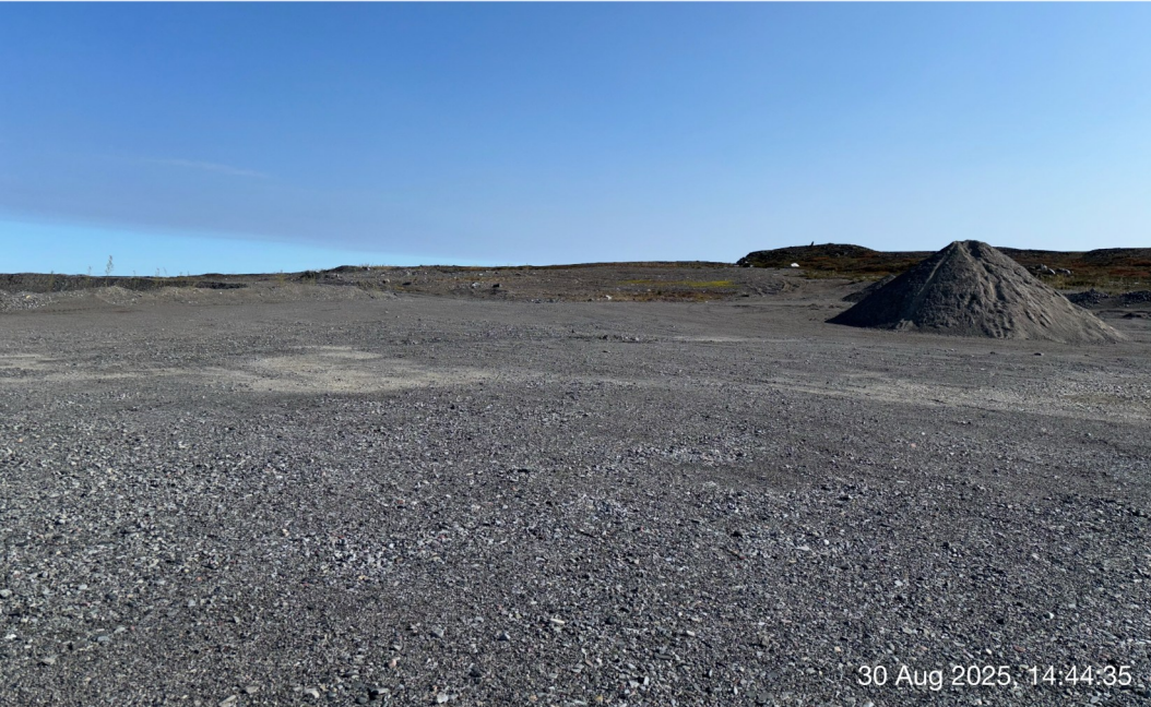
AWAR Borrow Source - Photo 78: KM 14.7: Borrow source west of AWAR.

☉ 126°SE (T) ● 62.920105°, -92.066472° ±3m ▲ 66m