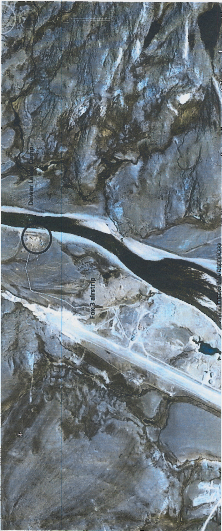
Figure 1: Google image of the Dewar Lakes Camp