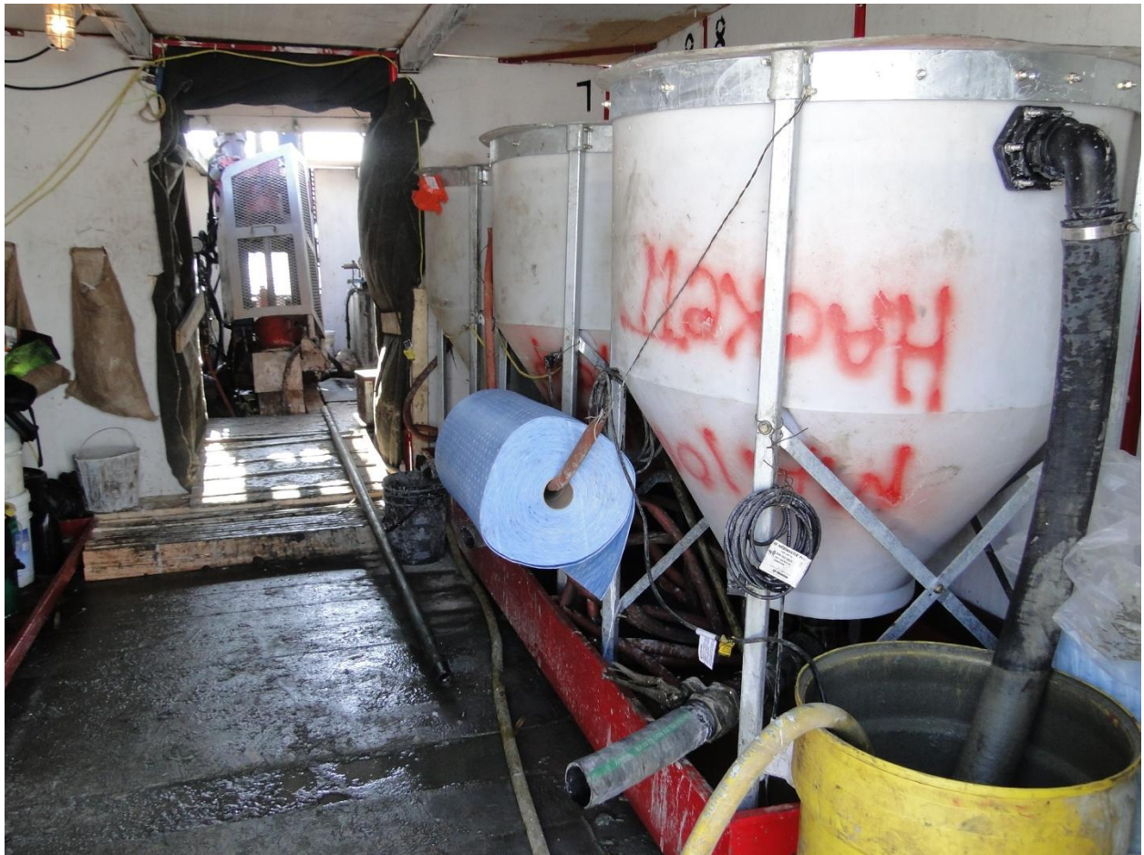
Figure 5. New water recirculation system implemented in 2013.