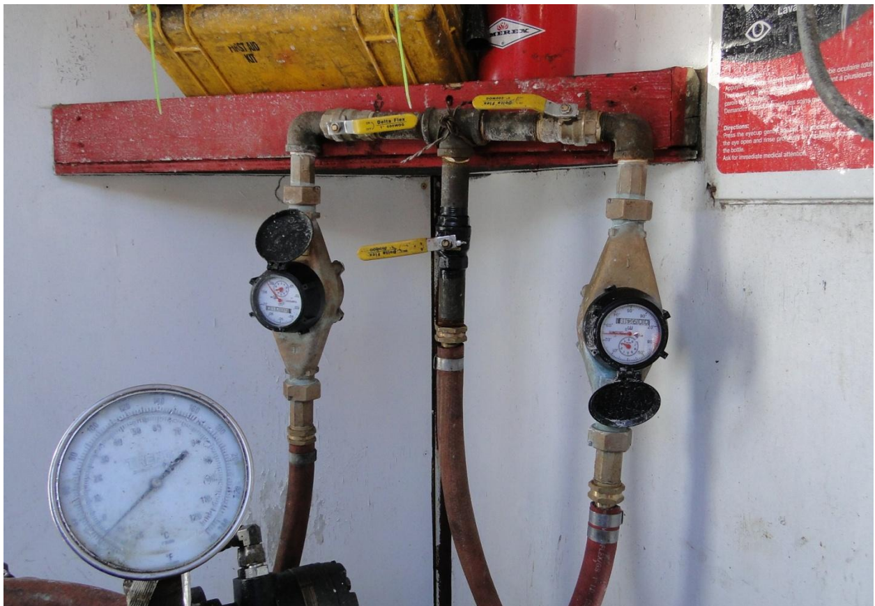
Figure 2. New water metering system.