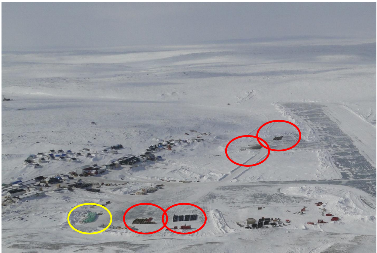
Figure 8. Areas of fuel (red circles) and salt (yellow circle). The rest is mostly drill and construction materials.