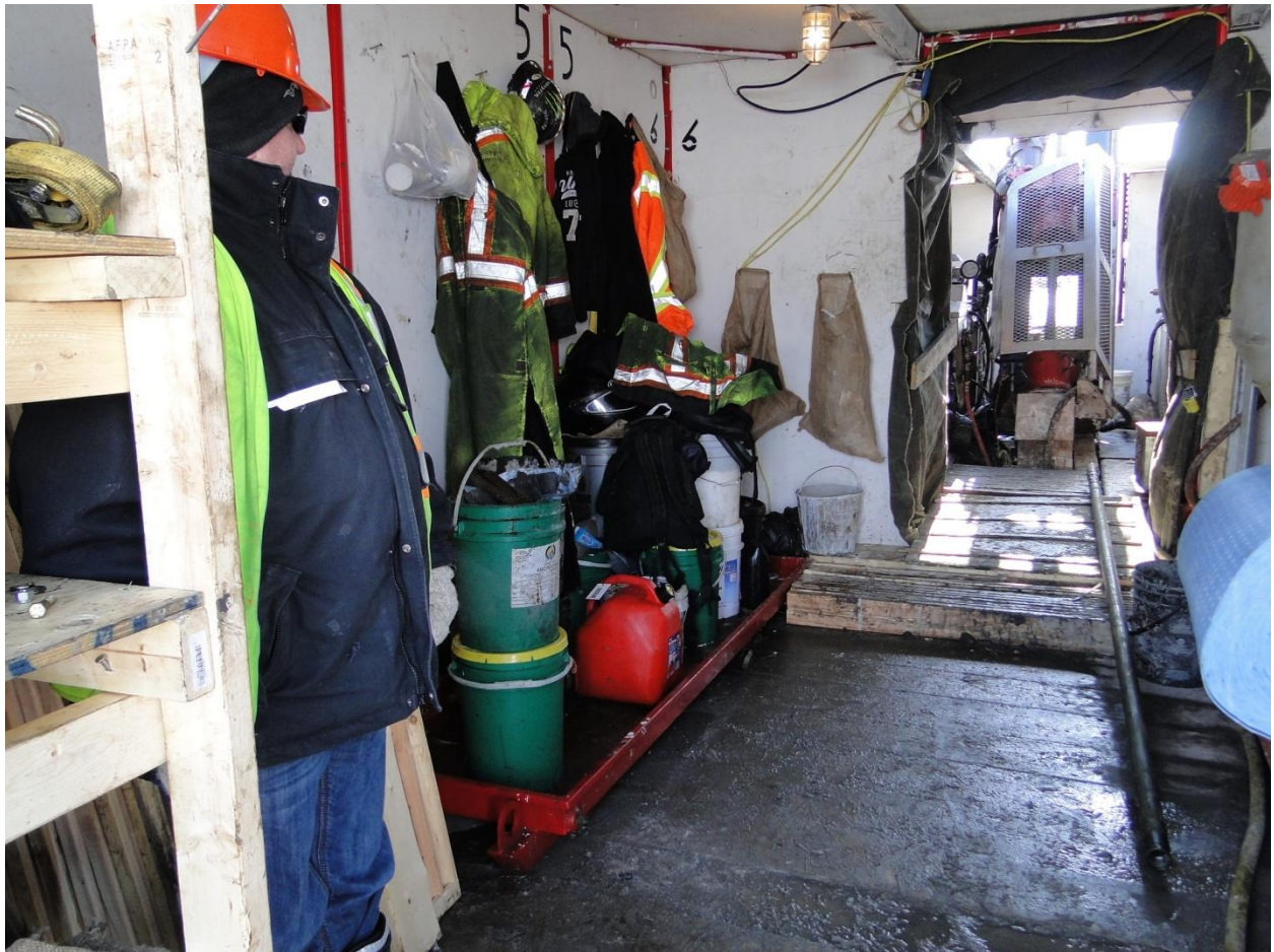
Figure 7. Warm and well-organized drill shack. Muds and oils all in a spill tray, bags for sorting garbage hanging on wall.