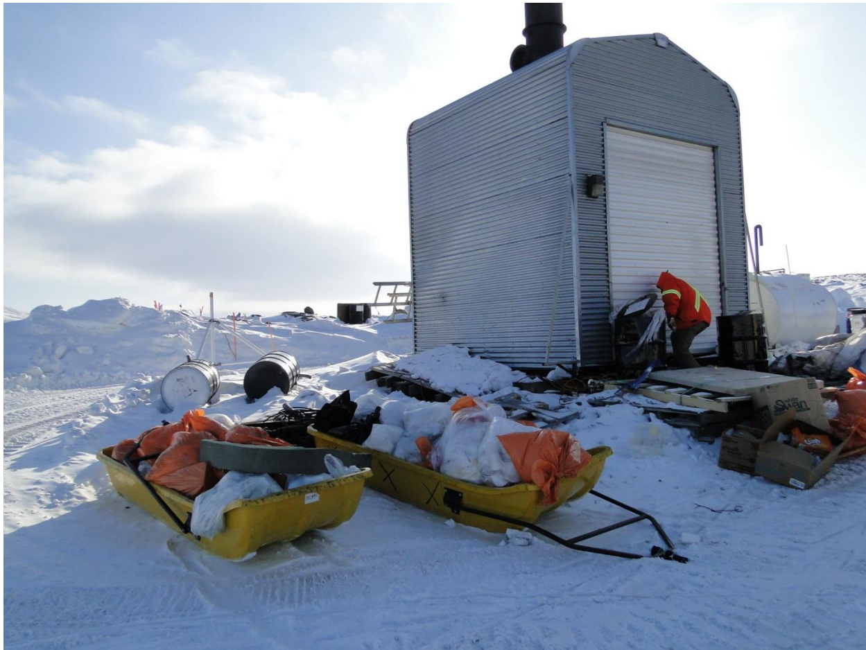
Figure 3. Backlog at incinerator.