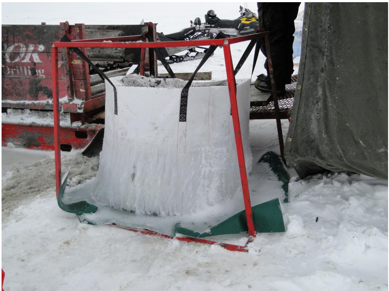
Figure 6. Mega-bag of sludge, weeping saline drill water. Must be contained, particularly on ice.