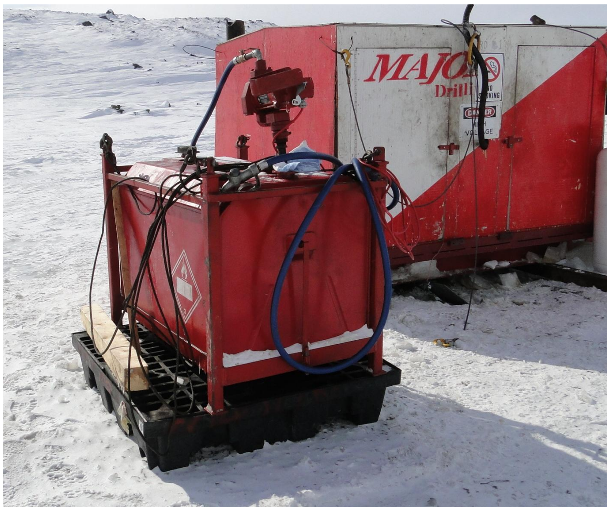
Figure 9. Tidy tank balanced on a small spill tray; does not provide room for the hose and nozzle etc.