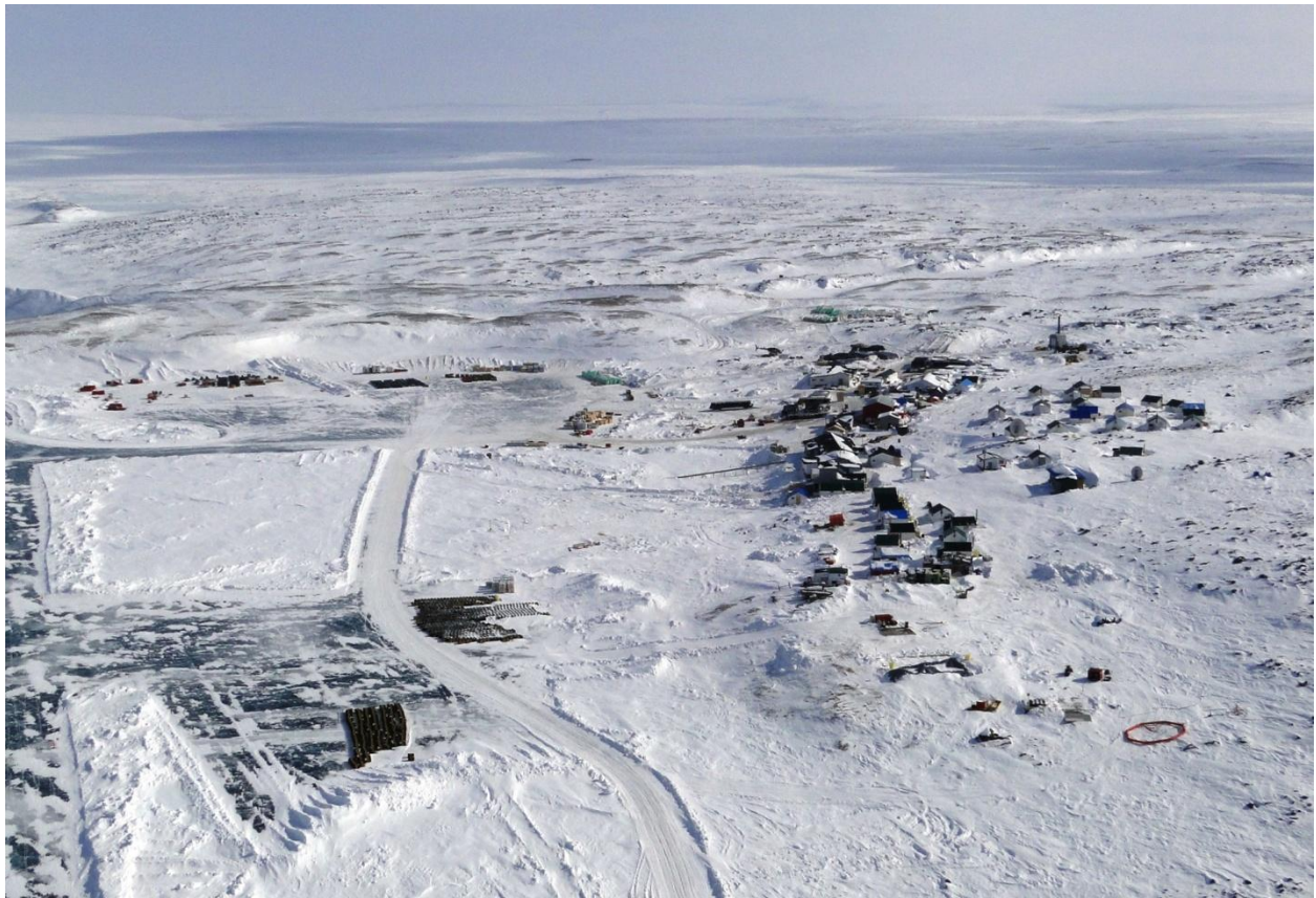
Figure 1. Hackett Camp and Airstrip April 23, 2013