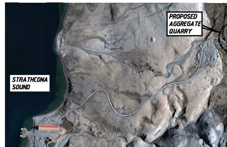
KEY PLAN SCALE= 1:20,000