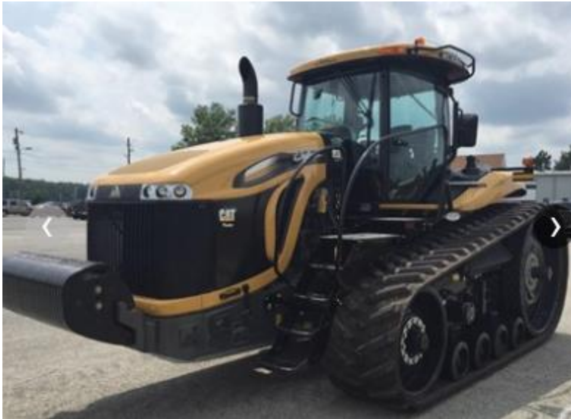
Figure 2, Example of tracked tractor (Challenger)