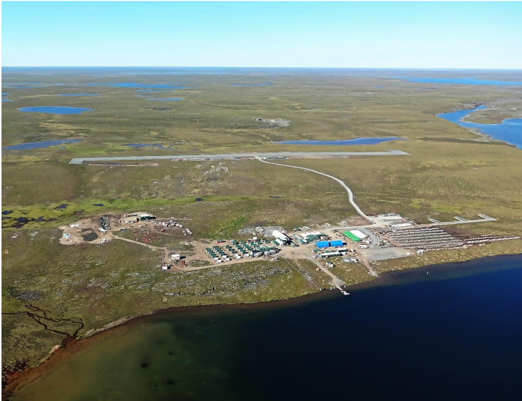
Figure 2. Aerial image of Goose camp looking west. Photograph taken August, 2013.