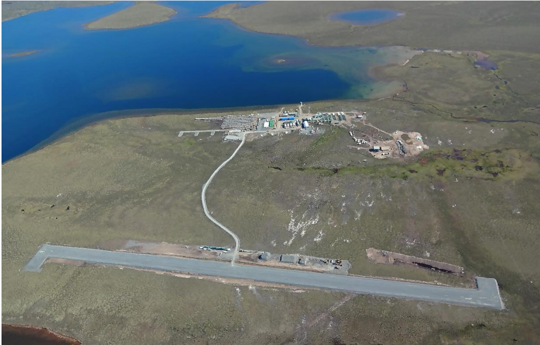
Figure 3. Aerial image of Goose camp looking east. Photograph taken August, 2013