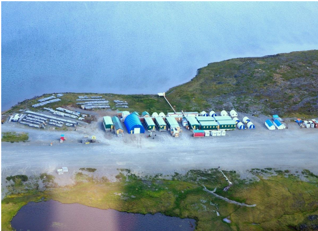
Figure 4. Aerial image of George camp looking east. Photograph taken October, 2013.