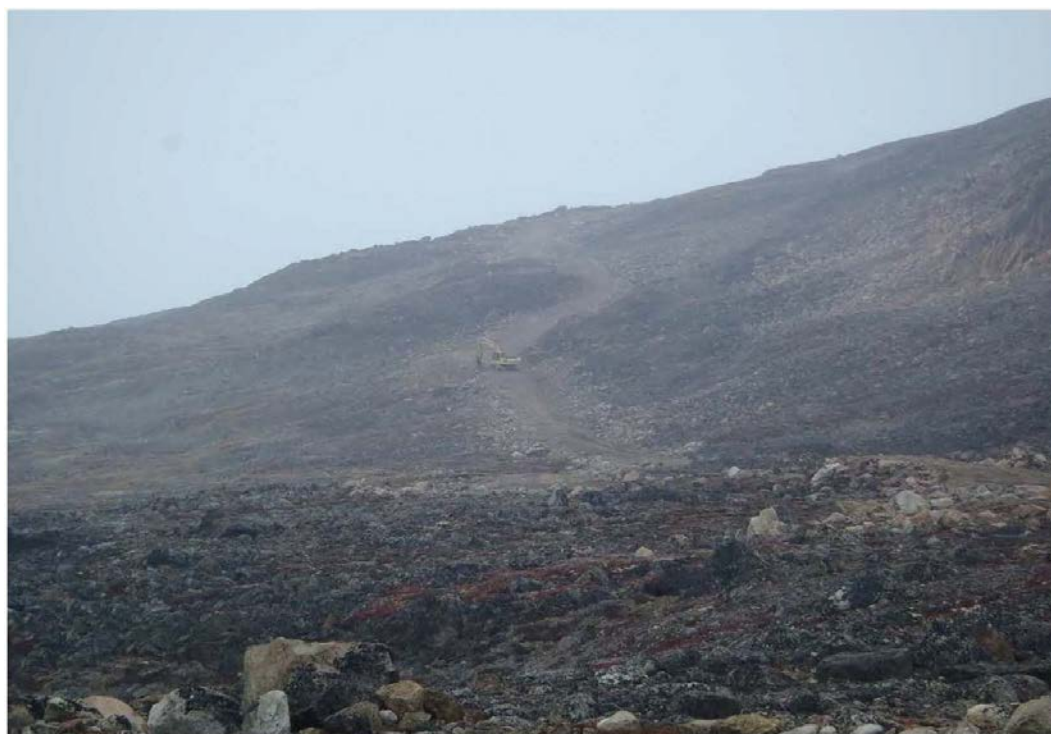
Figure 6. Upgrading access road to Upper Site at FOX-D Kivitoo.