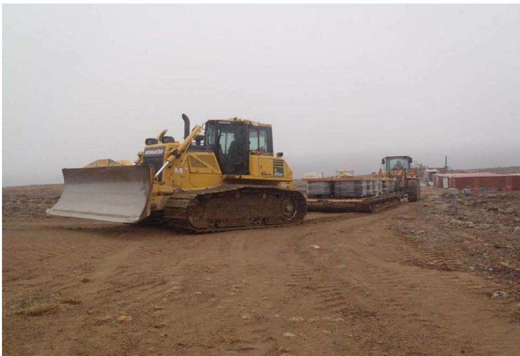
Figure 5. Hauling fuel to fuel storage area at FOX-D Kivitoo.