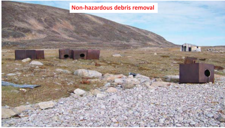
Non-hazardous debris removal