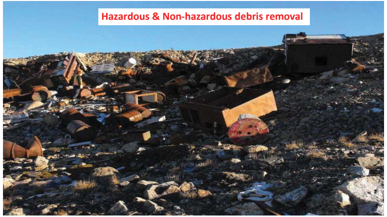
Hazardous & Non-hazardous debris removal