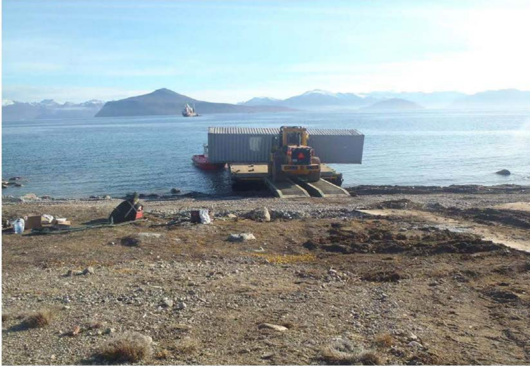
Figure 3. Offloading sealift at FOX-D Kivitoo.