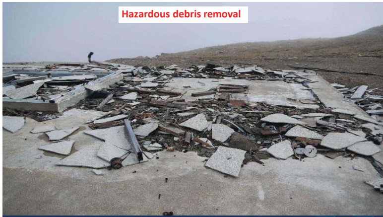
Hazardous debris removal