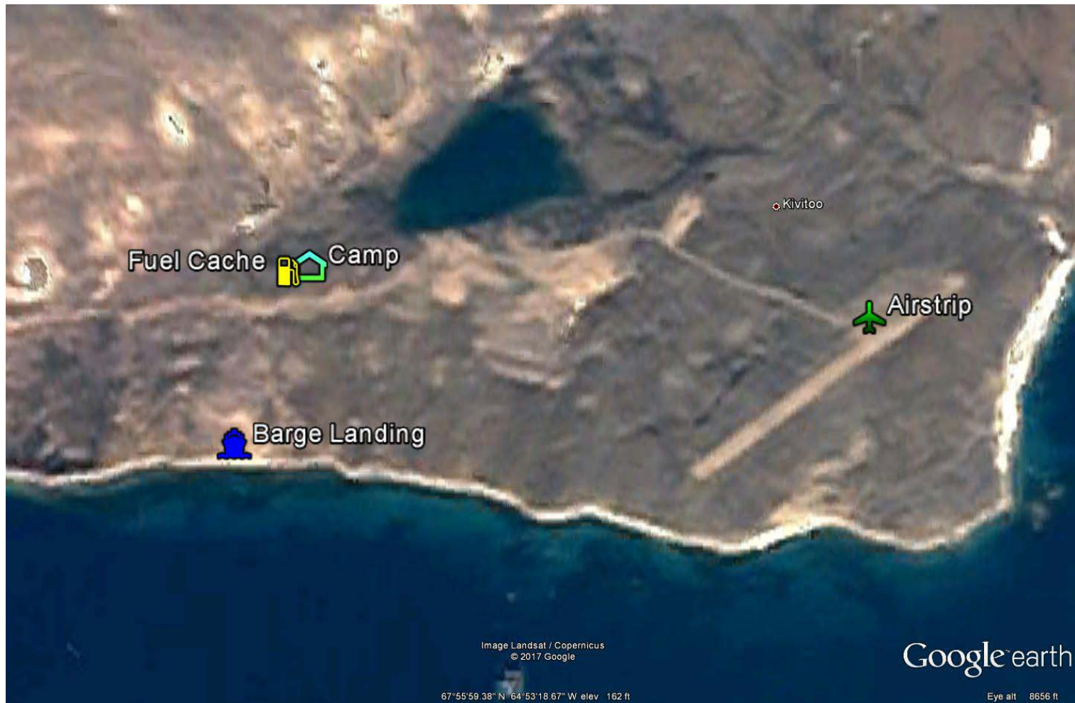
Figure 2. FOX-D Kivitoo lower site map.