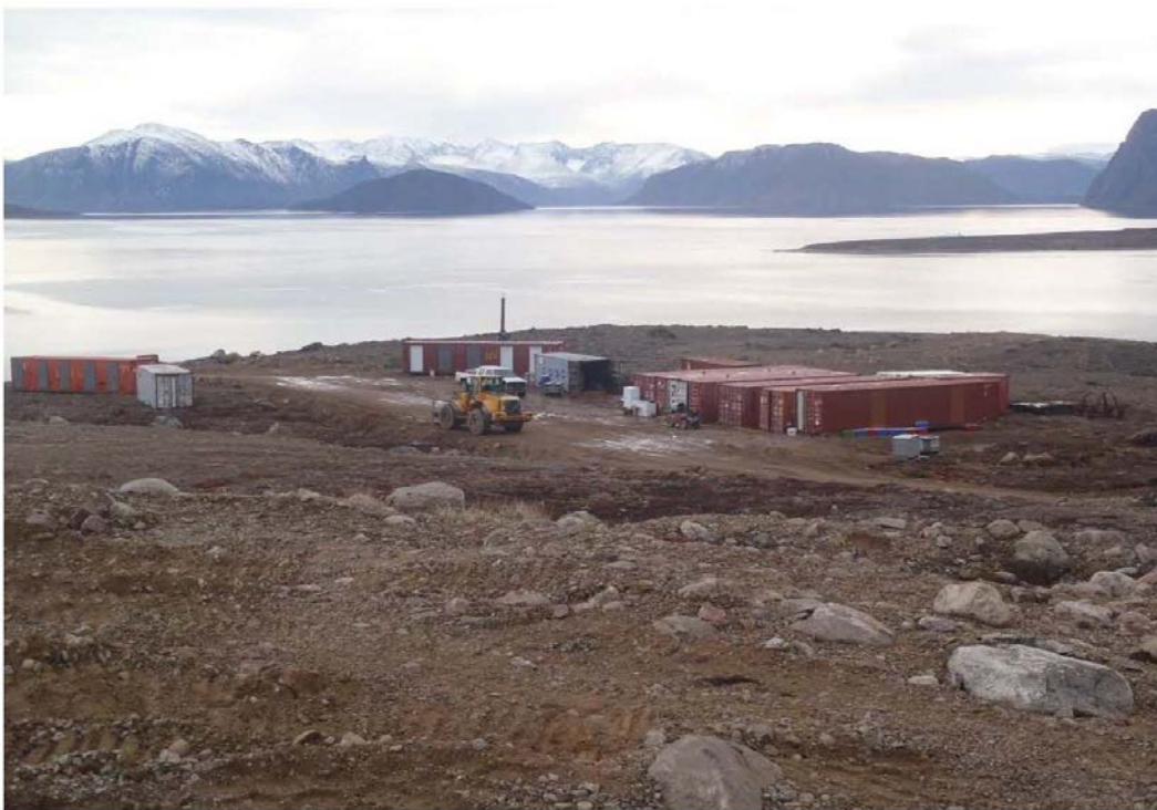
Figure 4. FOX-D Kivitoo view of camp