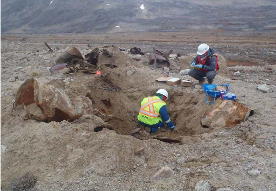
Figure 7. Collecting samples from testpit at Area of Potential Environmental Concern 11-B at FOX-D Kivitoo.