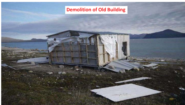
Demolition of Old Building