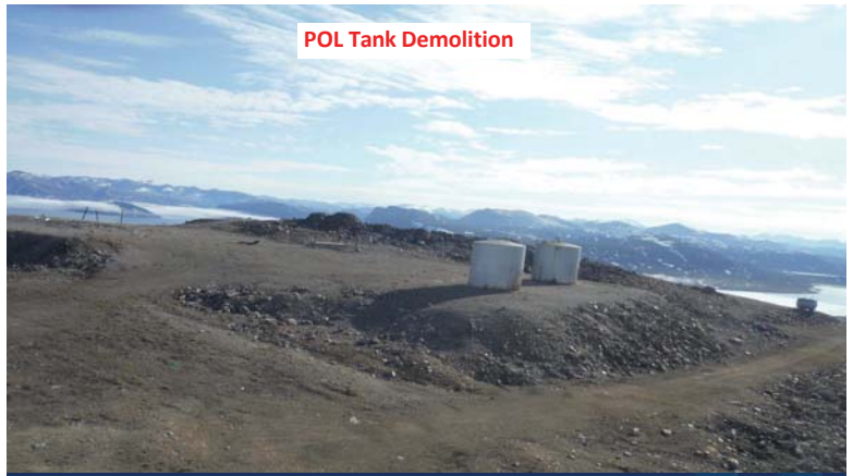
POL Tank Demolition