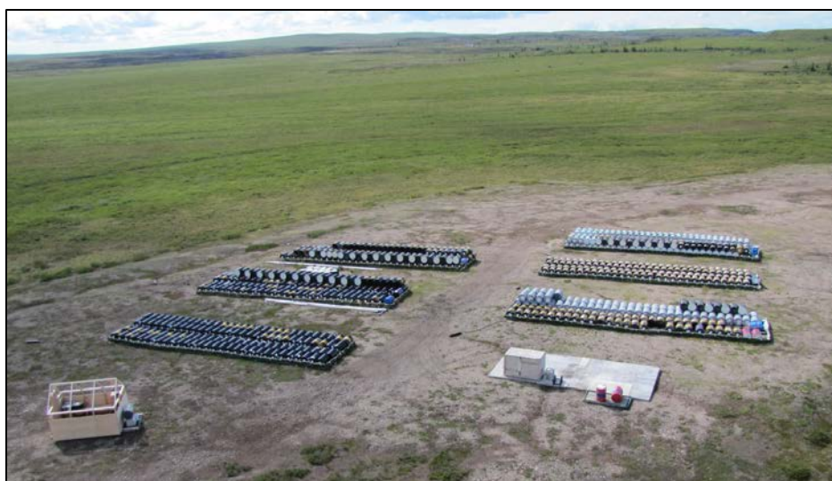
Nutaaq Camp Fuel Berms

At the end of the 2016 program the Nutaaq Camp fuel cache contained 235 drums of diesel, 190 drums of jet fuel, three drums of gasoline and 14 propane cylinders. Approximately 500 drums remain on site to be removed by Turbo Otter flights during future exploration programs. Very little fuel was used over the five day camp maintenance program and no fuel was brought in for the 2017 camp maintenance visit.