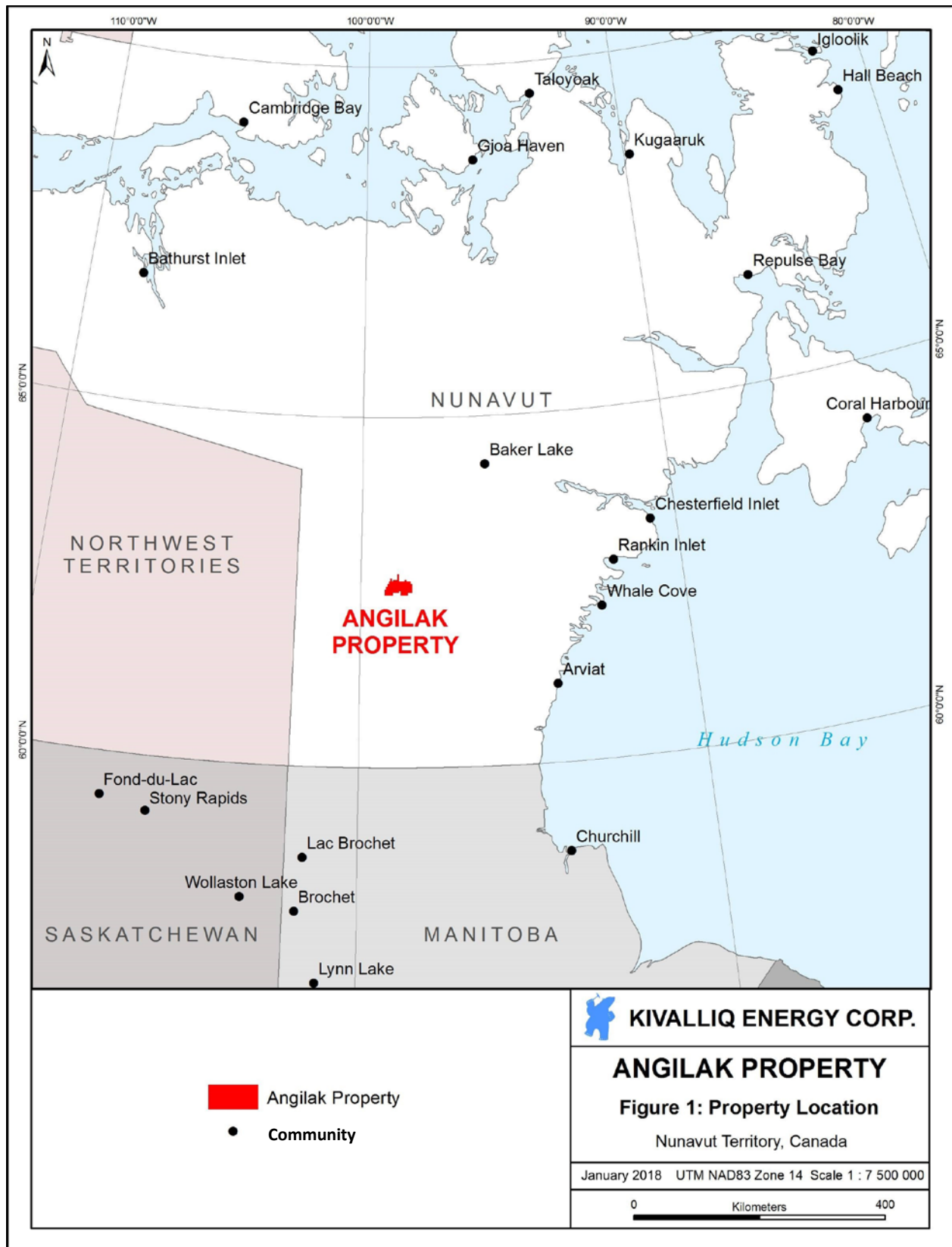
Figure 1: Angilak Property Location