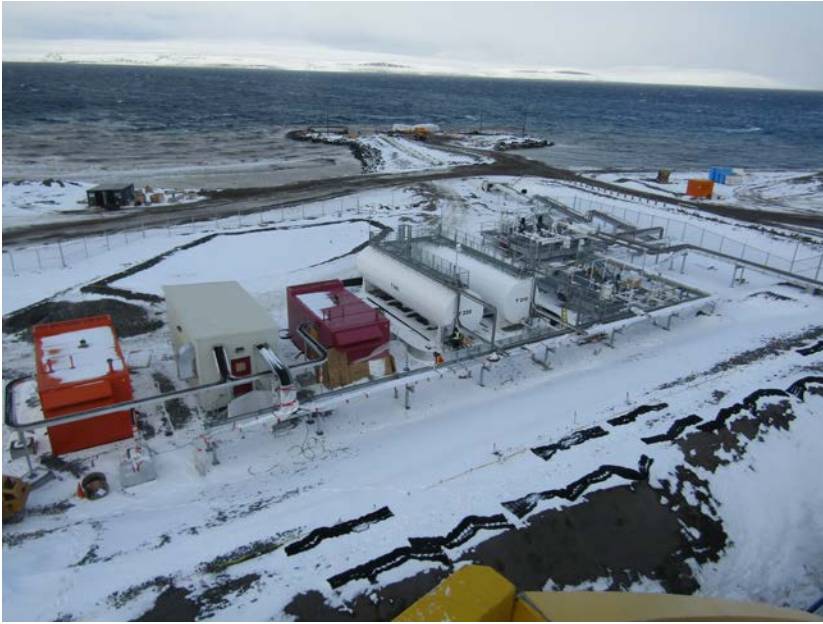
Figure 1. Operational Area