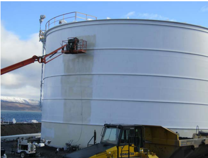
Figure 2. Painting - Naval Distillate Tank