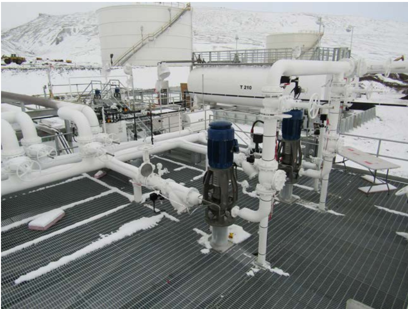
Figure 3. Pipe and Pump Infrastructure