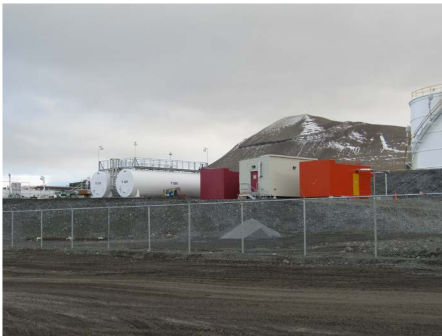
Figure 6. NNF Site September 2017