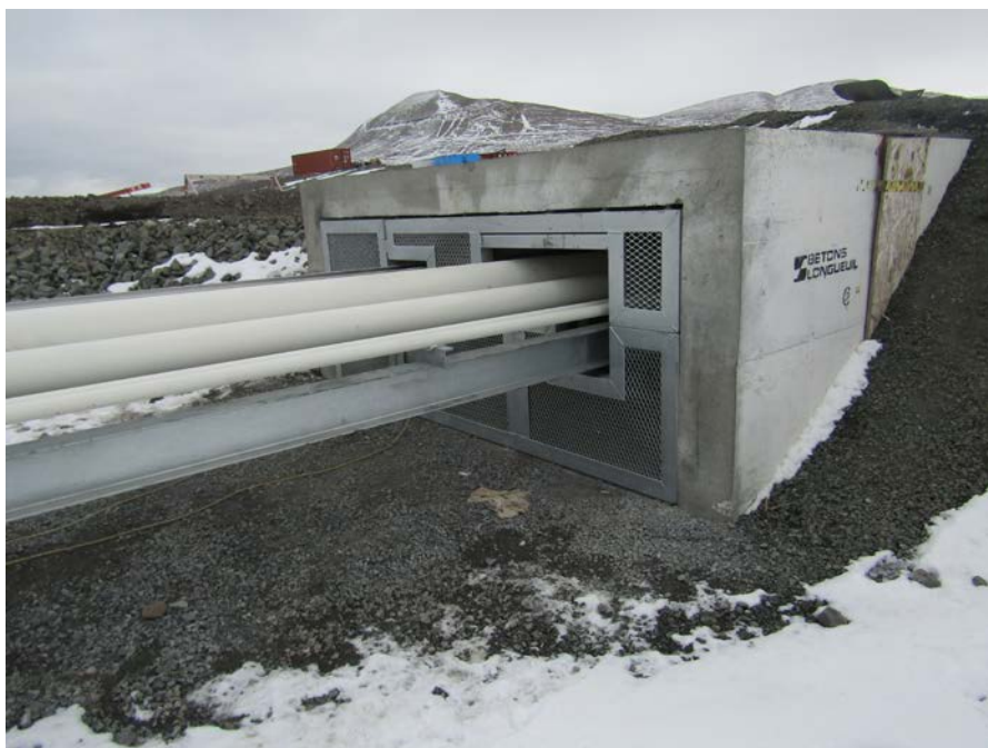
Figure 5. Pipe Rack Infrastructure