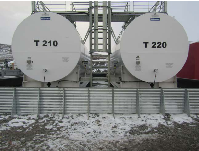
Figure 4. Diesel Tanks