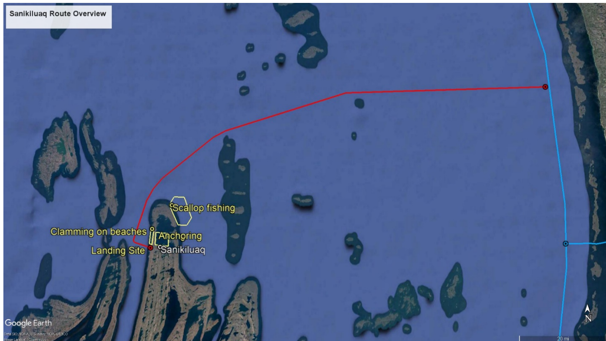
FIGURE 6 - CONNECTION BETWEEN SANIKILUAQ AND THE KRG CABLE

Sanikiluaq is an island, located in Hudson Bay, about 160km off the west coast of the Quebec peninsula. Refer to Figure 8 – Connection between Sanikiluaq and KRG cable