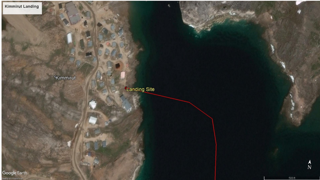
FIGURE 4 – KIMMIRUT APPROACH

The site visits were conducted on September 23, 2016.