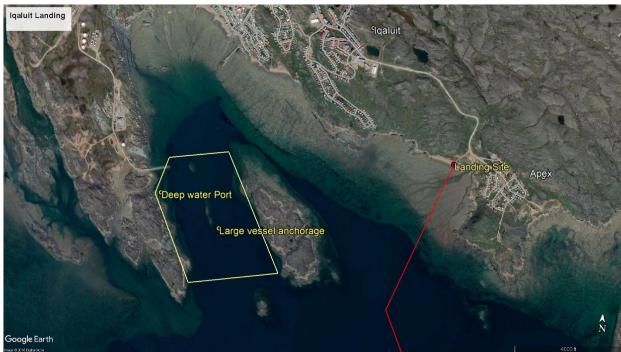
FIGURE 3 – IQALUIT LANDING

The Iqaluit site visit was conducted on September 23, 2016. Four landing site options were investigated and three were ultimately ruled out due to high level of anchor threats and sea lift vessels and barge activity and proximity to cemetery and high residential housing density. The location at Apex is the preferred site. The site is southeast of the main town, along reasonable gravel/old paved roads and avoid sealift and other vessel anchorages