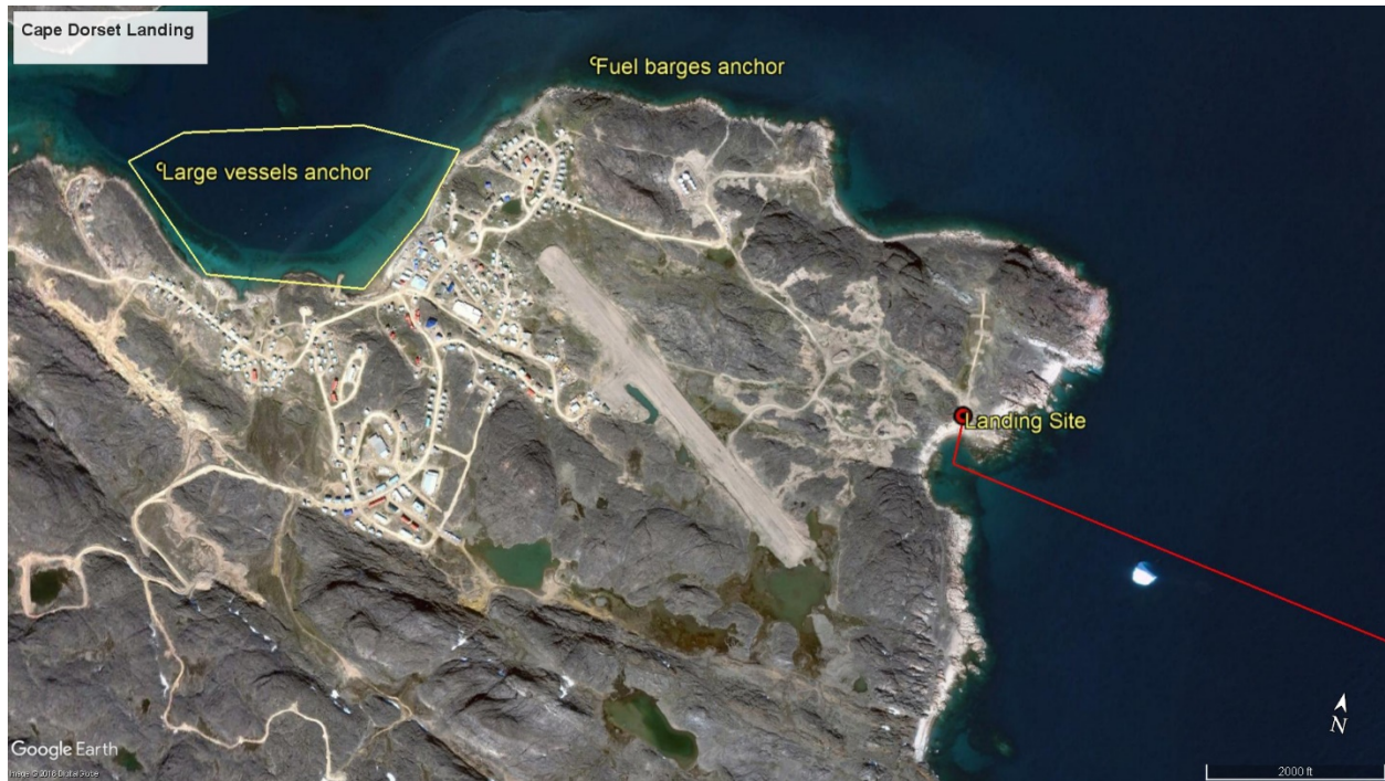
FIGURE 5 – CAPE DORSET LANDING SITE

Cape Dorset is located on the southwest side of Baffin Island. The site investigation was conducted on September 24, 2016 and three potential sites were reviewed. The preferred site is located east of the hamlet and was selected as it has the best potential for a conventional burial operation. Refer to Figure 8: Cape Dorset Landing Site.