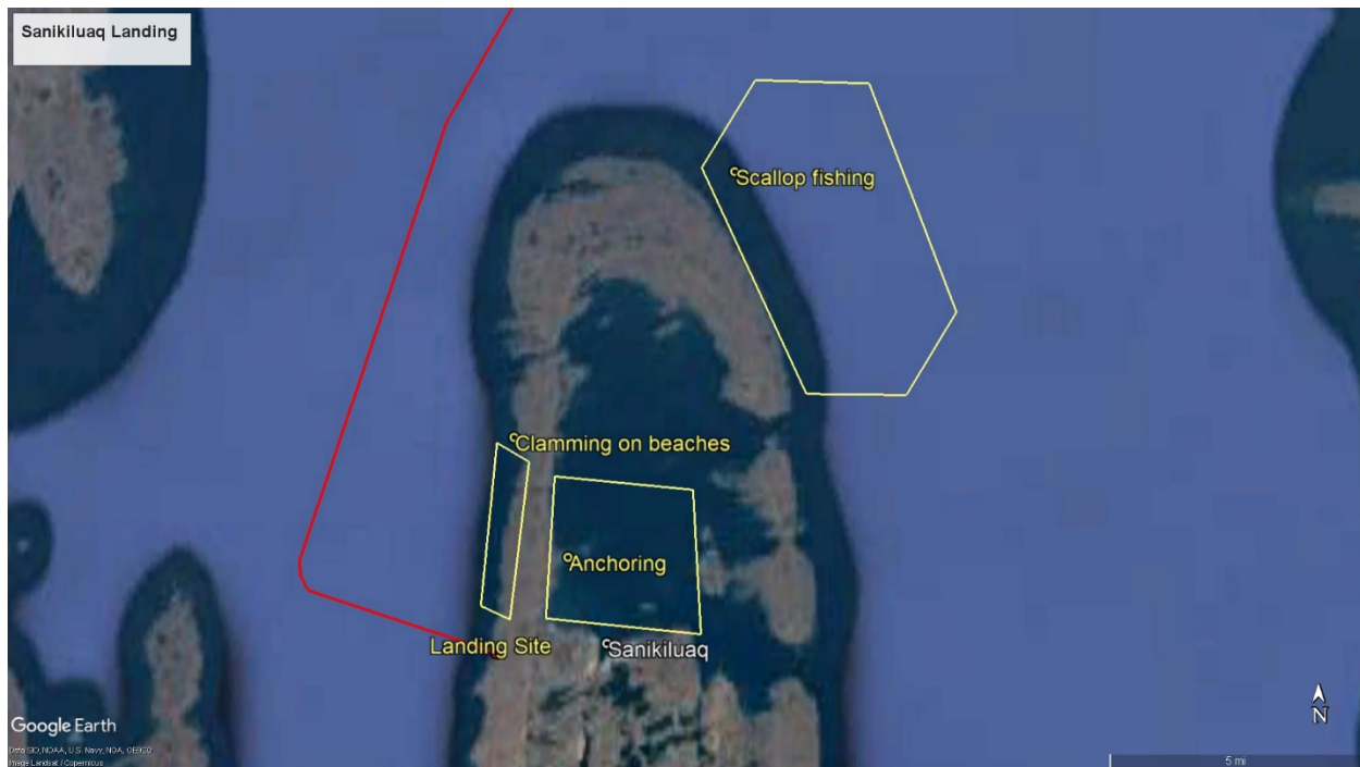
FIGURE 7 – SANIKILUAQ LANDING SITE