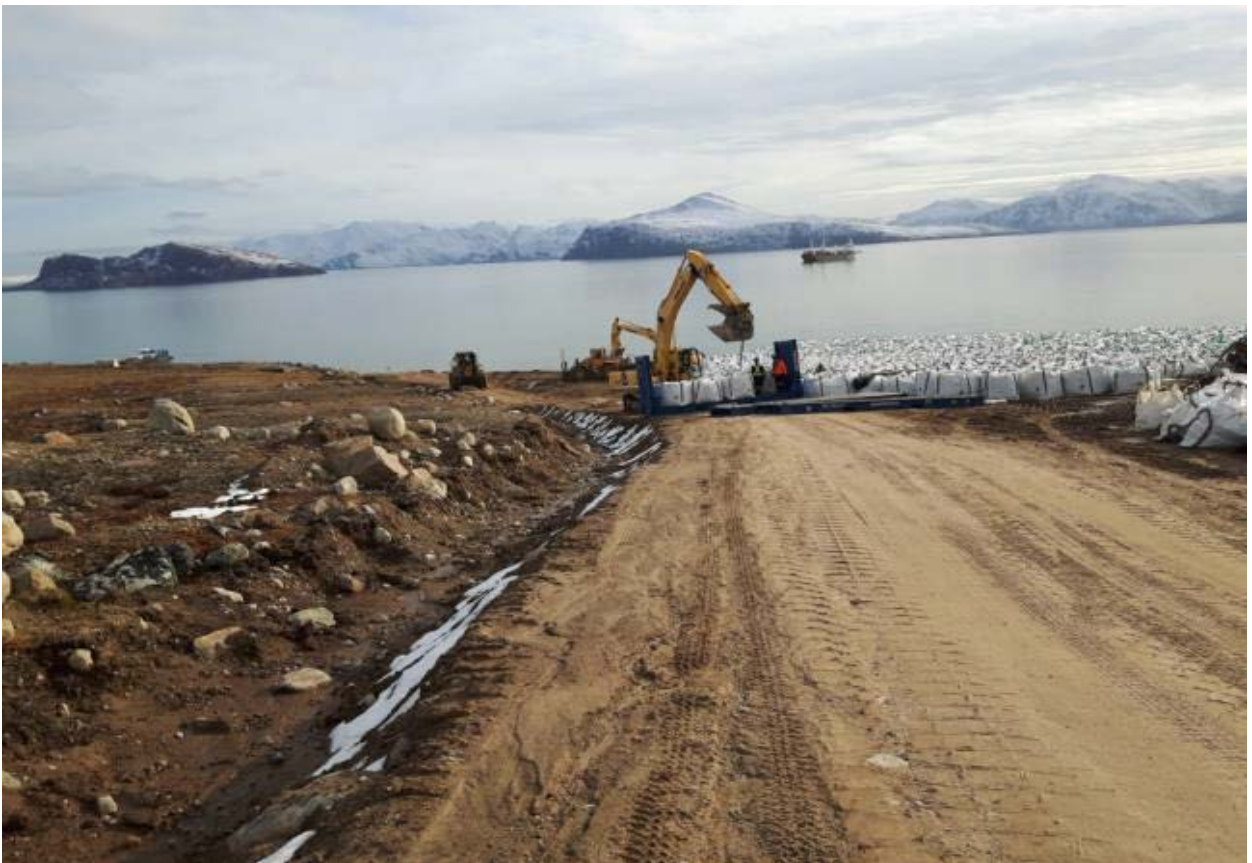
Figure 9. Soil bags to be transferred onto sealift for off-site disposal.