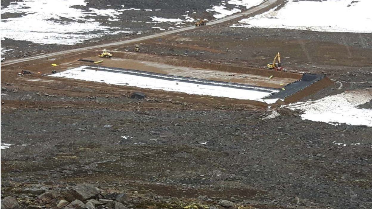
Figure 3. Construction of landfarm at FOX-D Kivitoo.