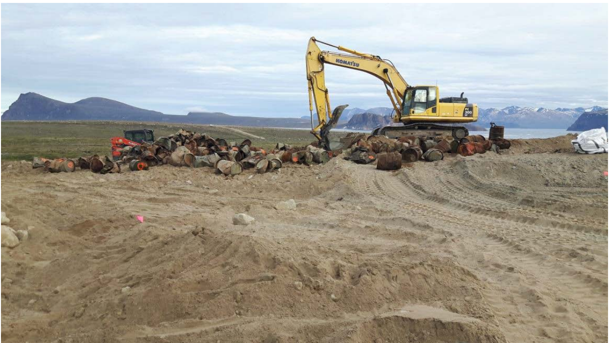
Figure 7. Excavating and sorting debris at APEC 11 Lobe A at FOX-D Kivitoo.