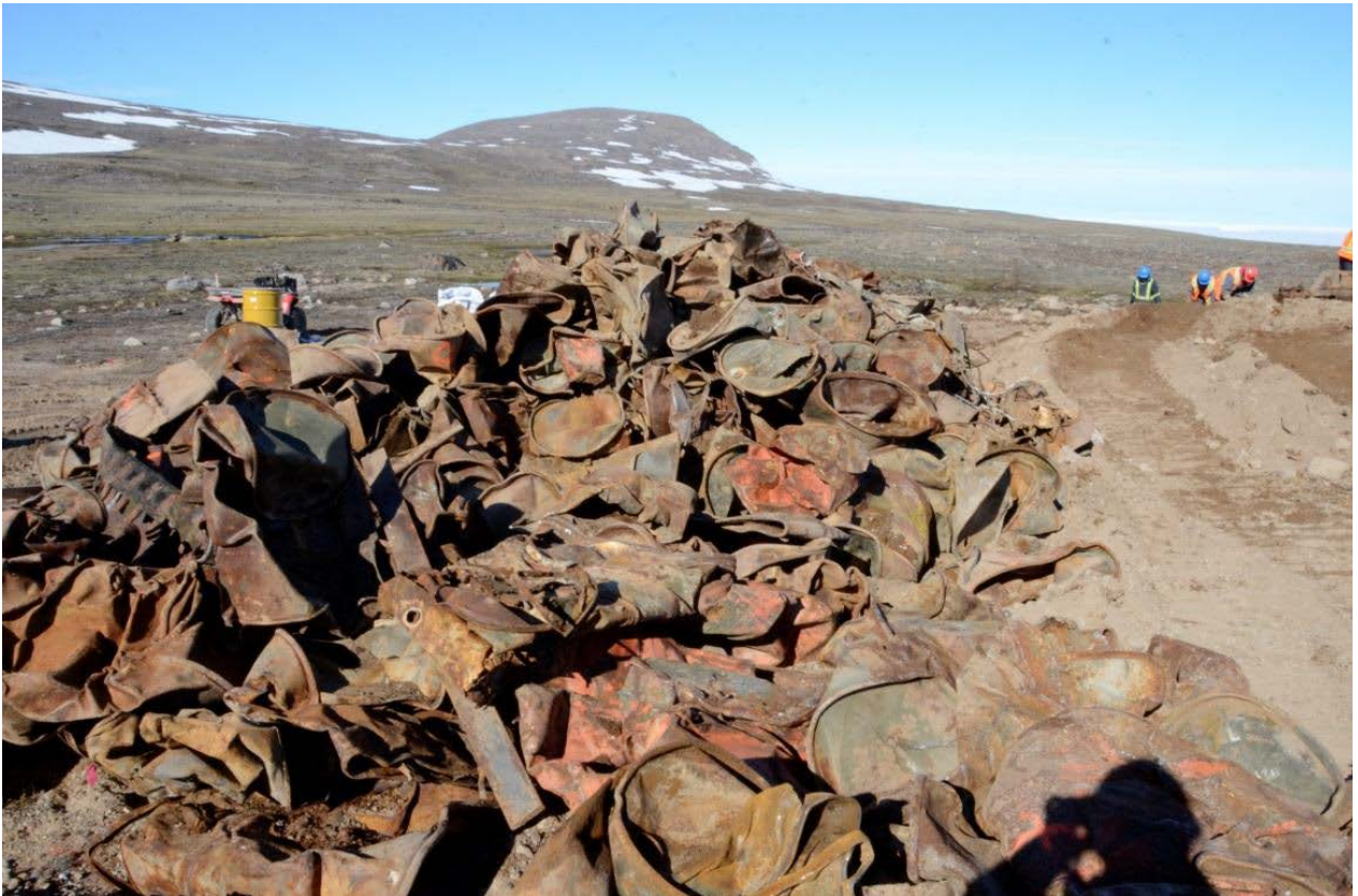
Figure 4. Crushed barrels excavated from APEC 11B – Lobe A at FOX-D Kivitoo.