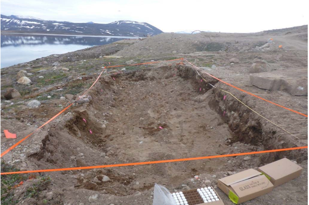
Figure 6. Confirmatory sampling for APEC 12 at FOX-D Kivitoo.