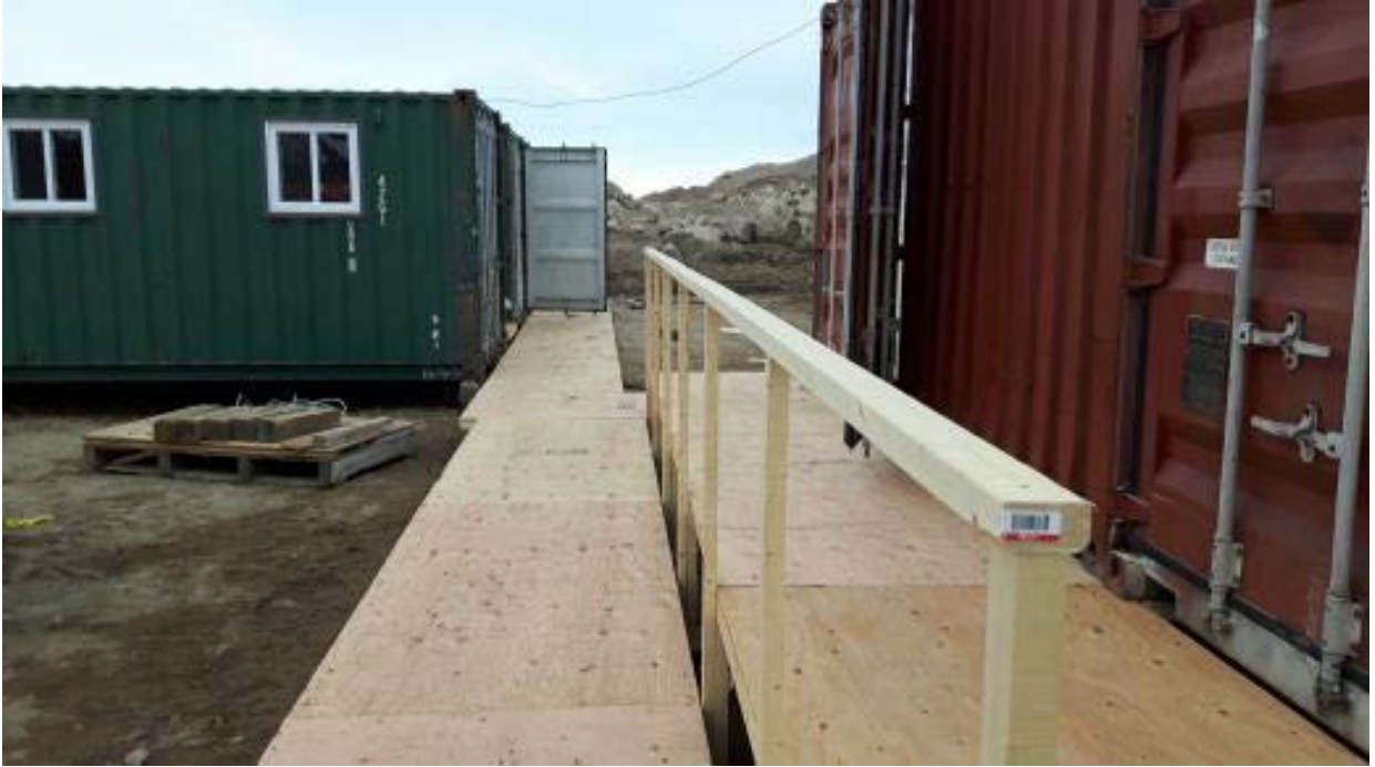
Figure 10. Camp facilities at FOX-D Kivitoo.