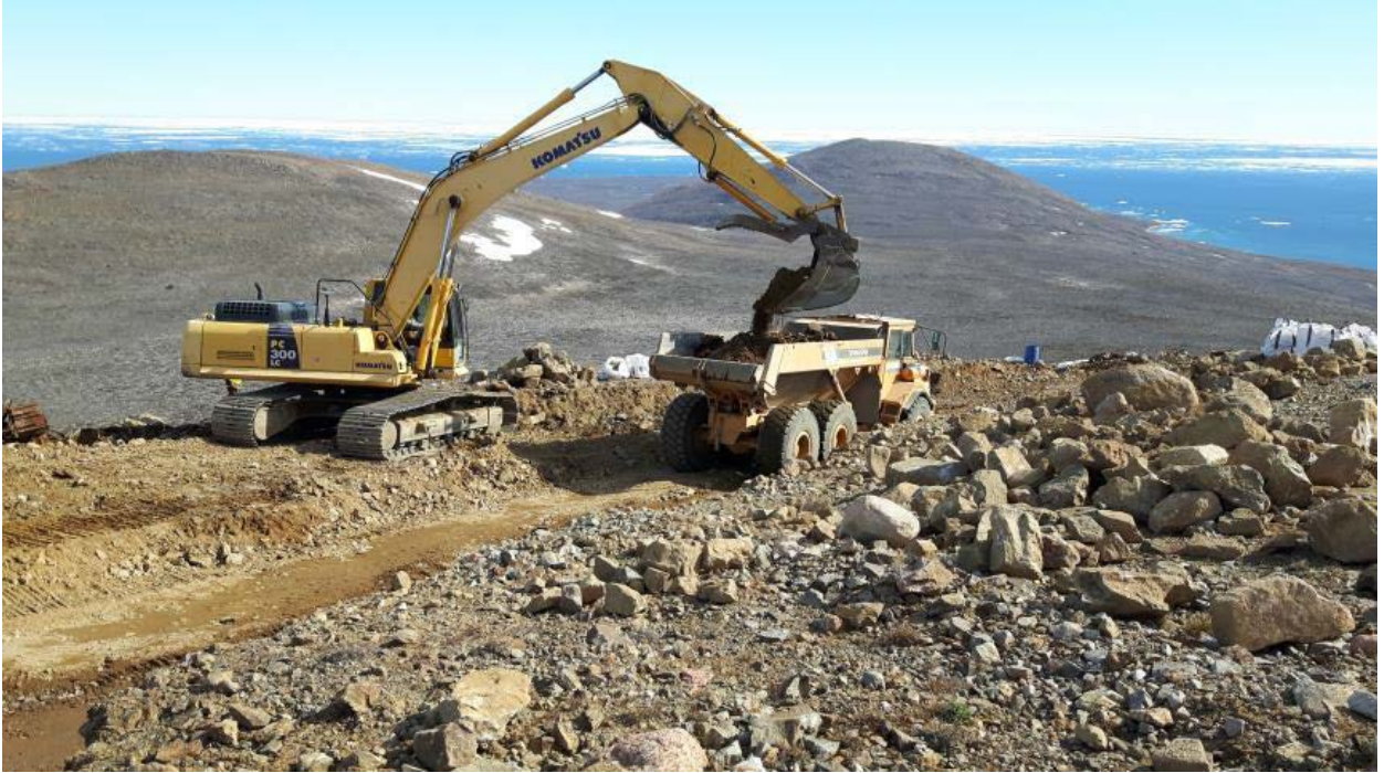
Figure 8. Landfill excavation of APEC 9-1 at FOX-D Kivitoo.