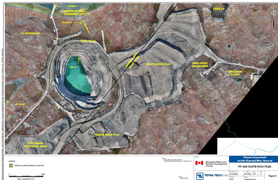
Figure 2: Water Diversion Channels and Pit 10

The Monitoring Officer also has concerns regarding future water quality in that the kimberlite in the PKCA upstream of Cell B/C. Kimberlite will break down over time, as has been observed in other mine sites in the Northwest Territories, and this may leach unknown contaminants into Cell B/C and eventually the receiving aquatic environment. Currently, the OMS Plan has no further designs to test the water quality in Cell B/C.