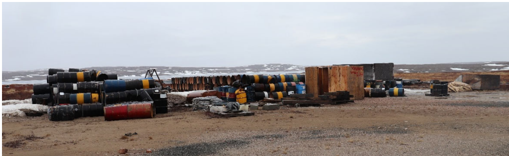
Piksa 10: Halummaqhimayuyut Uqhuryuaq Qattaryuit

Tamakpianginik aulangitpaktunik ukhuukluit nayuganik pihimayainik halumaktikhimayainik ikualaktauvaktunik atukhutik nayuganik ikualativikmik hakugiktumik ikualativik, kihimi aah ikitunik katakyunik tutkuktauhimayunik akhaalutikakvinik kakugu atuktakhainik talvungaumik CIRNAC puulaklugu. Tamaat qattaryuit imaiyaqtauvlutik, halummaqtauvlutik, unalu tutquqtauvlutik (Piksa 10).