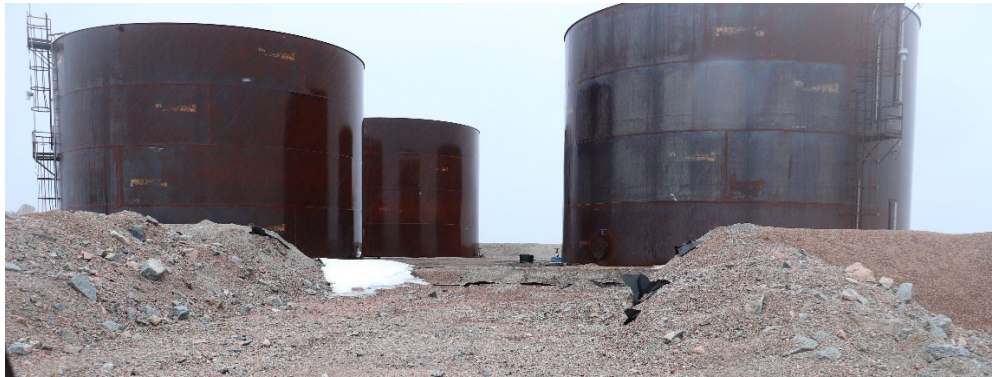
Piksa 9: Ilainnaa II uqhuryuaqarviit angmaumayulingnit iluani maniraa

Talvani ammigaitunik havakhikpakhimayunik huppmutakhanik pihimayunik havakhimayunik kugluaktitauhimayunik pidjutinaitumik hila mahalikgangut imakyuaknaitumiklu (Piksa 9).