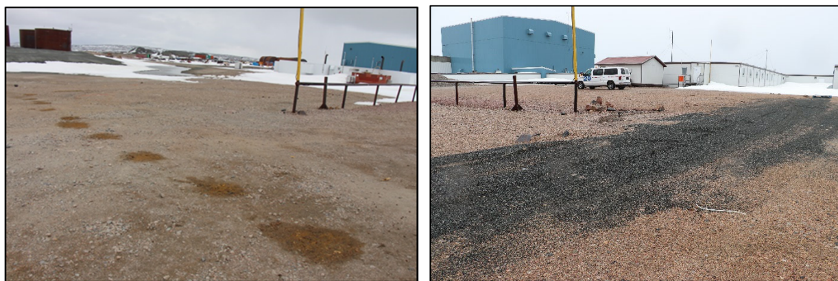
Piksa 19: hivuagut (2018) talvanilu ahiagut (2019) halumaktitauvaktunik hiamihimayunik

Uvani 2018 tamna havaktitauvaktunik havakhautikhanik havakgufuuktunik nayugainik, tamna Munahiyat Havaktitauyuk ilitugihimayuk aah atadjutigigitunik pikatakhimayunik 11 nik hiamiyauhimagayunik ilihimanaitumik taimani, alguyanik hiamihimayunik, hungnavulungnik atugakhanik kimaktauhimayunik. Talvunalu auyami 2018 hiamiyauhimagayunik halumaktitauvaktunik (Piksa 19) pihimayunik avaaliktauhimayunik atukhimayunik halumakhiktauvaktunik tahapkuat takuhimayait halumaktikhikhimayunik tahapkunanga puulakpaktunik Nunavut Aviktulikiyit Katimayit (NIRB) havakatigikpaktunik uvani 2019.