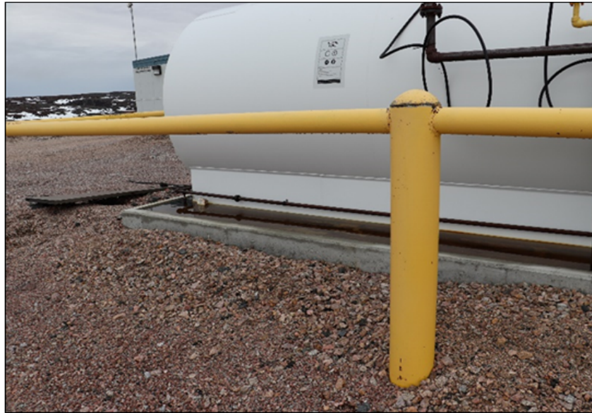
Piksa 5: Ukhukakvik talvani Uyagukhiuvinik Havakvit Kikhuktuivik Uyagunik

Nunattaknikmun Aviktuinikmun Angiutauvaktunik nunagiyanik, tamnalu nayuganik takungnaituk pikangituk atugakhanik kaaguktautunik.