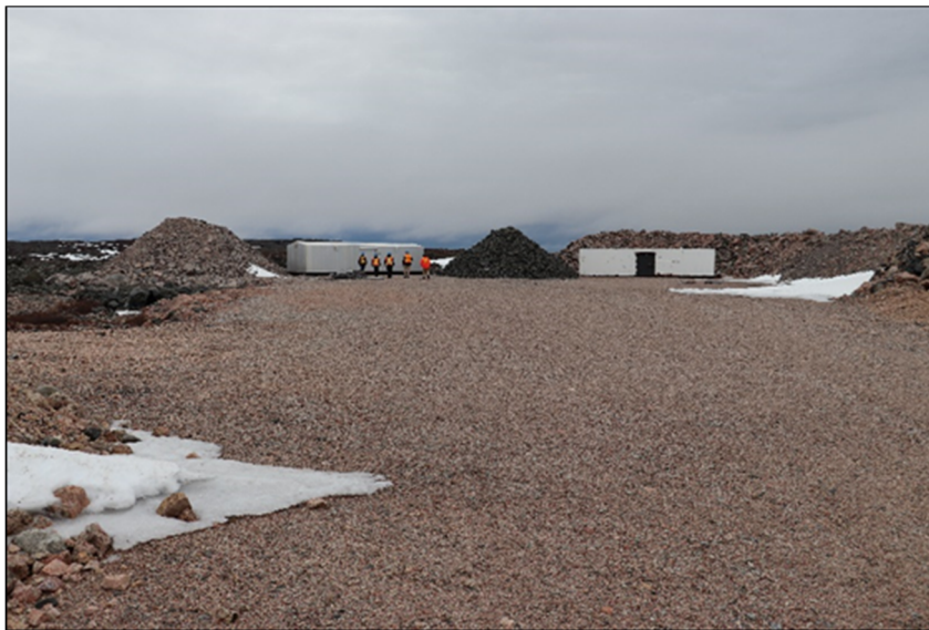
Piksa 6: Alguyat havaktut atukpagainik Tutkumavik