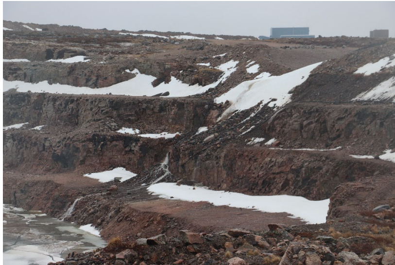
Piksa 12: C1 Avangmulikhimayunik uvunalu kugluakvit kungangukpaktunik ivukhunilu iluungmut nunami

Una angmarvikhaq hanayauhimayuq tununnganit haniraanit una ilitquhinga qurluaffaariangat imarmik iluani Carat Tahi q hamna hauvik tikinnahuariangani kinguani puqtuhini ( Piksa 13 ).