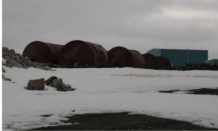
Piksa 8: Ilidjuhikgiliktainik I Halumakhiktauvaktunik Ukhuukakvinik

Talvani ammigaitunik havakhikpakhimayunik huppmutakhanik pihimayunik havakhimayunik kugluaktitauhimayunik pidjutinaitumik hila mahalikgangut imakyuaknaitumiklu (Piksa 9).