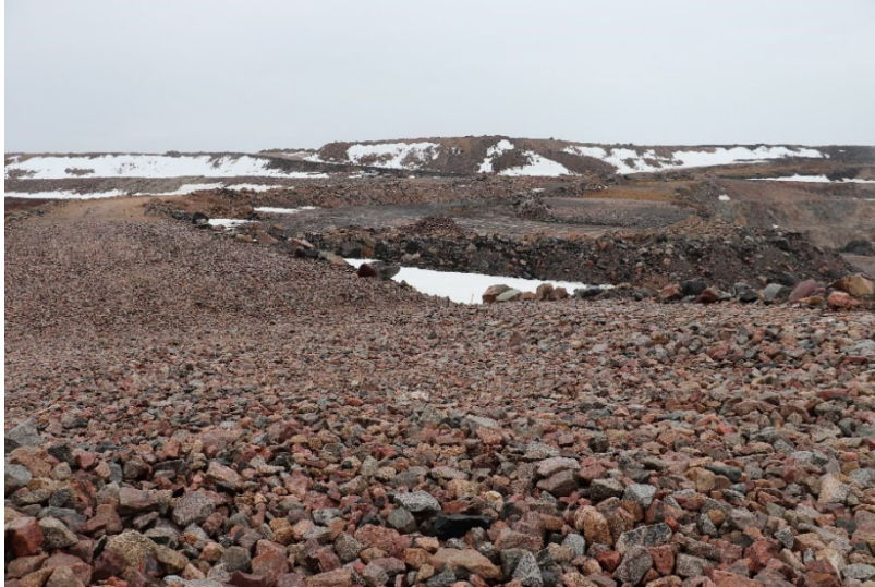
Piksa 13: Kugluakvit kugangukpaktunik mikharut Carat Tahik