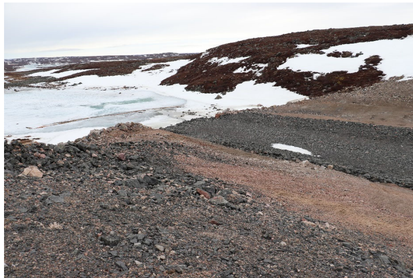
Piksa 15: Wuatani huppimutauyumik kugluakvit kangani nunap

Hamna ilagiyangit haffumani ihuaqhainikhainnut hulidjuhiit angiqtauhimayuq malikhugu NIRB Titigaquta Nappaa 16UN058, una C1 qurluangit aallannguqtiqhimayuq himikhimayauyuq unguvaqtauhimavlunilu unalu ikaarut ihuaqhaqtauffaarmiyuq taimaa ilitquhiriyangit imaq qurluaffaarmiyuq uvunga hauvik maniraani (Piksa 4 tamnalu Piksa 12 ). Una kuugaq iqaluqanngittuuvluni qurluangit.