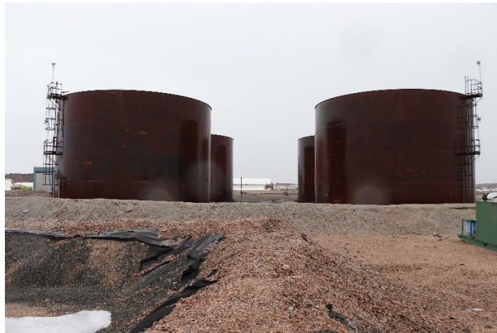
Piksa 7: Ildjuhikgiliktainik II Halumakhiktauvaktunik Ukhuukakvinik talvani Ilukhuliukhimayumik

Ilagiyauyurlu haffumani ihuaqhaqtauhimayuq huliyaqhangit munariyaavluni ukunannat CIRNAC maliktangit NIRB Titigaquta Nappaa 16UN058, havaktut havagvianmi havaktangit hivituyumik havaat ilagiyaavlunilu uqhuryuangit tutquumavingit iningat. Ukhuukakvinik talvanitunik Ildjuhikgiliktainik I tamnalu Ildjuhikgiliktainik II ukhuukakvinik tutkumaviniq pihimayunik havakhiktauhimayunik, halumakhiktauvaktunik, nuttiktauvaktunik, uvunalu havagiplugit tutkuktauvaktunik nayugainik talvani (Piksa 7 unalu Piksa 8).