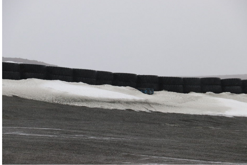
Piksa 1: Adjiliugut-1 Kuniakgukhak tapfuminga Ahaalutit Akhaluanginit Hungnayauhimayunik Huppimutak talvani PKCA

Tamna Munakhivaktuk Havaktiat nutkautigiuyitainik ihumalutigivakgainik kanukgiktukhanik kakugu halumailgunik katakgalakpaktunik “ Pivalialutik uyagukhiukvinit kuvikgakinik halumailgunik imaluknik kanukgilidjutivakput kilaup aniknianungakpakput pingmilutik hiugaliangukhutik kakungukpaliagangut. Uvunalu ilidjuhikgingukfaaktukhanik pidjutyukhanik naufaaktukhanik nuna – hivuagut pihimayunik kingnipakyuakgunagnaiktuk uyagukhiukvinit kuvikgakinik halumailgunik imaluknik halumakpaliayunik, uvunalu aipagiyanik nauvalangituk pilakivaktunit hilakluknikmun ivuukpaliayuniklu. Kuvikgakinik halumailgunik imaluknik ilitukgiyauhainakpaktunik ivuuknit imakakniinit, talvanilu imakaknit talvanga hungnirganit kugluakpaktunik kugullialukipluni kanganit ivuukpalikhunilu “kayumiktumik imalu ingilgahimaktuklu imakaknit”. 3 Hivuani tautukhimayangit kiugiaqaqhuni pidjarikhinahuarlugit naittumik unaluuniit hivitunianit atuqtauhimayuq nakuuyumik haffuminngat qiplariktuq uyarait qulaaniittut (Piksa 2).