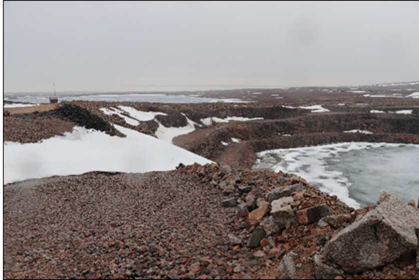
Piksa 4: Havakhikhimayunik Huppimutaayunik avaatainik Hugyailgumi Uyaguktakvinik

Hivitunia Qanurilinganingillu 14 haffumani Jericho Havakhautikhanik Ilitaridjutingit kiuhimayangit: