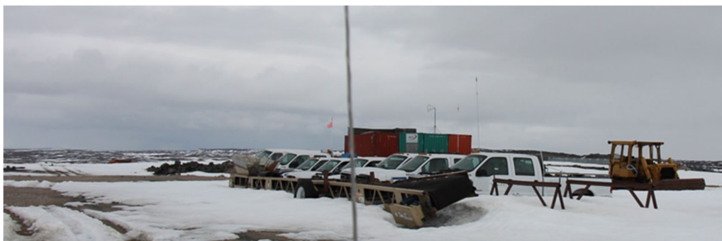
Piksa 3: Ikhinnaqhimayayut akhuurnaittumik akhaluutit (2018)

Hamna havagviat havaktaunngittuni, tautukhimaittut kuinginnarniq amiqhainikhainnut ingattaqhittailinikhainnigluuniit ilagiyauyunit uyagakhiurviitigut huliyaikhainit. Una ihumagiyauvluni ihuiluatauhimayut hamannat kuinginnarningit uvani havagvianit naittuuvluni unalu hivunngani tingmiakkut aullaqpangniaqtut havagviannit munaqhinahuaangat. Amihuuyut ingniqutiryuat ahivaqtauhimavlutik havagviannit ikittuuvlutik ingilralaaqtut akhaluutit aulayuttut (Piksa 3).