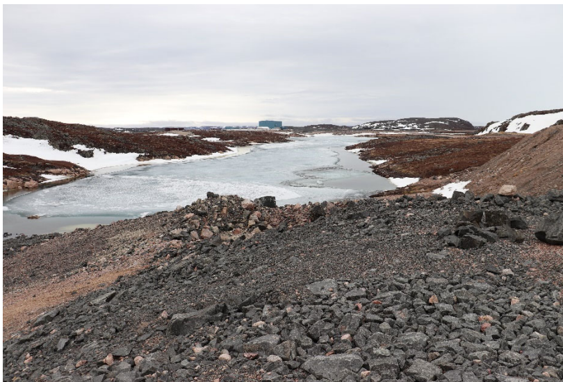
Piksa 18: Wuatani Huppmutak Huppmutalingnik Kugluakvinik B/C miharut hungmiyumik nirgikmut havavik uyaganik kikhuktuivik

Taimanivyak talvuna nayugainik puulaktauvaktunik havagiyaavaktunik, tahapkuat puulakpaktunik talvunga puulakpaktunik Nunavut Aviktulikyit Katimayit (NIRB) havakatigikpaktunik kuniakhimavaktunik pikangitunik katakgalakpaktunik munakgiyauyukhanik havakviuyukhanik Tahamngna takungnakpiaktuk hugyaitunik halumailgunik aputmiuyunik hiugalianuat talvunga PKCA nutkangayuitunik talvunga huppmutaliukhimayumit havakvinik (Piksa 1). Taimaitumik kaliktakhak atuktauvaktunik ilikgiyauhimayunik kanganut kikhukhikhimayunik uyaguktakvinit pikakhutik puyukpaktunik hiugulianuanik puyungukpaktunik kilangmut, tamanulu tutkumavit tamayakakvit hungnauyauhimayunik (una., ahaalutit akhaluanginit hungnauyauhimayunik huppmutak) pilgumikhimayunik hungnauyauhimayunik tungavikhainik adiliukvit adjiliuktukhanik puyungukpaktuinik kilangmut.