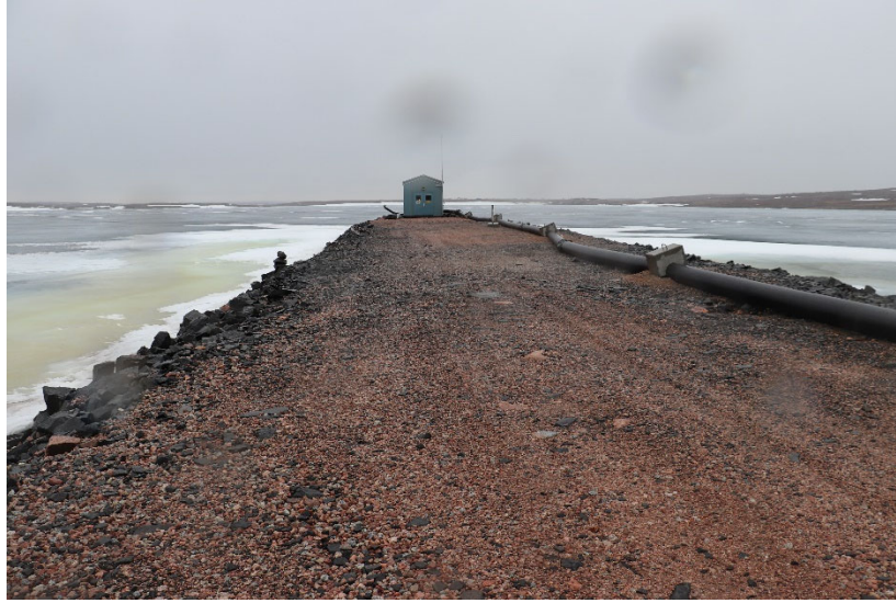
Piksa 16: Hupimmutak imiktakvit imaktakvianik talvani Carat Tahik