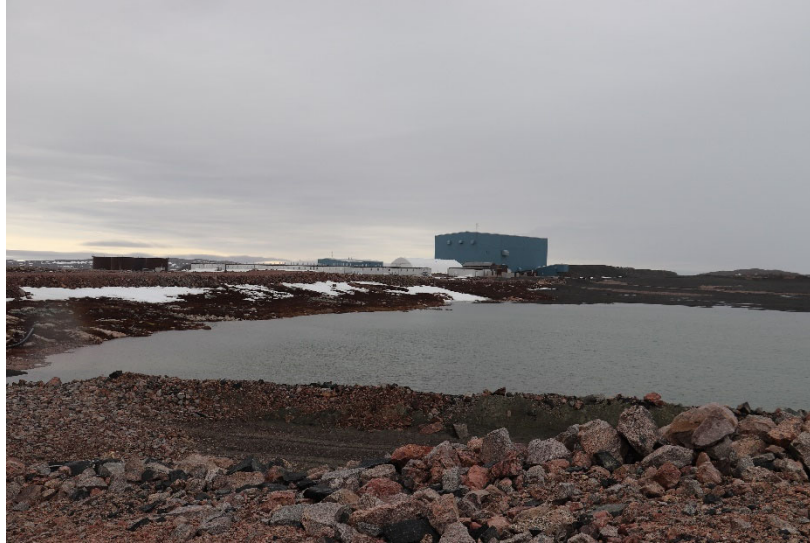
Piksa 17: Huppmutalingnik Kugluakvinik A ingilgavaktunik mikharut kugluakvinik A