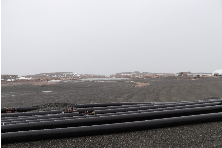
Piksa 2: Uyaguktakvinik kikhukhikhimayunik pilukgingukhimayunik kaliktakhainik talvani PKCA