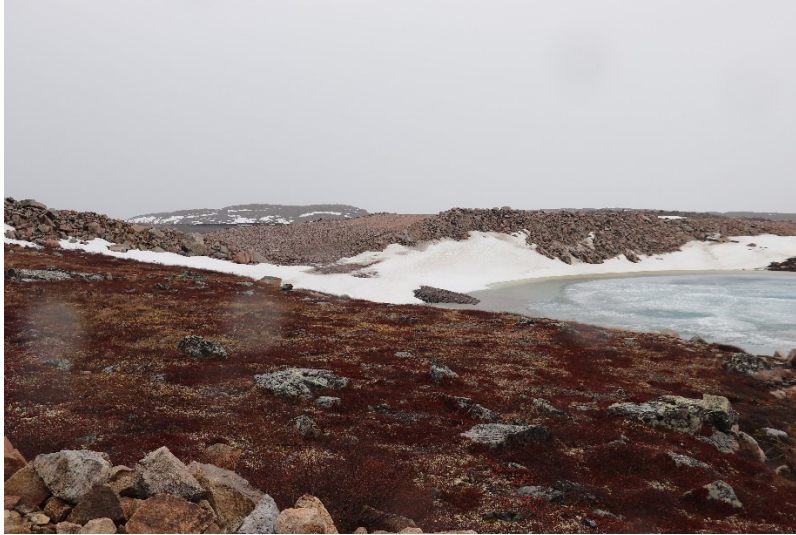
Piksa 14: Angmaumayuq iluani Avvautinga Kinilairvikhaq A mi