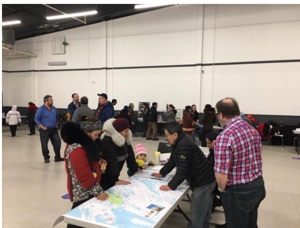
Open House – March 11, 2020