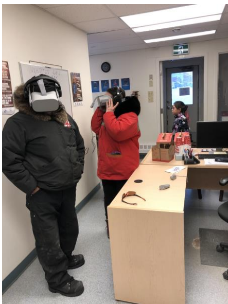
Coffee & Chat – March 4, 2020