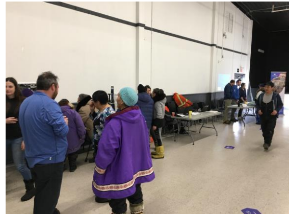
Open House – March 11, 2020