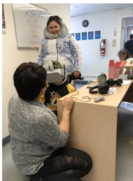
Coffee & Chat – March 4, 2020