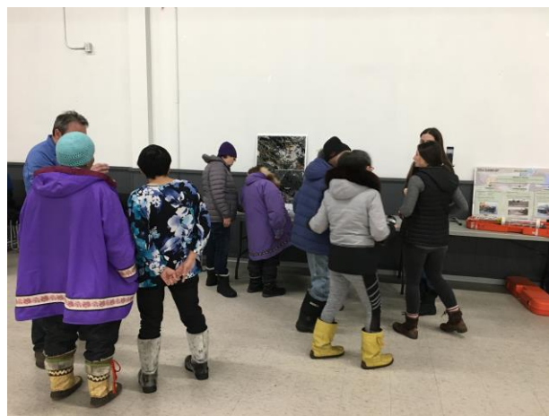
Open House – March 11, 2020