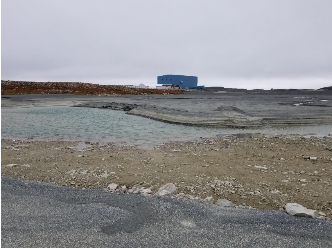
Piksaut 1: PKCA Tahirannguqtut Qurluraqtuqlu