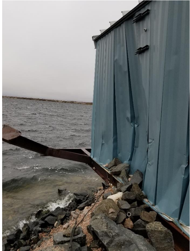
Piksaut 7: Ahiruqhimayut Pakpautiqarvingnit

Naunaqtuq qanga ahiruqhimayaami, ihumagiyauyuq kihimi taimaa hikumit ahiruqtaunahugiyayuq.