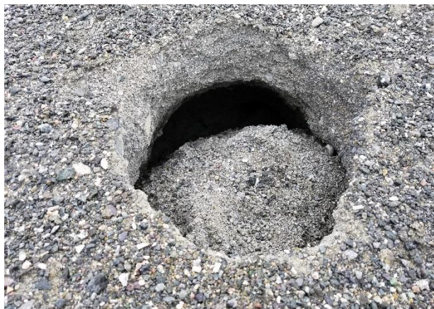
Piksaut 2: PKCA Kivitaqvik