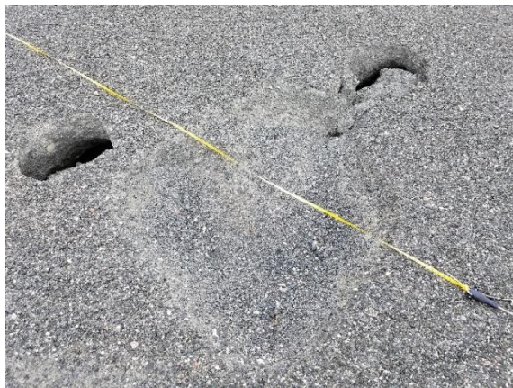
Piksaut 4: PKCA Kivitaqviit/Putuit