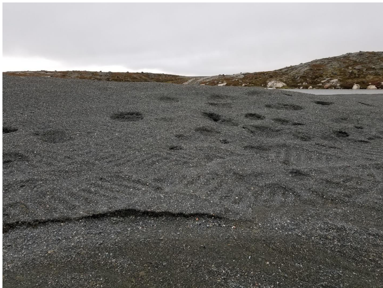
Piksaut 3: PKCA Nunguvalliayuq/Qurluraqtuq