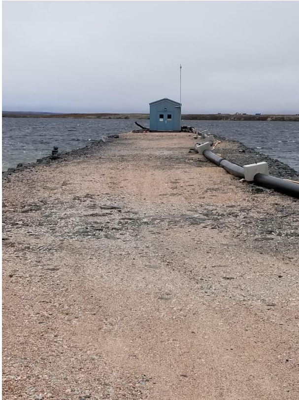
Piksaut 8: Carat Tahiani Tullakviat

Piksaliuqhimayait CIRNAC-kut ilittuqhitiyut ahiruqhimayut pakpautiqarvingmi talvani Carat Tahiani Imiqtarvianit uyarangniklu iliuraqvianik nungutpalliaqtailiplugu tullakviat. (Piksaut 7, Piksaut 8).