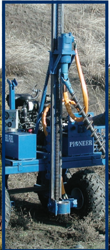
Specialty & Multi-Purpose