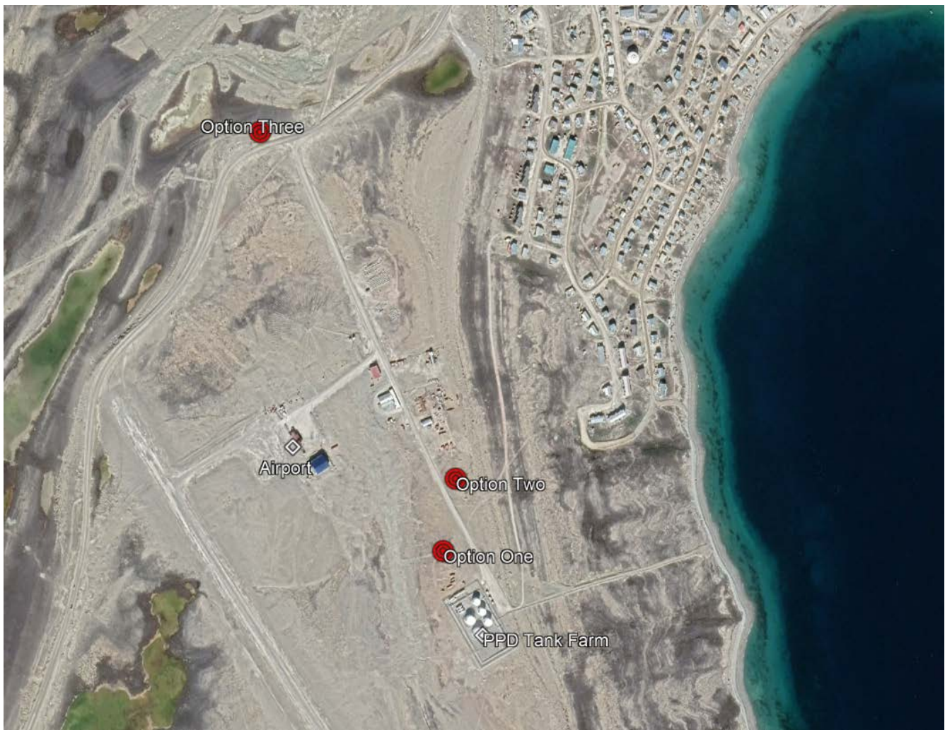
Figure 1: Alternative Location Options Considered for the Igloolik Power Plant Project