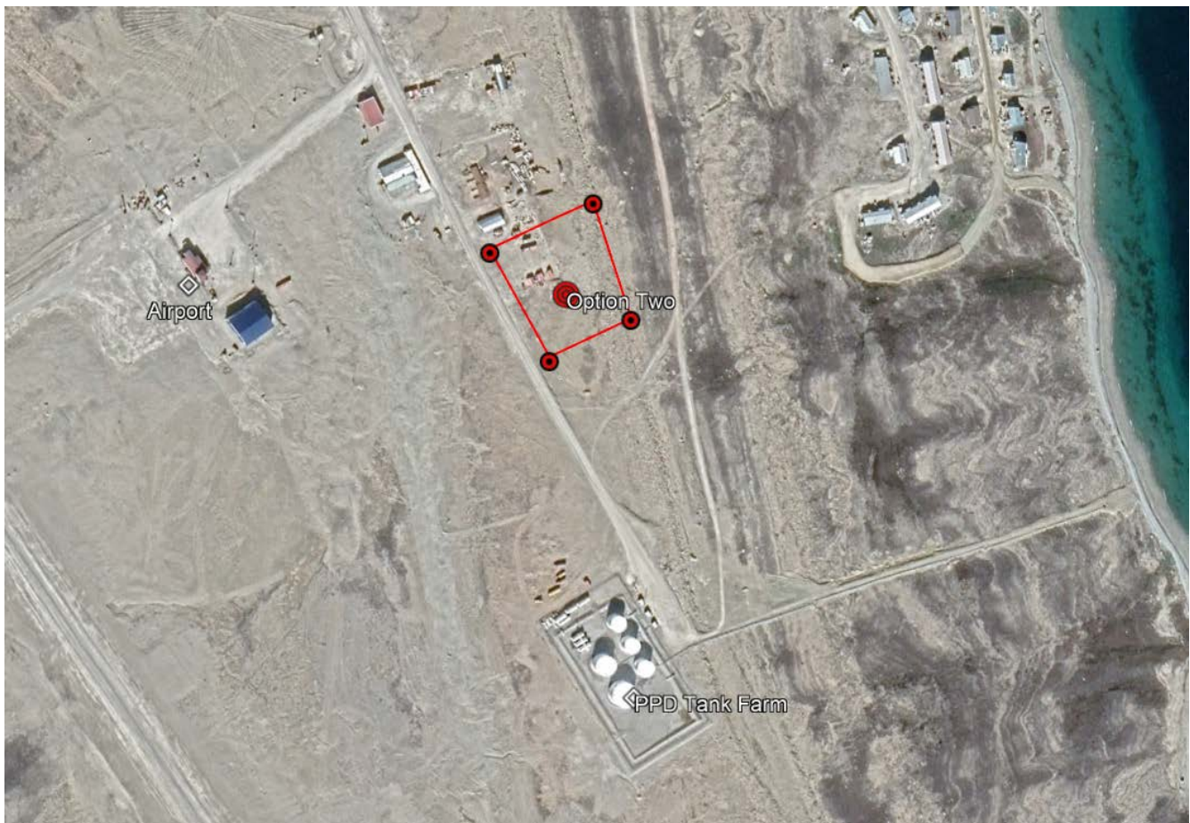
Figure 2: Location Selected for the Igloolik Power Plant Project

The proposed lot is approximately 8,516 square metres located on unsurveyed, untitled Commissioner's land, east of Lot 1000 Plan 1567 (airport property), and approximately 225 metres north of the PPD bulk fuel facility. The proposed lot is identified as 'Lot A' with sketch number 609-SK-103. QECs land application was presented to and approved by the Hamlet of Igloolik on June 17, 2021 (Motion Number 77; Attachment B).