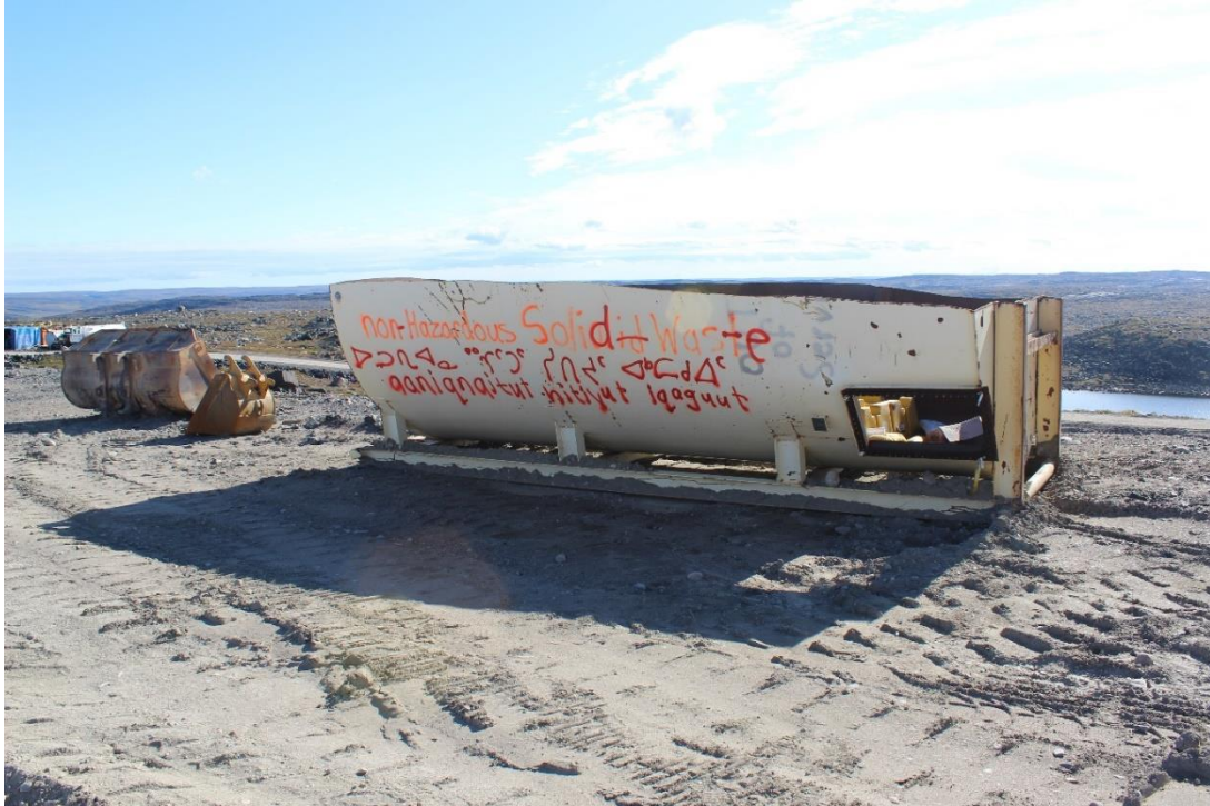
Photo 5. Waste staging