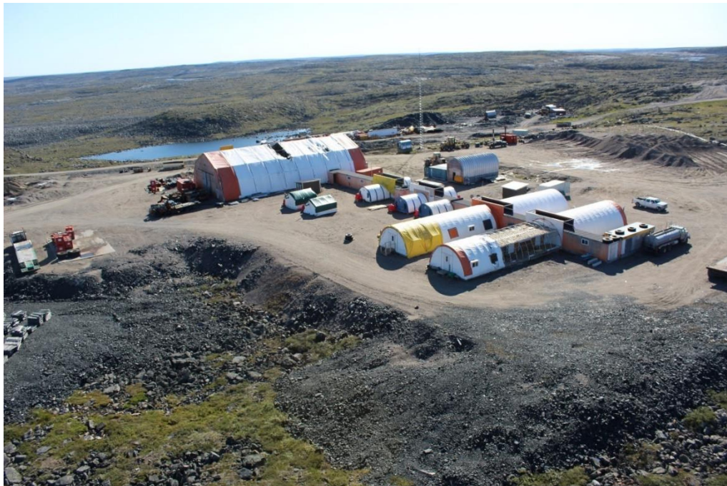
Photo 2. Ulu camp, with new sleepers, isolation tents, repaired mess tent and partially demolished sleeper wing.