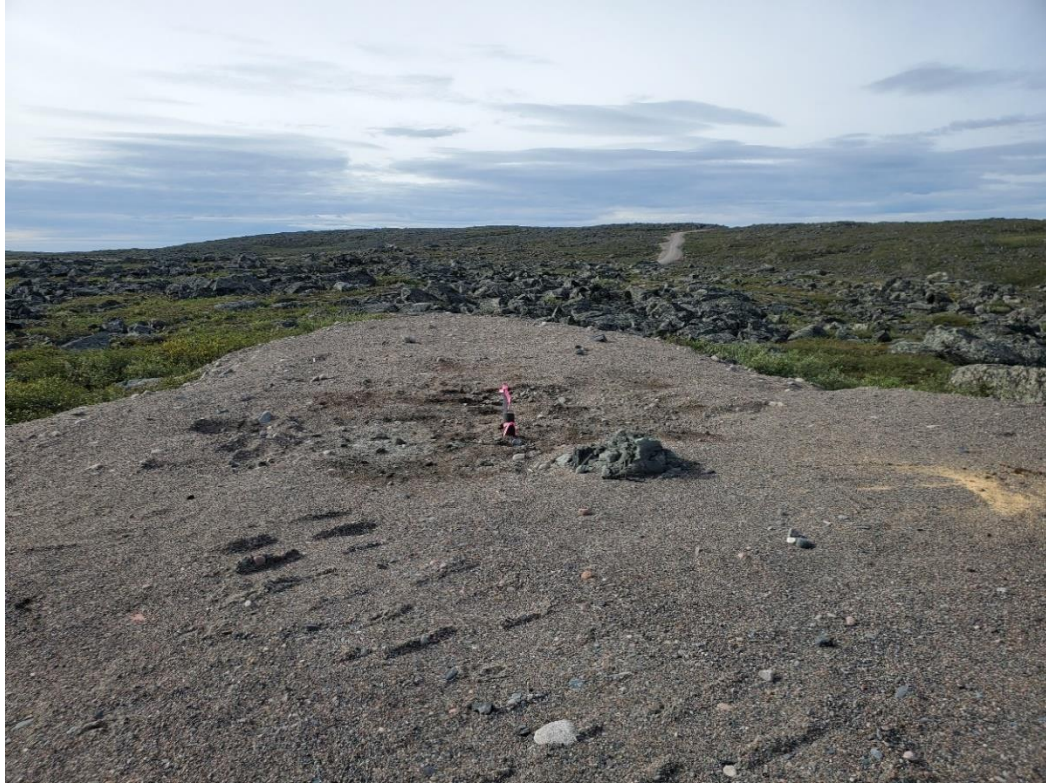
Photo 9. Reclaimed drill site