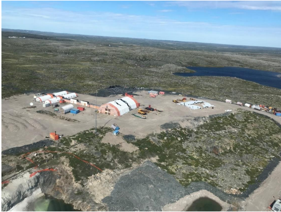
Photo 1. Ulu camp, July 2020