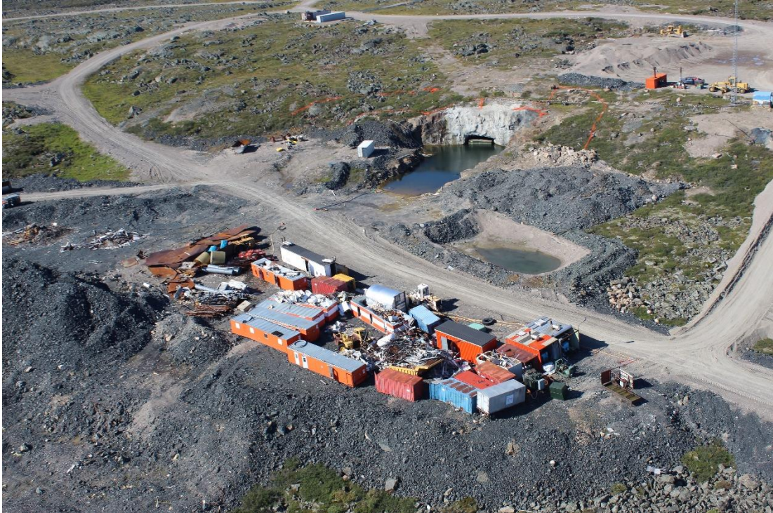
Photo 3. Ulu waste staging area, portal and mine sump