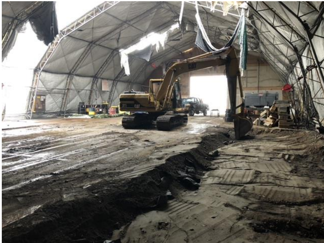
Photo 6. Excavating contaminated soil from the unlined portion of Ulu shop floor