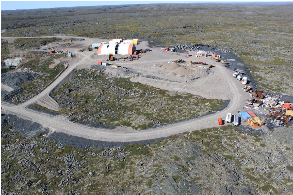
Photo 4. Ulu landfill area, access routes established