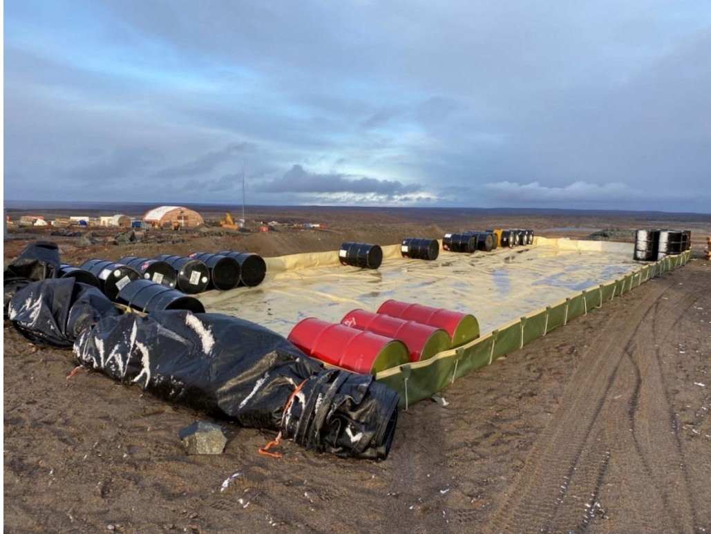
Photo 7. New Ulu camp fuel cache