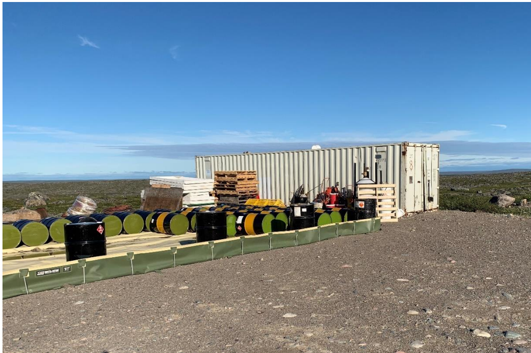
Photo 8. Ulu airstrip fuel cache and laydown area