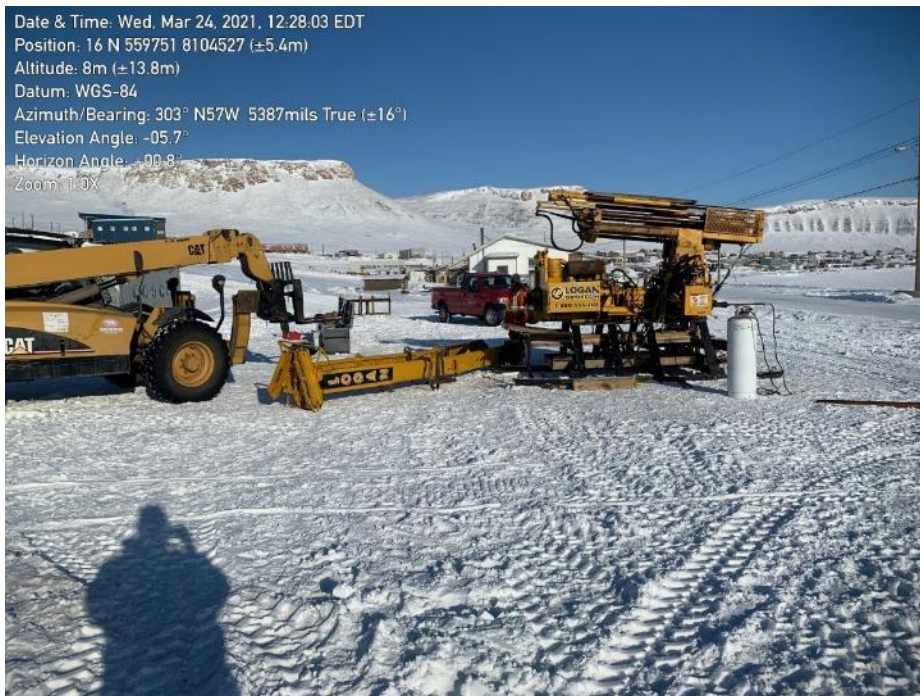
ᐅᓄᑦᕈᑦᕋᑦ ᐸᓂᑦ Logan Drilling ᐱᓇᕆᑦᕈᑦᕋᑦ ᐸᓂᑦ ᐭᓂ 24, 2021