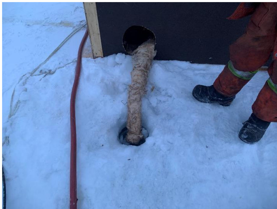
ᐱᕈᕐᑭᐅᕐᑦ 10 ᐃᓯᓯᐅ ᐱᕈᑦ ᑕᓯᓯᐅ ᓯፆᑦᑕᓯᐅ ᐃᐃᐤᑦ 5, 2021