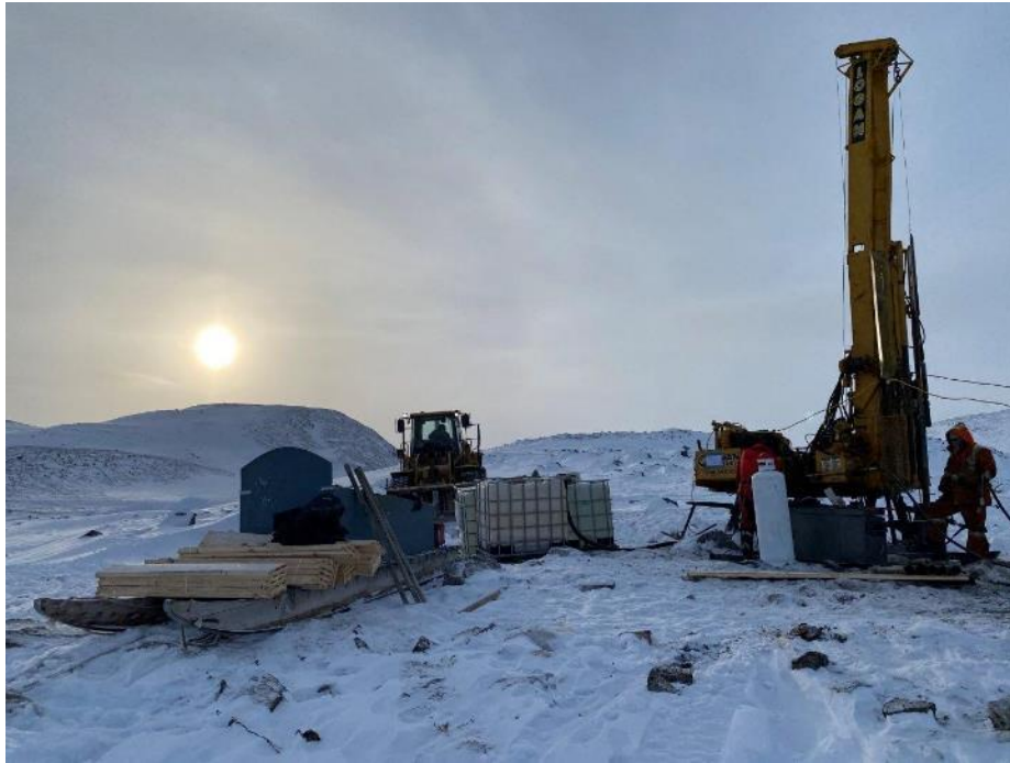
ᐃᑭᑭᑦᐱᑦᐱᑦ 15 ᐃᑭᑭᑦᐱᑦᐱᑦ ᐃᑭᑭᑦᐱᑦᐱᑦ BHQ21-01, ᐃᐃᐃᑦ 6, 2021