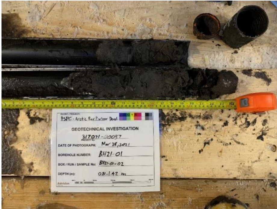
ᐊᓴᔭᐱᑦ Ꮜᐅᑦᑐᑦᐅᓯᐱᓂᑦ ᑲᐅᓴᑦᕐᕈᓪᐳᓂᑦ ᐃᓄᓂᕐᕈᓂ 0.81 – 1.42ᑦᐅᑦ Ꮜᐅᑦᑐᑦᐱᑦ BH21-01-02, ᐤ 28, 2021