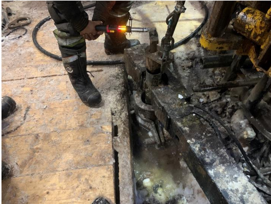
ᐅᓂᕈᕋᕐ ᐱᕈᕐ ᐸᕈᕐ ᐸᕈᕐ BH21-07, ᐭᕈ 31, 2021