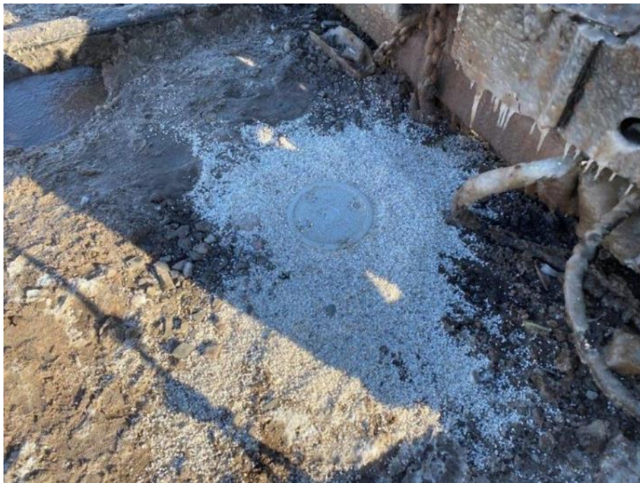
ᐃᑭᑭᑦᐱᑦᐱᑦ 16 ᑭᐃᑭᑦᐱᑦᐱᑦ ᐃᑭᑭᑦᐱᑦᐱᑦ BH/MW21-10, ᐃᐃᐃᑦ 8, 2021