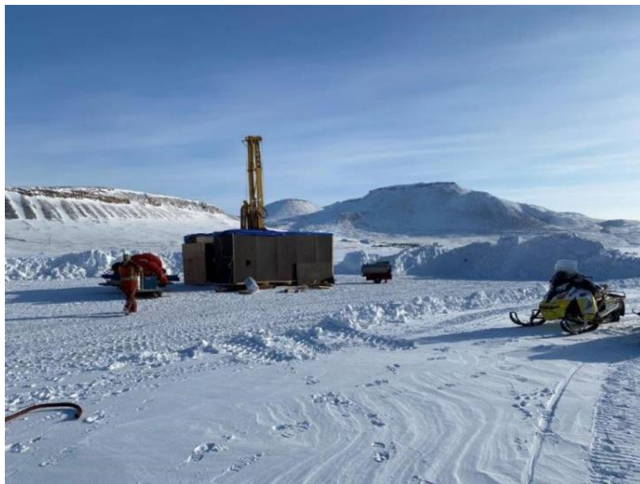
ᐃᑭᑭᑦᐱᑦᐱᑦ 6 ᐃᑭᑭᑦᐱᑦᐱᑦ ᐃᑭᑭᑦᐱᑦᐱᑦ BH21-02, ᐃᑭ 28, 2021