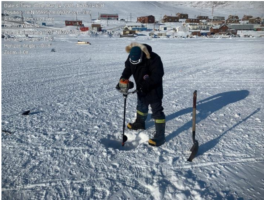
ᐃᓴᑦᕐᕈᐃᓂ 1 ᓂᐃᓪᕐᕋᕋᐅᐊᕐ ᐱᐃᐭ, ᐤ 24, 2021