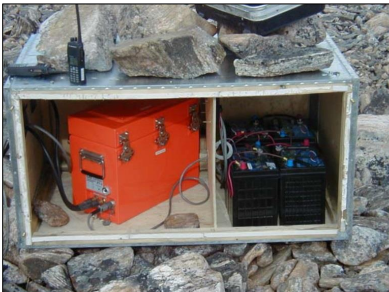
Figure 3. Qorbignaluk repeater site (left); Tuluria's battery array and transmitting equipment (right).