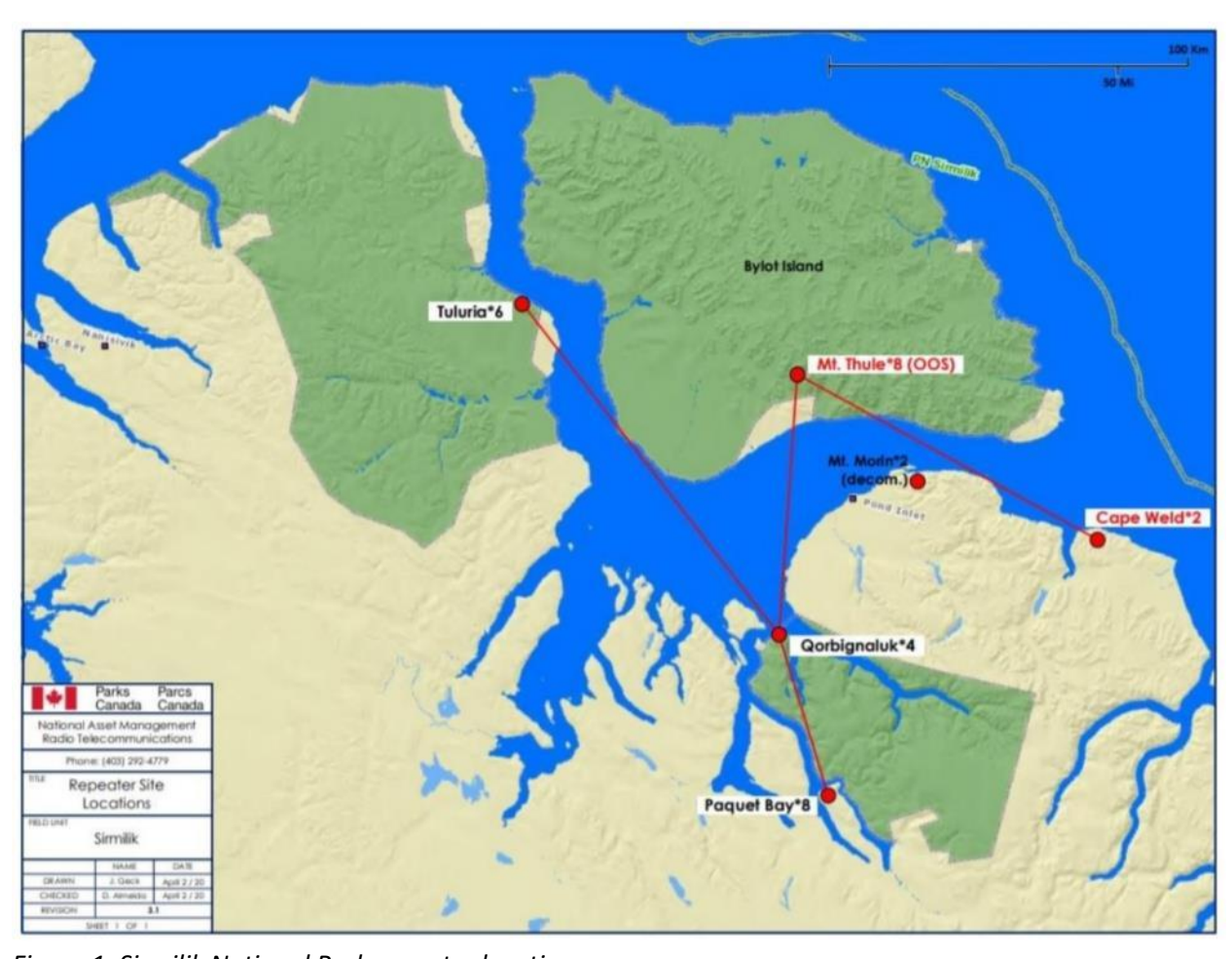
Figure 1. Sirmilik National Park repeater locations.

As of 2021, SNP manages 5 repeater stations (Figure 1), which support regional VHF radio use by staff and local Search and Rescue. These repeaters pick up radio communications and retransmit them across a much wider area (dozens of kilometers) than would be possible with only radio-to-radio contact, which requires a direct line of sight and may only reach a few kilometers. Repeaters have been strategically located at high elevation points to allow maximum coverage in the park and adjacent areas.