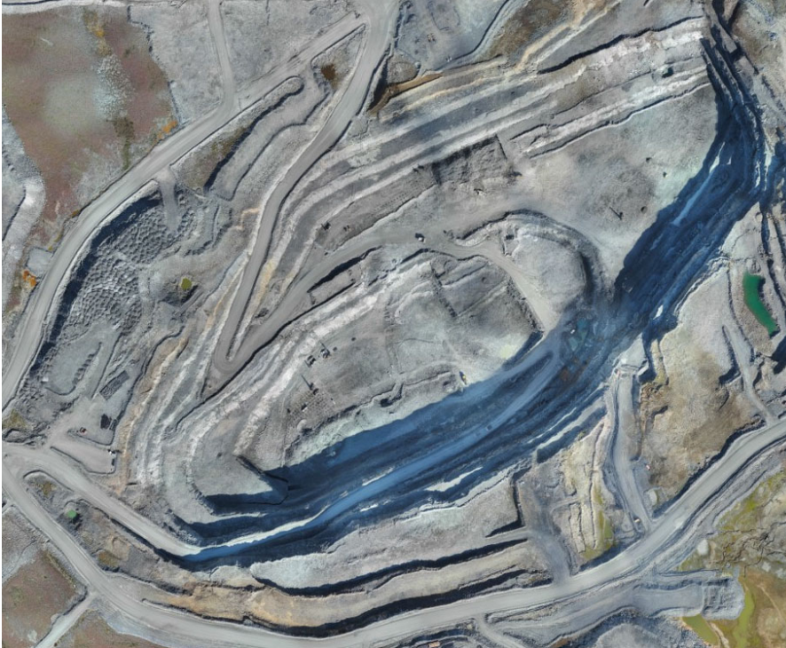
Figure 1-2 Aerial photo of Whale Tail Pit (Summer 2021)

In 2021, Agnico Eagle Mines Limited's Exploration division has only one fuel storage locations related to the NIRB decision #11EN010. The fuel cache was located at the Meadowbank exploration camp and consist of four (4) tanks with a total capacity of 130,500 liters and drum stored in three (3) seacans for diesel and jet fuel. For the Amaruq exploration activities, fuel and jet fuel were supplied by the mine operations.