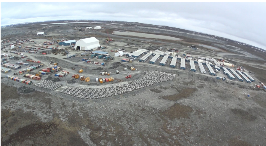
Figure 1-3 Aerial photo showing Whale Tail camp infrastructure (Summer 2021)