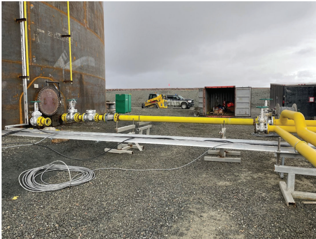
Tank #8 piping installation