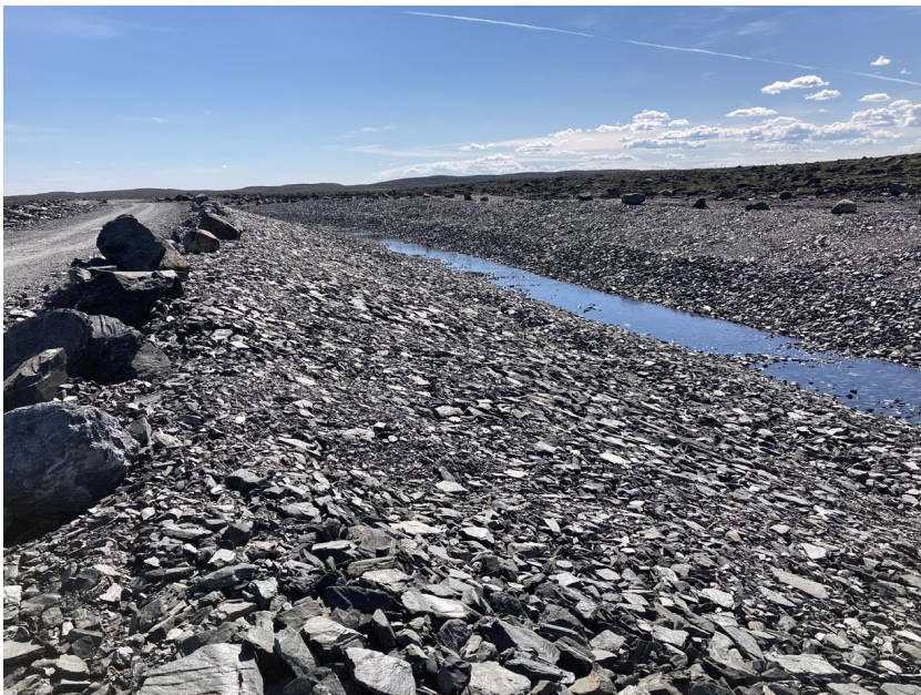
Photograph H10-4 South Whale Tail Channel

Description: From approx. Sta. 0+800, looking northwest.