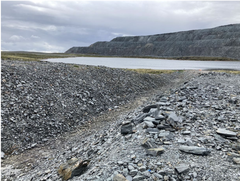
Photograph H2-3 Diversion Ditch and its Sediment and Erosion Protection Structure