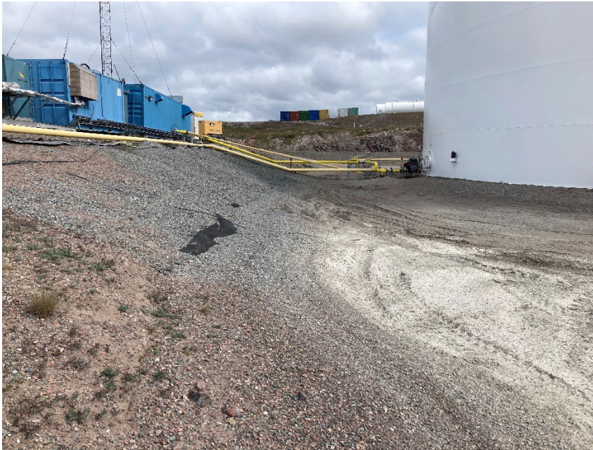
Photograph G1-1 Baker Lake Tank Farm