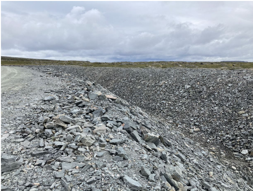
Photograph H2-4 Diversion Ditch and its Sediment and Erosion Protection Structure

Description: From the eastern diversion ditch looking south toward Lake NP2.