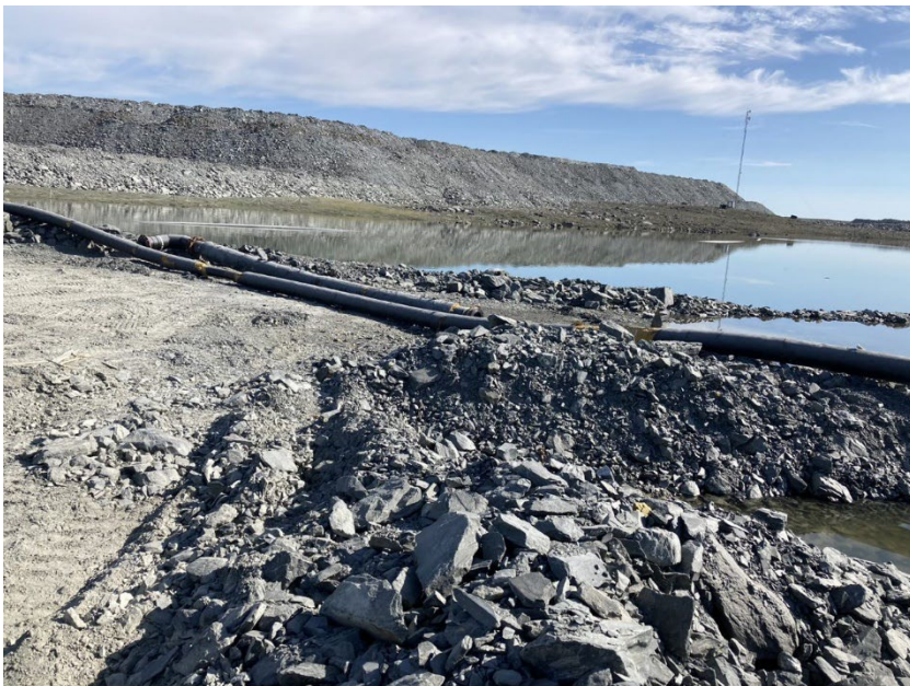
Photograph H8-2 IVR Attenuation Pond Ramp

Description: From the pump pad, looking southwest at the Attenuation Pond.