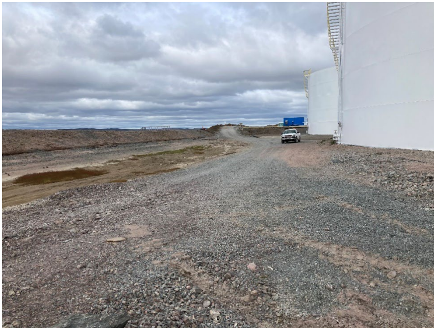
Photograph G1-4 Baker Lake Tank Farm

Description: Looking northwest toward the south wall of the tank farm.