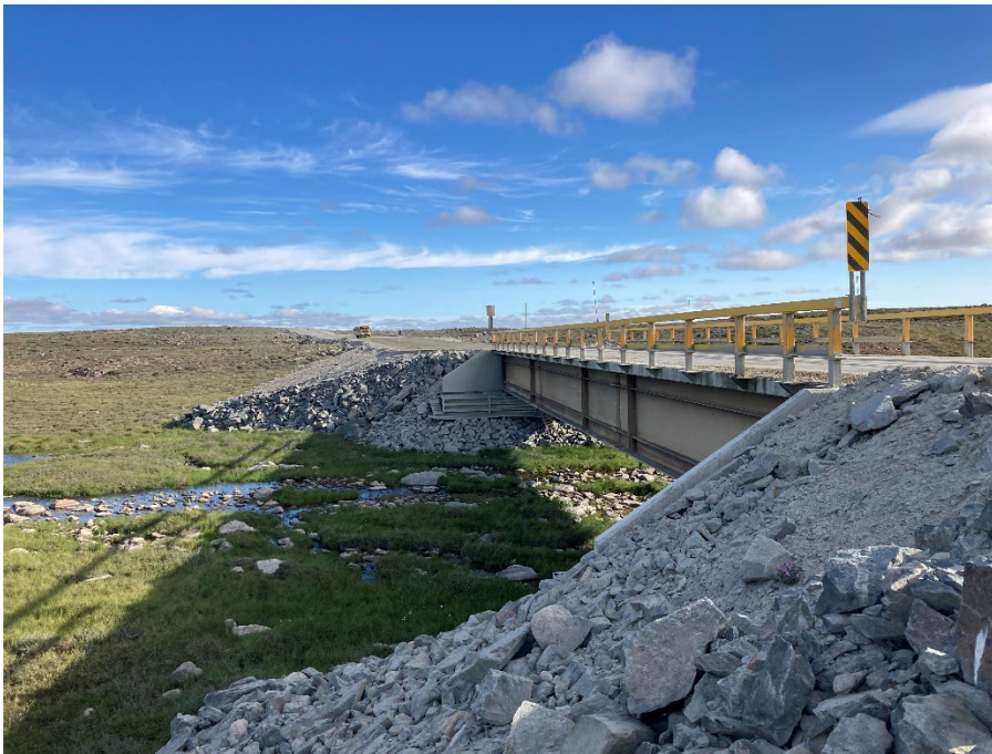
Photograph E2-18 Bridges 9 – km 160+800

Description: Looking at the south abutment.