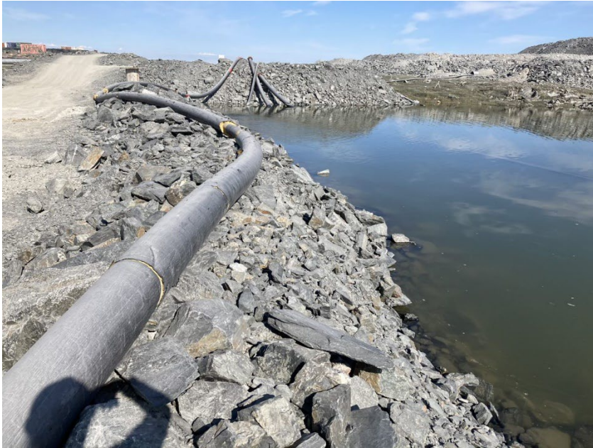
Photograph H8-3 IVR Attenuation Pond Ramp