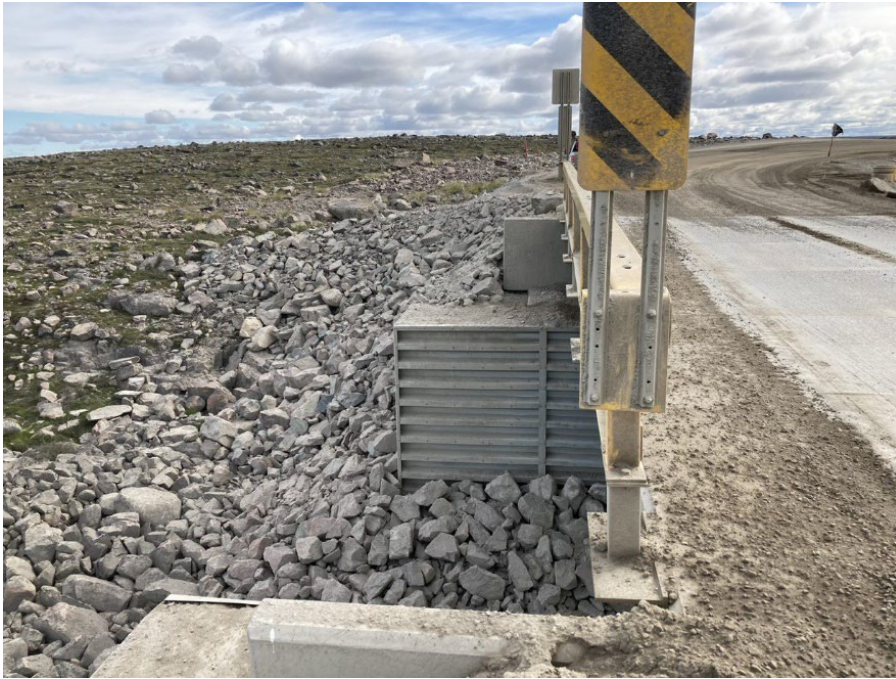
Photograph E2-13 Bridges 6 – km 142+100