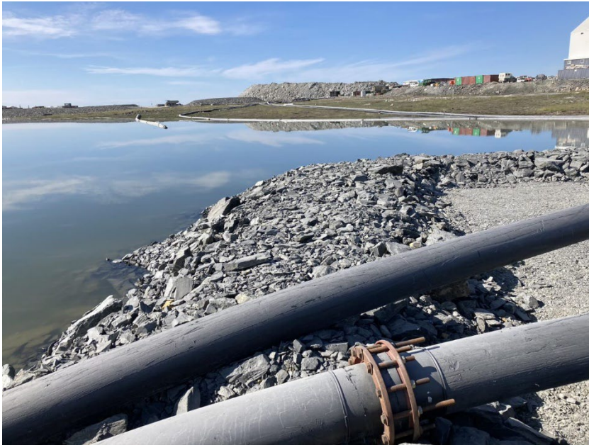
Photograph H8-1 Attenuation Pond Ramp