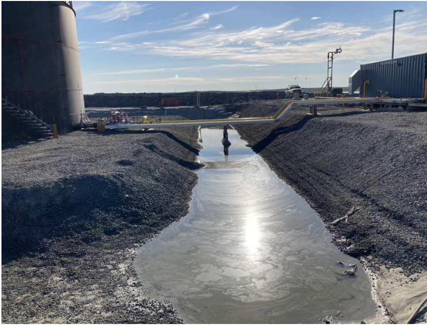
Photograph G3-7 Whale Tail Project Site Tank Farm