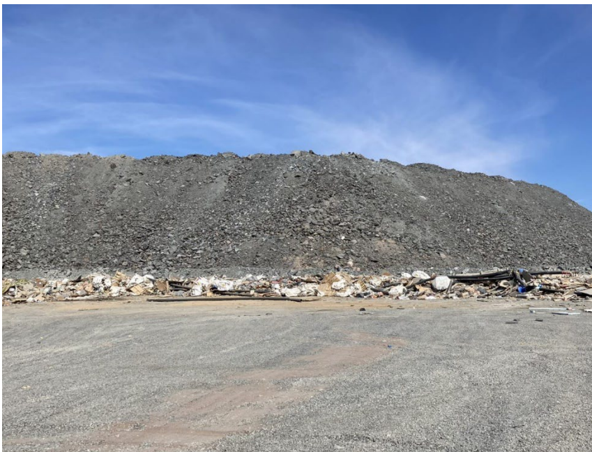
Photograph H4-2 Whale Tail Project Landfill

Description: From the 2020 landfill location within the Rock Storage Facility, looking southeast.