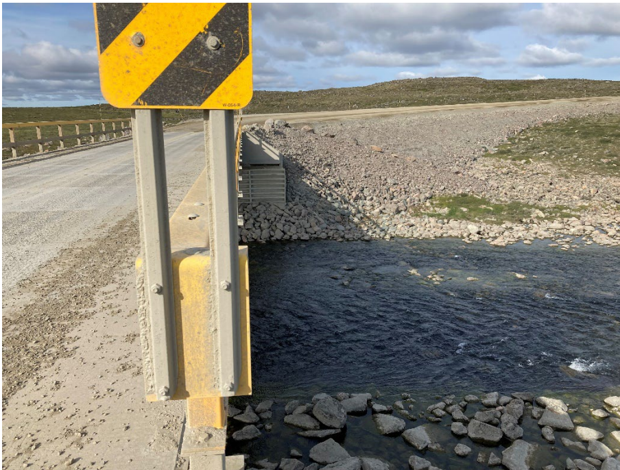
Photograph E2-14 Bridges 7 – km 148+300

Description: Looking at the south abutment.