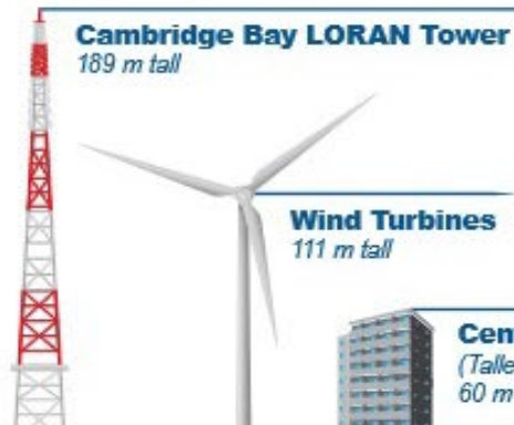
Cambridge Bay LORAN Tower 189 m tall