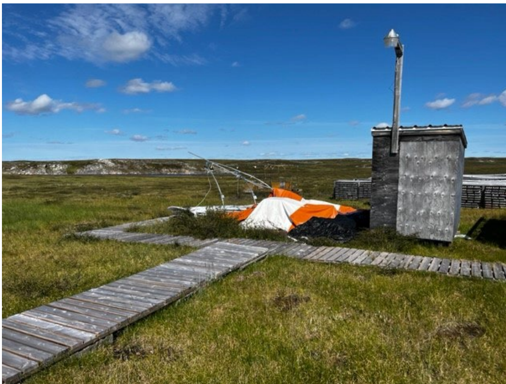
Figure 4 Collapsed geology office