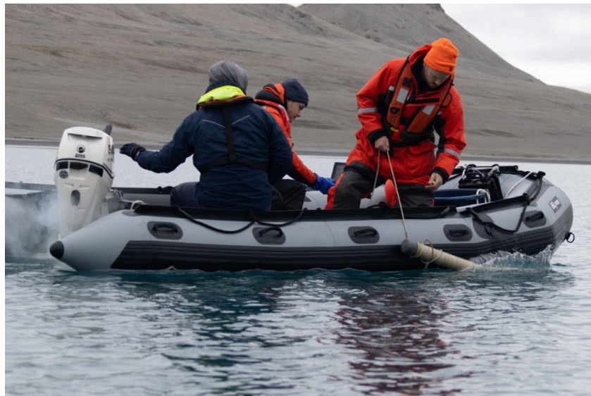
ᐱᓐᓂᐱᓐᓂ 10 - ᐱᓐᓂᐱᓐᓂ (ᐱᓐᓂᐱᓐᓂ) ᐱᓐᓂᐱᓐᓂ AUV-ᓐᓂ ᐱᓐᓂᐱᓐᓂᐱᓐᓂ