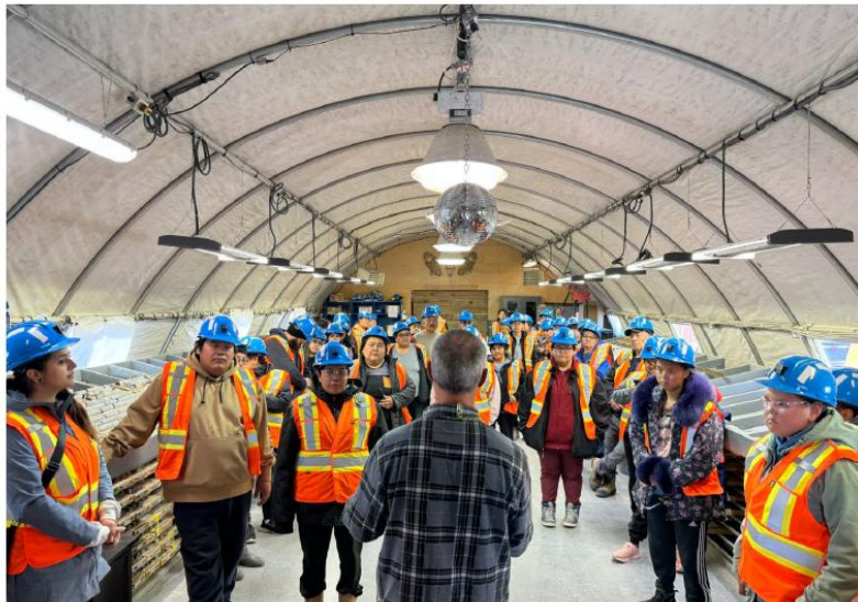
Site Visit at Meadowbank with Baker Lake Public (September 7 th , 2024)

No concerns were shared regarding Regional Exploration activities.