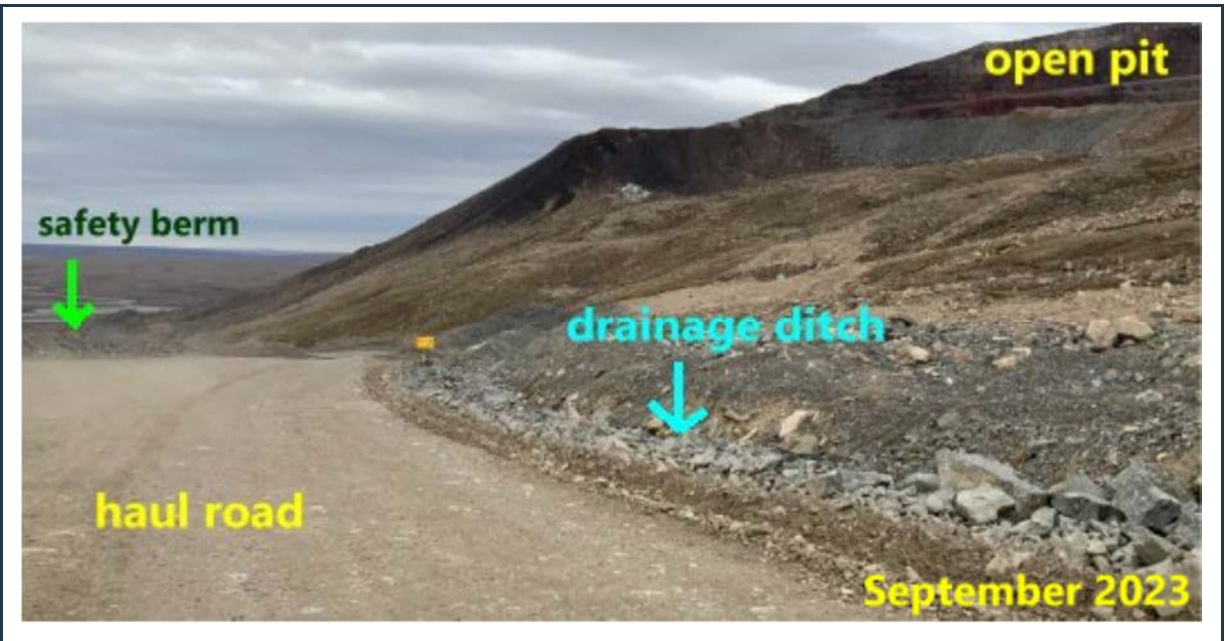
Figure 116: View of a 2023 image of the well-maintained haul road between the crusher pad and the open pit around KM-107. Note the safety berm along the downslope side and the upgraded, erosion-controlled drainage ditch along the upslope side of the road with additional rock fill in critical areas.