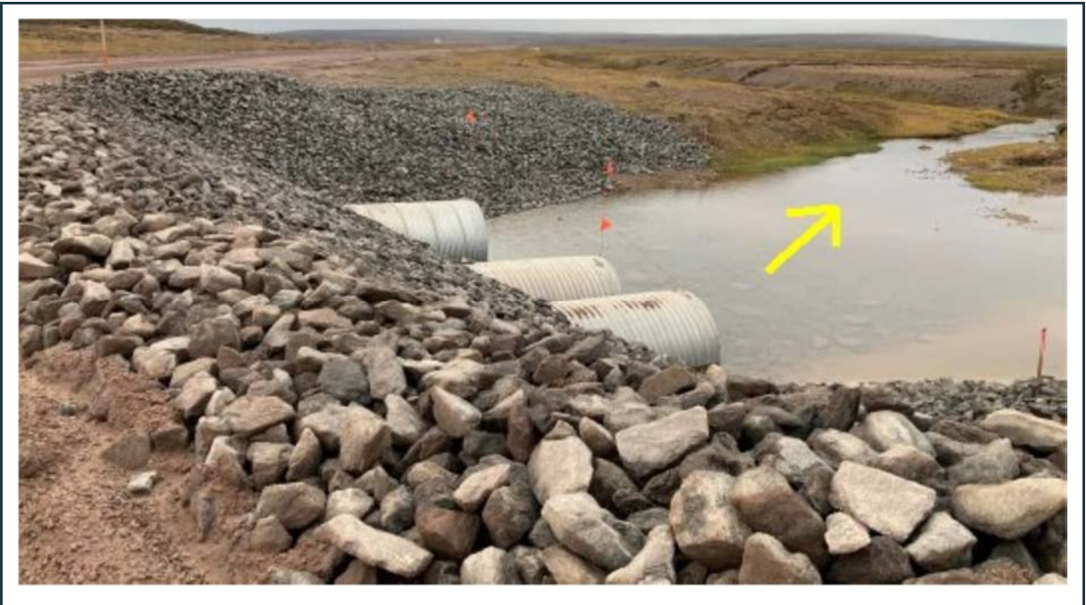
Figure 115: View of the outlet of three culverts at KM 94+060, in good condition.