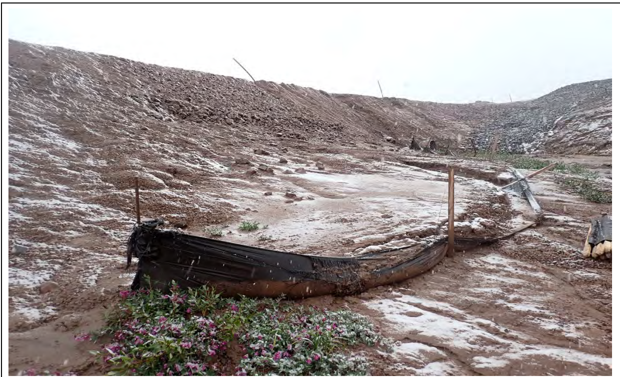
Photo 40. BG-01 upstream, silt fence in disrepair.