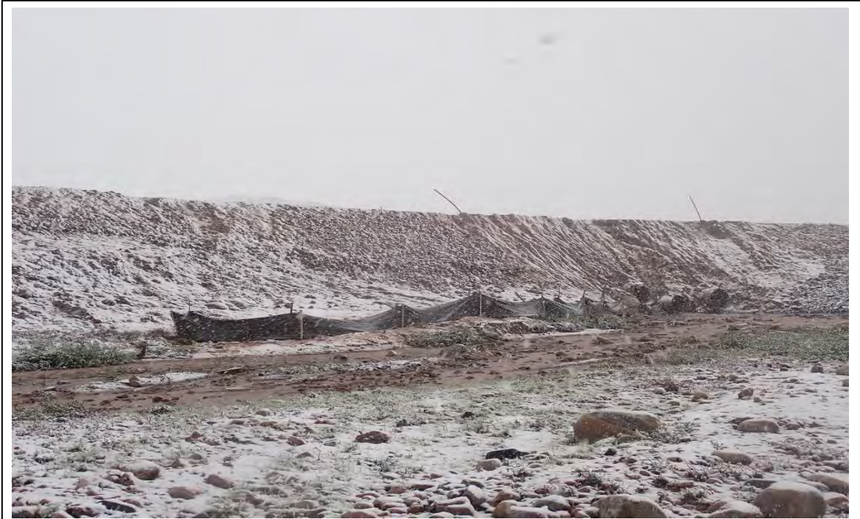
Photo 41. BG-01 upstream, silt fence replaced.