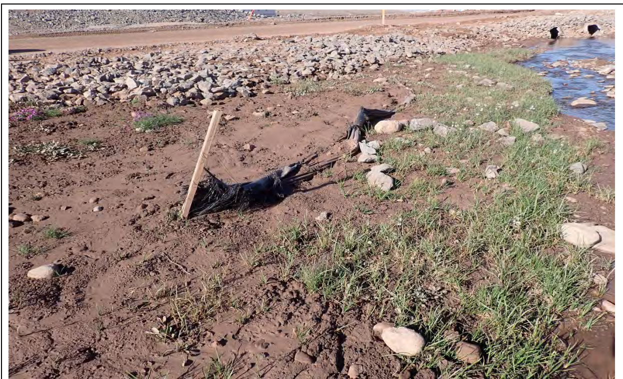
Photo 42. CV-186 upstream, silt fence along south bank in disrepair.