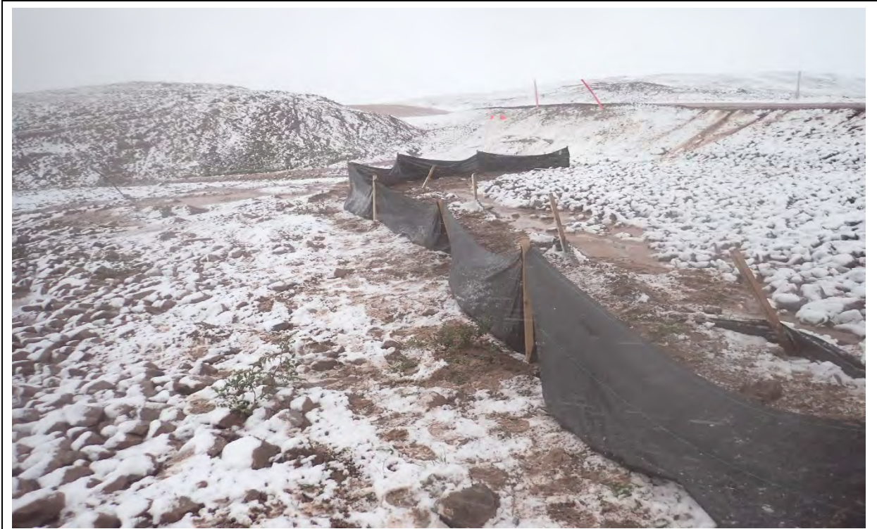
Photo 39. CV-224 downstream, silt fence replaced.