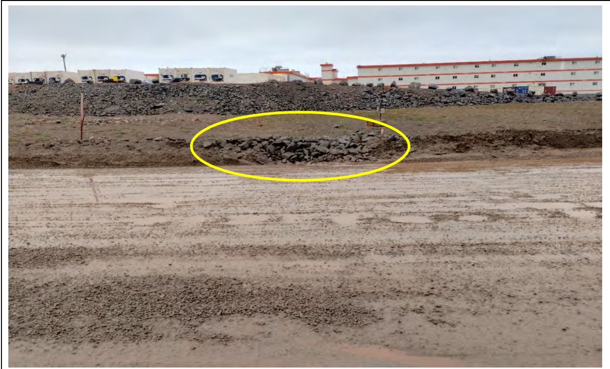
Photo 45. CV-186 downstream, rock armouring of roadside berm.