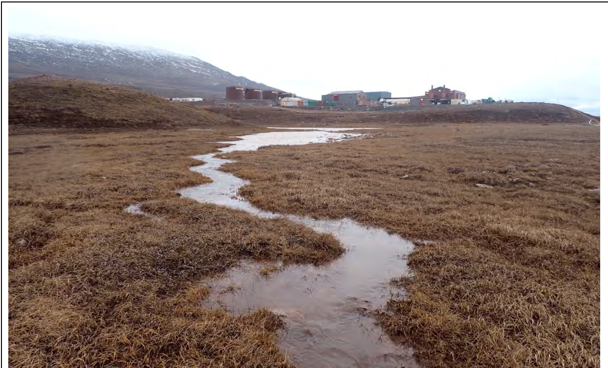
Photo 46. CV-187 upstream, turbid water approximately 140 m upstream of CV-187 due to rain event.