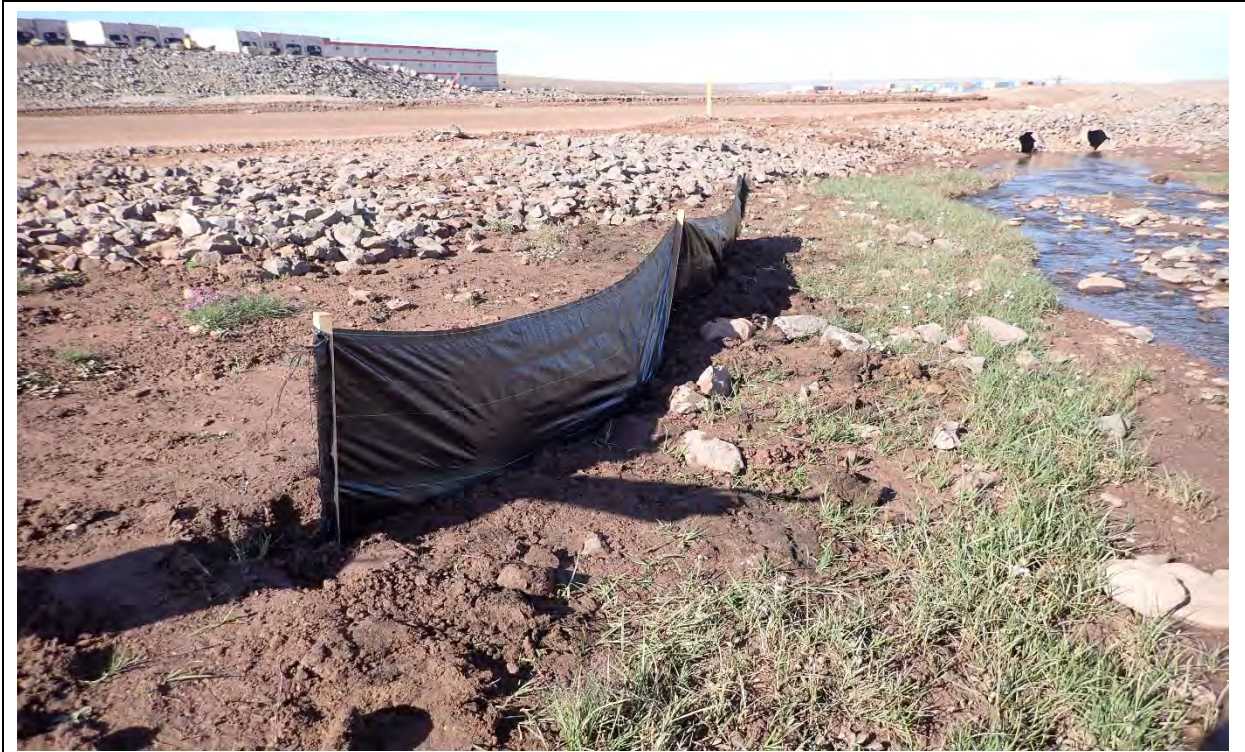
Photo 43. CV-186 upstream, silt fence along south bank replaced.