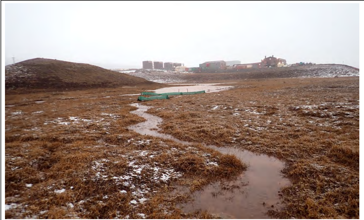
Photo 47. CV-187 upstream, spring berms installed approximately 140 m upstream of CV-187 due to rain event.