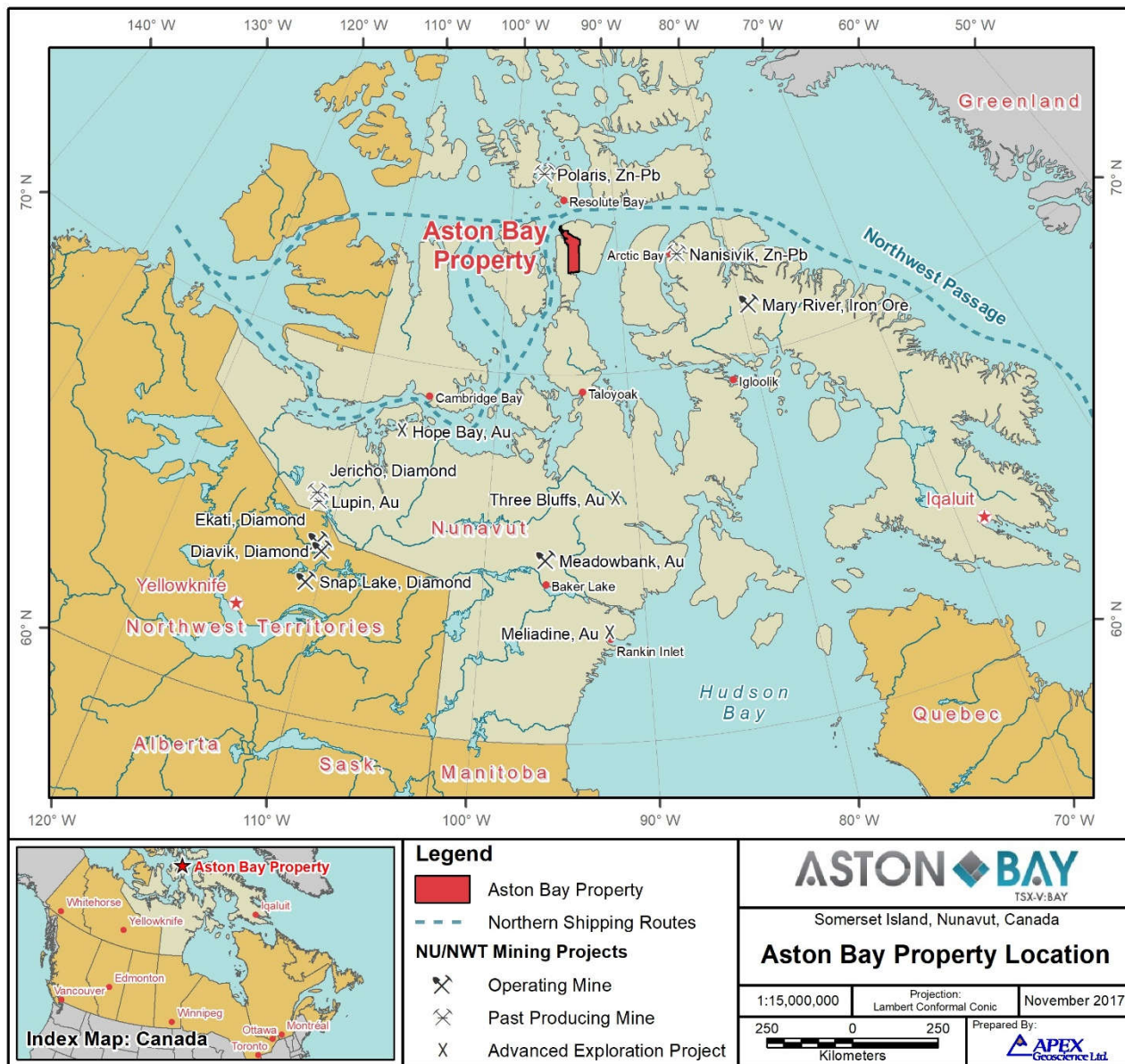
Figure 1 Aston Bay Property Location