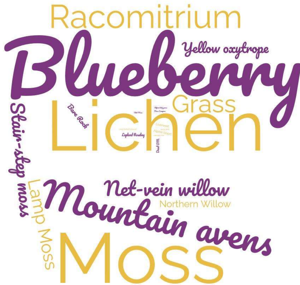
Figure 1: Word cloud representing ground cover at the vegetation monitoring site. Text is scaled by abundance.